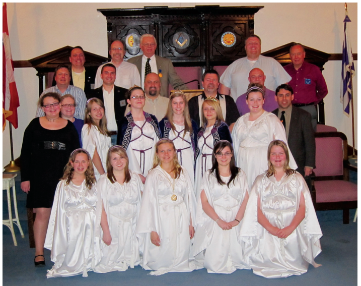
Anoka Masons “Road-Trip” to Bethel #48 Meeting in May