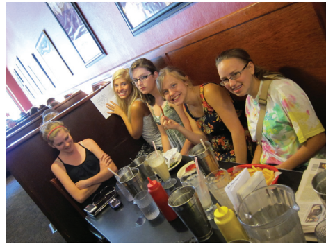
Jobies stop for malts after their visit to Acacia Cemetary

On Memorial Day, several of us traveled to Acacia cemetery for a lovely service. It is a great way to remember the Veterans that have served our country.