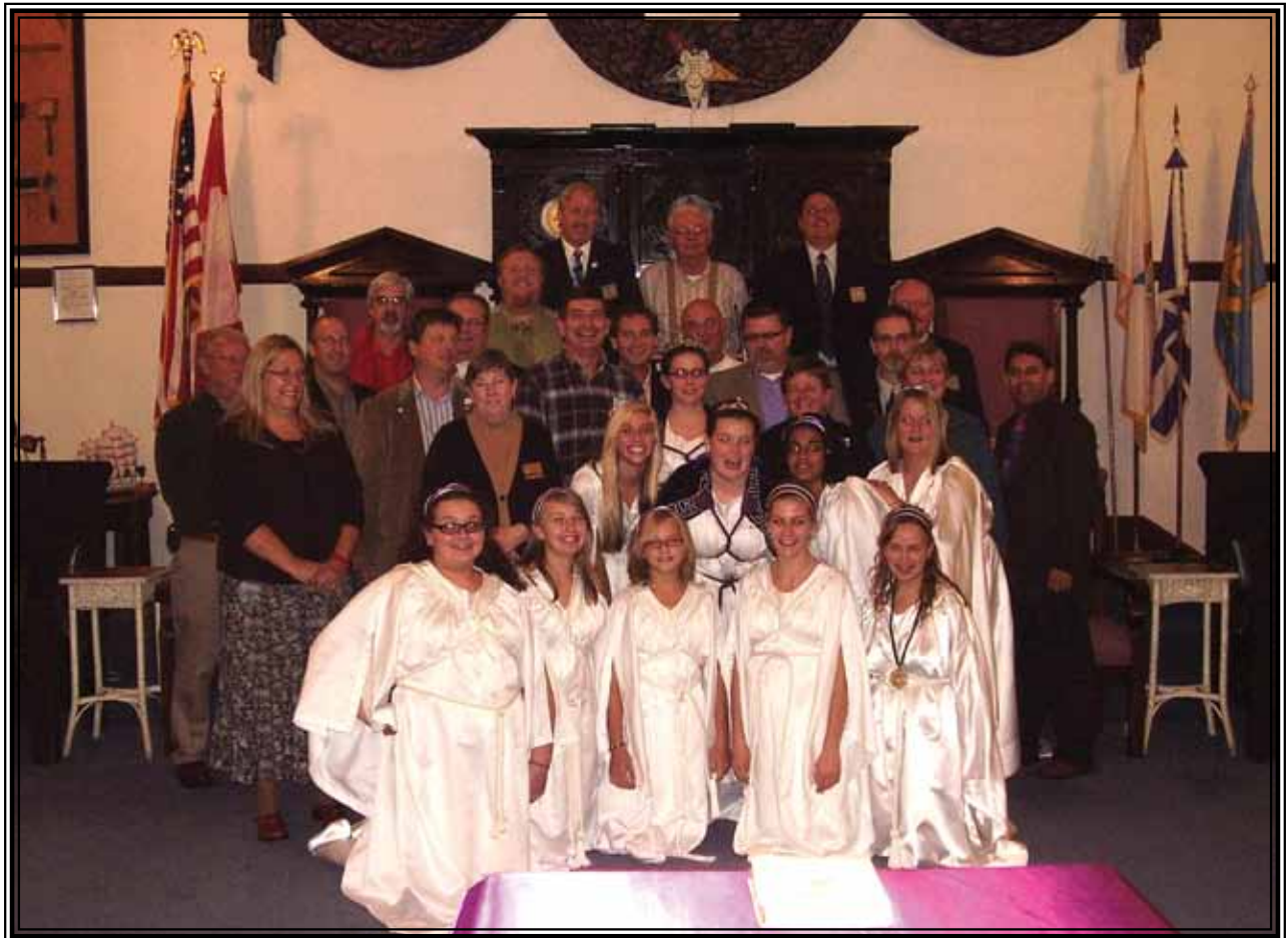
A wonderful turnout for the Jobies Masonic Honoring in October