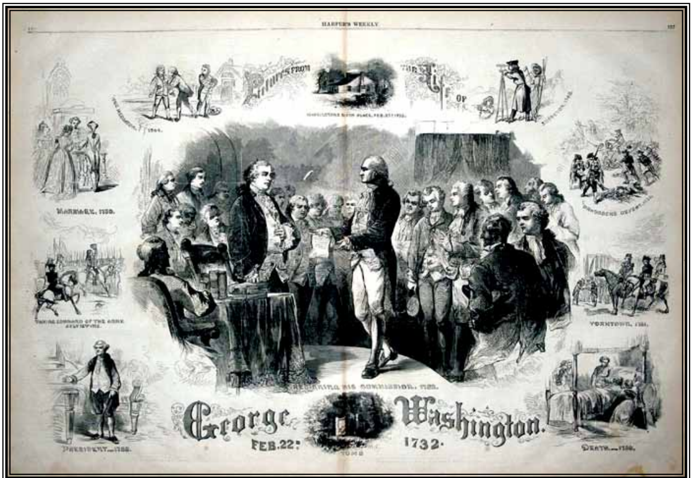
George Washington Tribute from the Harper's Weekly Newspaper, 1864