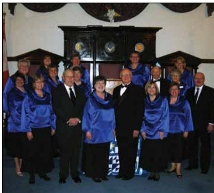
2011 Order of the Eastern Star Officers