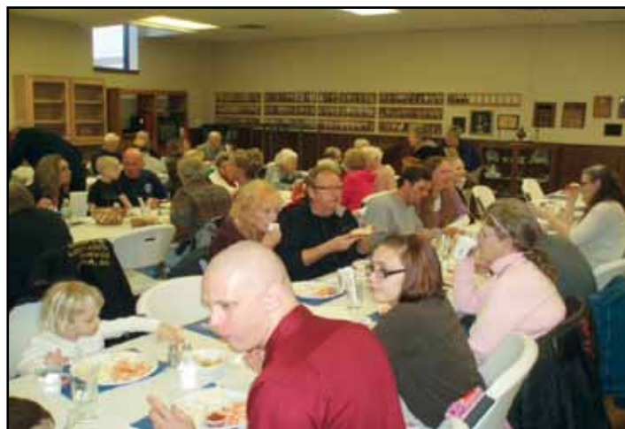
On April 22nd Anoka Lodge again held it's Annual Shrimp Dinner.