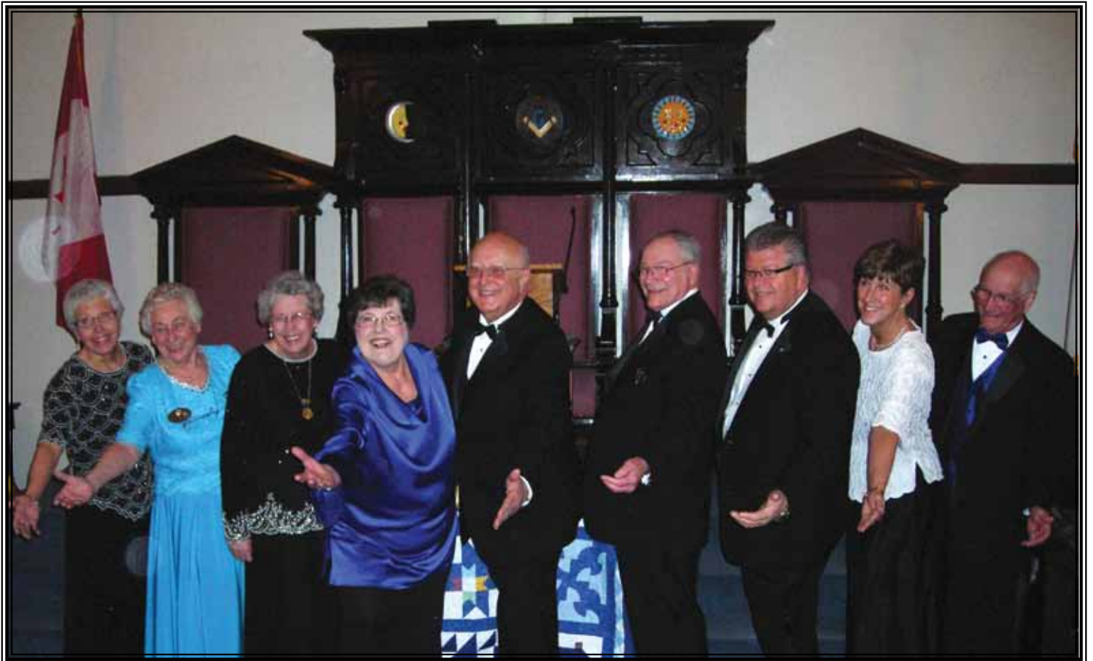
Installation Officers of the Anoka Order of the Eastern Star