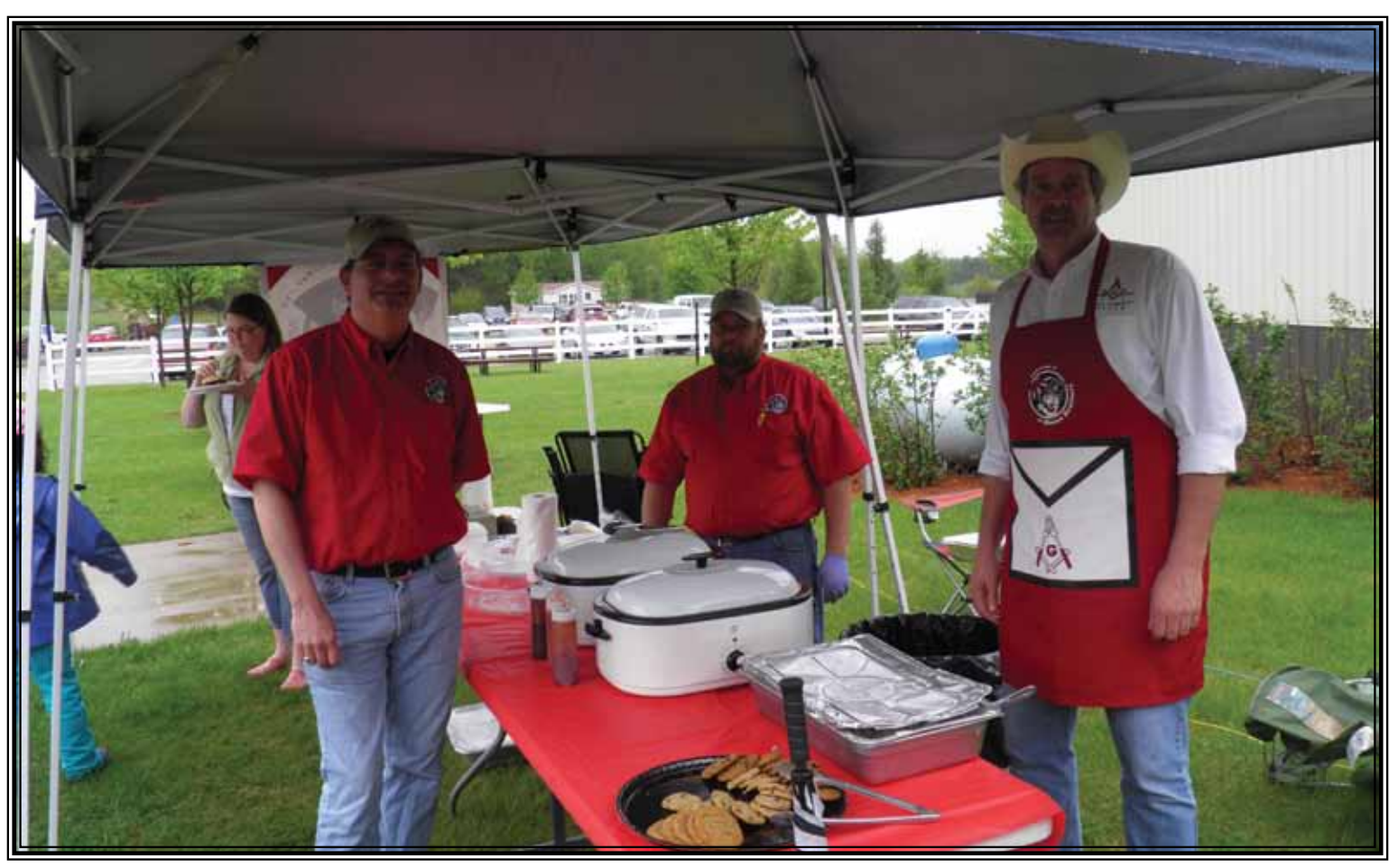
The Bones Brothers Serving up Ribs at the Stable Pathways Fundraiser at Bunker Park