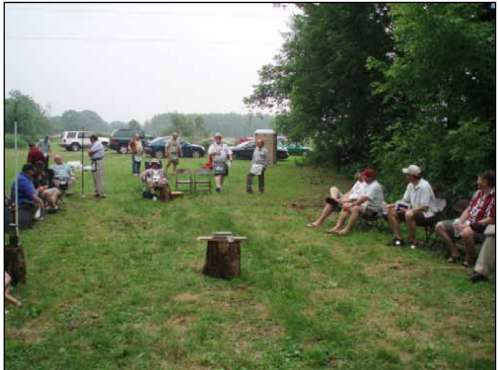
Getting ready for the Outdoor Degree , looking to the West.

For July we have Rverfest coming up as well as the great Anoka County Fair! Be sure to sign up early if you want to get your favorite time slot for the Fair booth, I'm told we will have a new and exciting display there this year. If you haven't been before you should definitely plan on joining us this year. See you in hawaiian shirts and shorts for July and August!