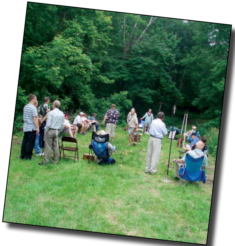
Getting ready for the Outdoor Degree, looking to the East.

Thank you to everyone who came and helped out!!!