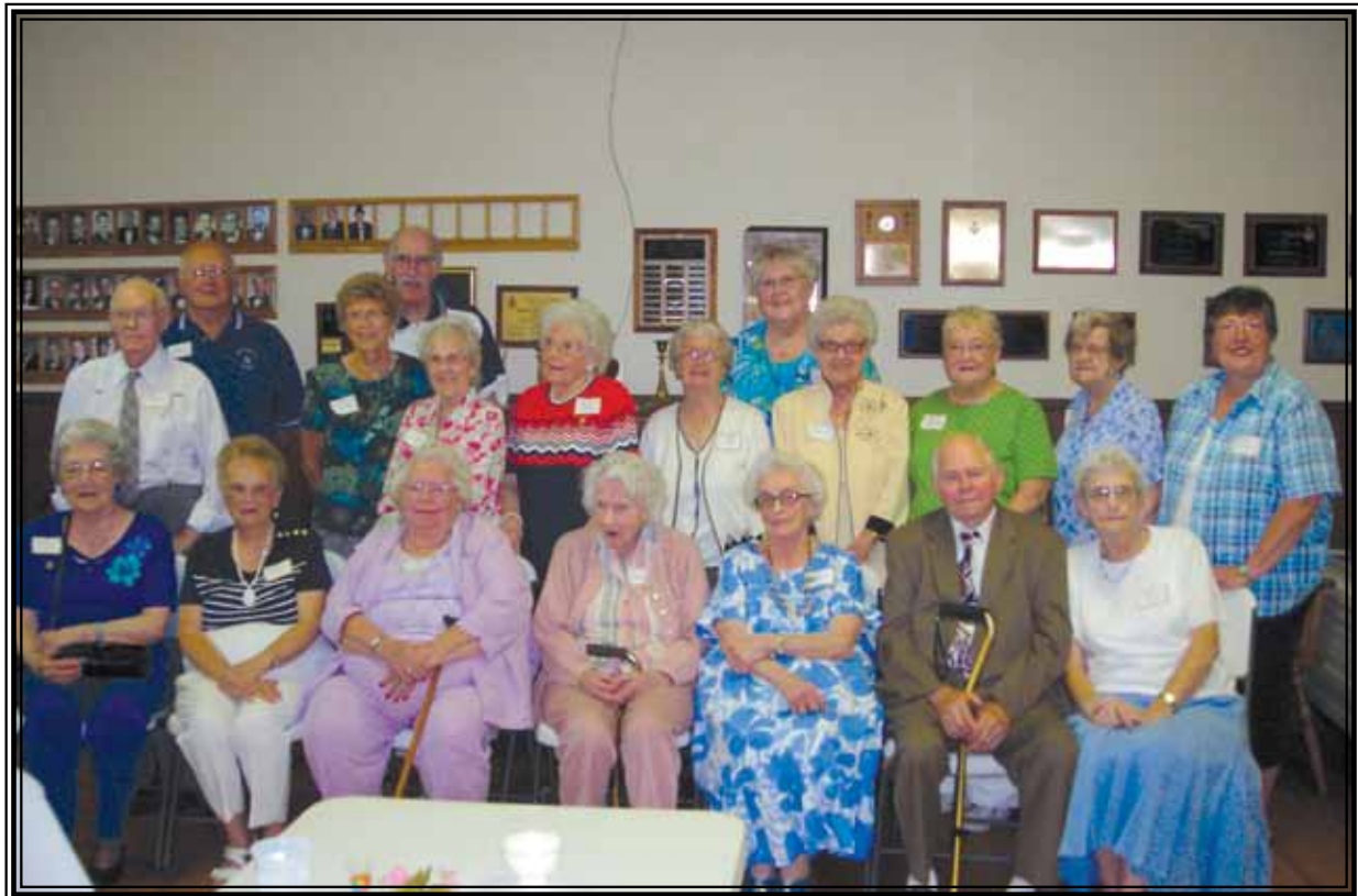
Anoka's Order of the Eastern Star Honors its 50-year Members