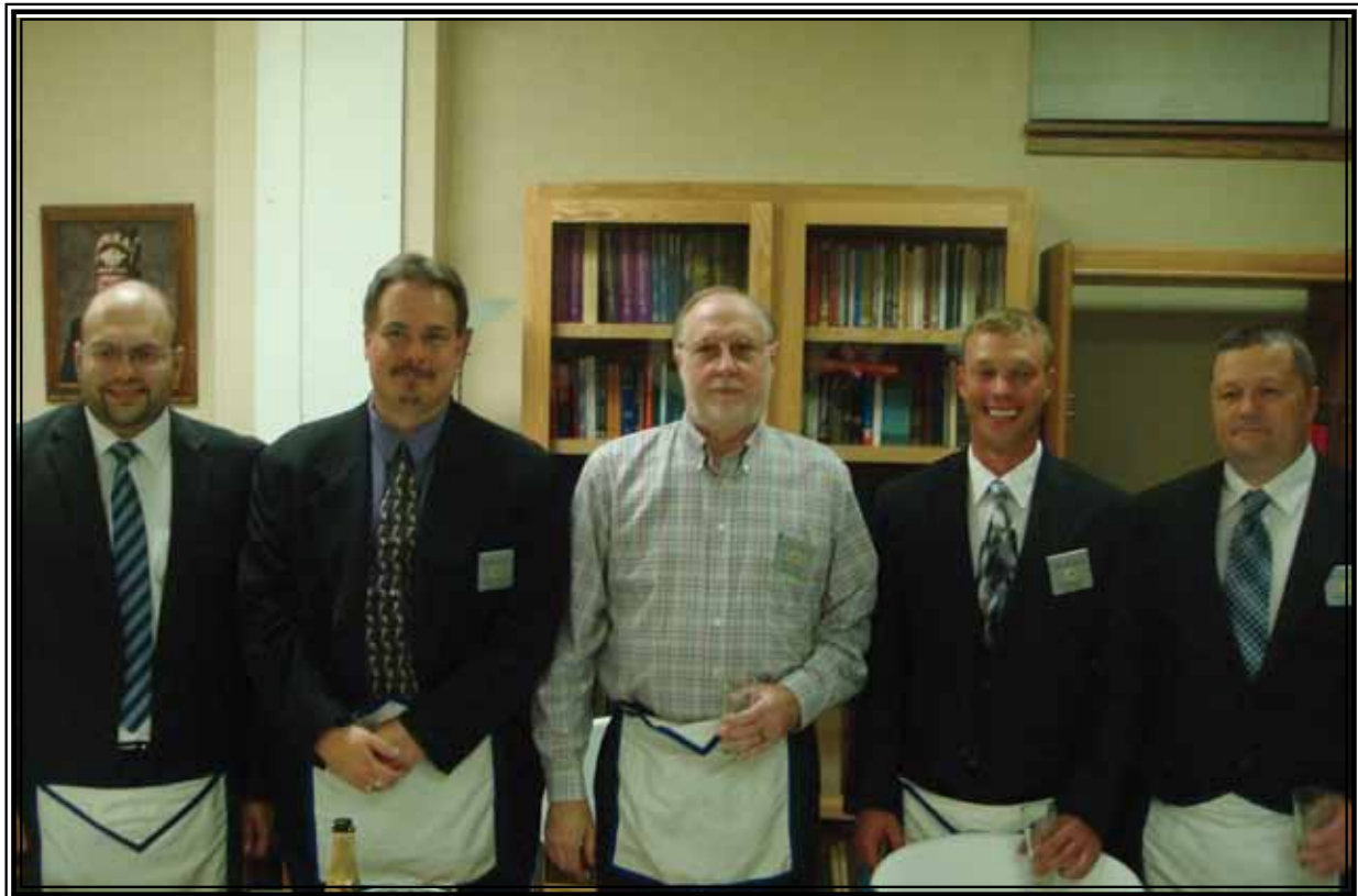
Anoka welcomes it's newest Masons at the 2011 Entered Apprentice Table Lodge