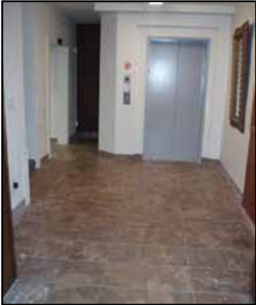
The floors in the Anoka Lodge building have received a much needed facelift! Come see for yourself.