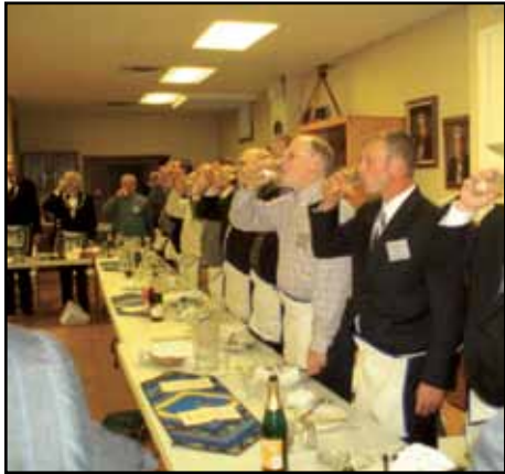
Fire Cannons! A toast at the E. A. Table Lodge

November 16 Dinner at 6pm, Degree work at 7pm