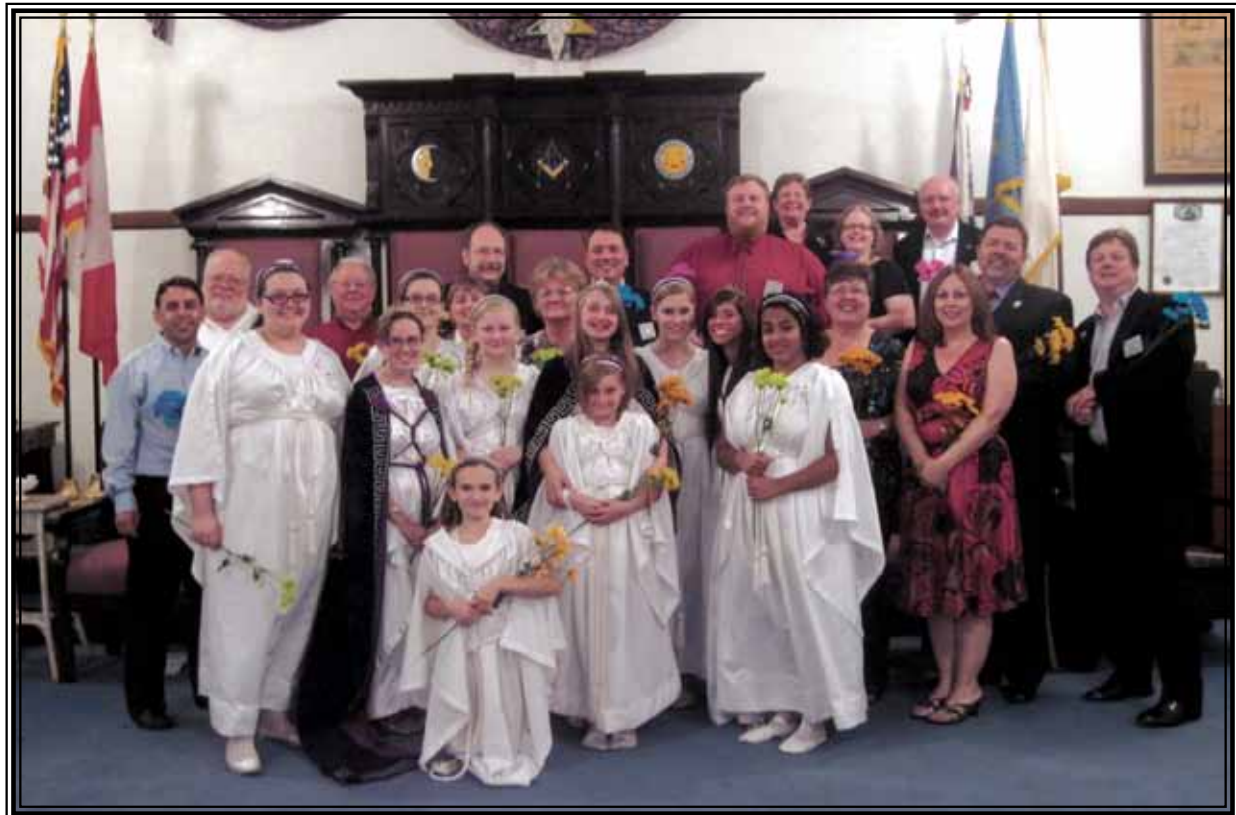
Jobies Masonic Honoring at Anoka Lodge #30