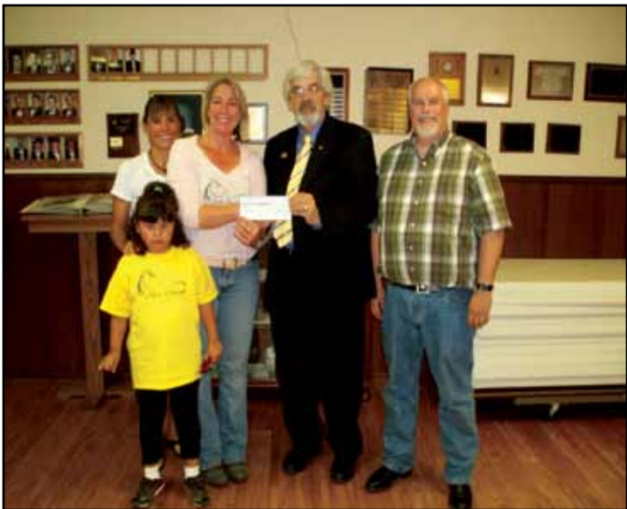
Anoka Lodge presents a check to We Can Ride to help with costs for the 'Make the Impact' event. Overall the event raised nearly $40,000- Way to go!