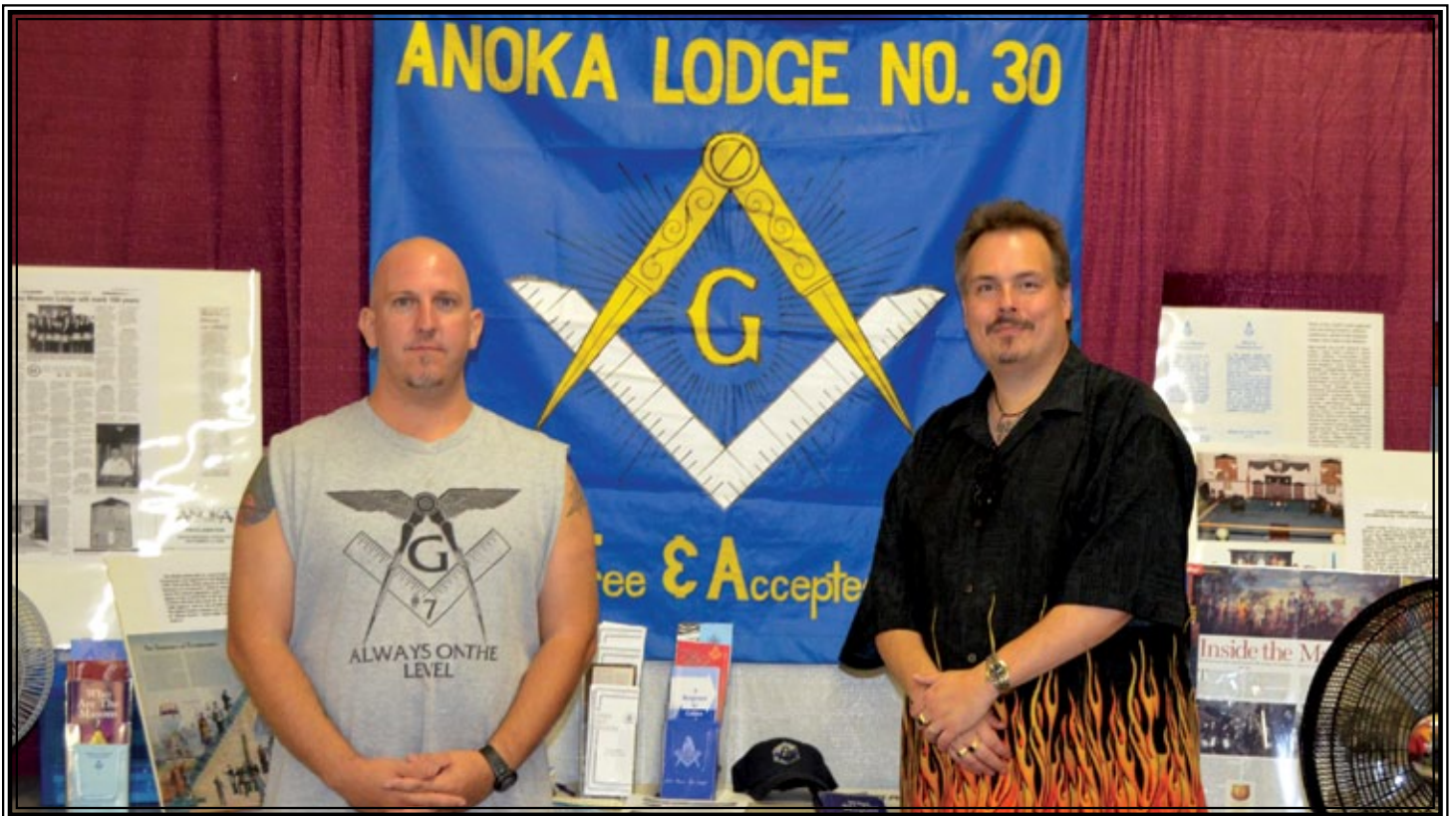
Anoka Brothers xxxxxxxxxxxxxxxxxxxx Sharing Masonic Light at the Anoka County Fair

NONPROFIT ORG US POSTAGE PAID ANOKA, MN PERMIT NO. 79