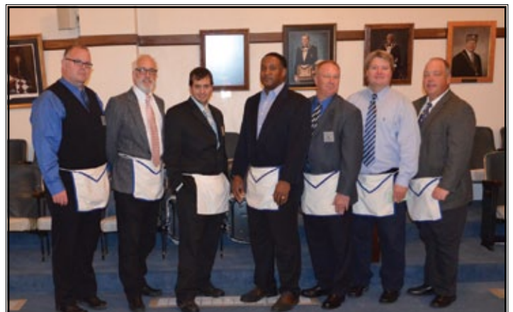
Anoka Lodge's Fellowcraft