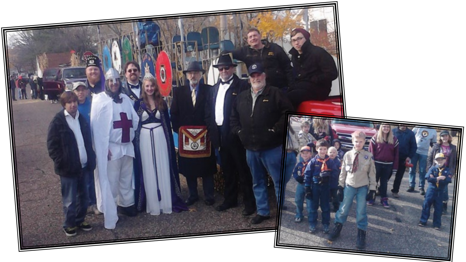
Anoka Masonic Families at this year's Halloween Parade, with help from our Cub Scout Pack #518

NONPROFIT ORG US POSTAGE PAID ANOKA, MN PERMIT NO. 79