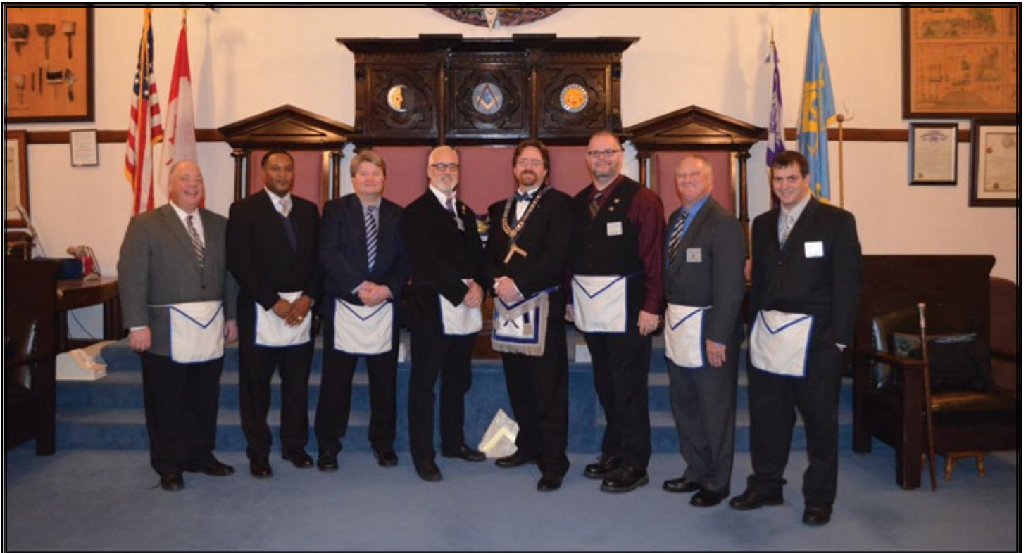
Another fine crop of newly raised Master Masons at Anoka Lodge #30

NONPROFIT ORG US POSTAGE PAID ANOKA, MN PERMIT NO. 79