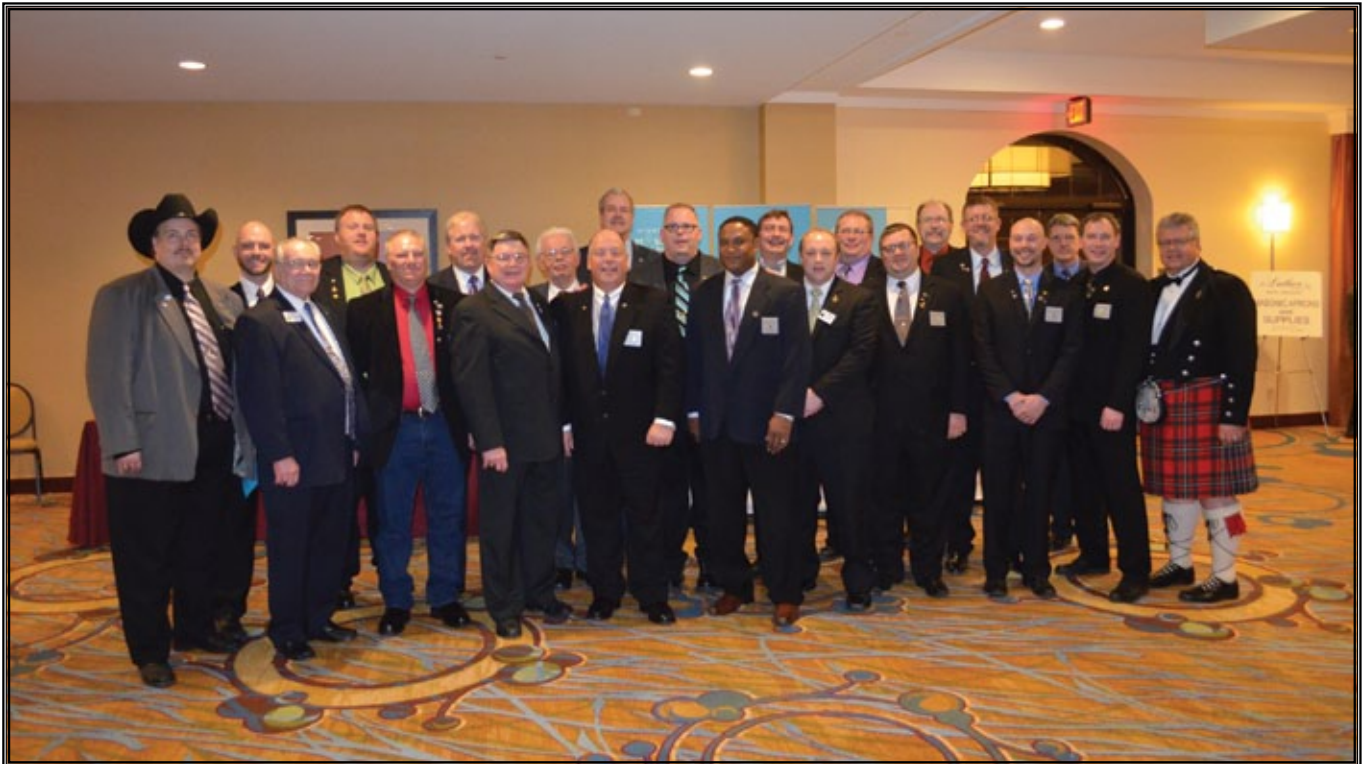
As always, Anoka Lodge #30 was well represented at the 2013 MN Grand Lodge Communication

NONPROFIT ORG US POSTAGE PAID ANOKA, MN PERMIT NO. 79