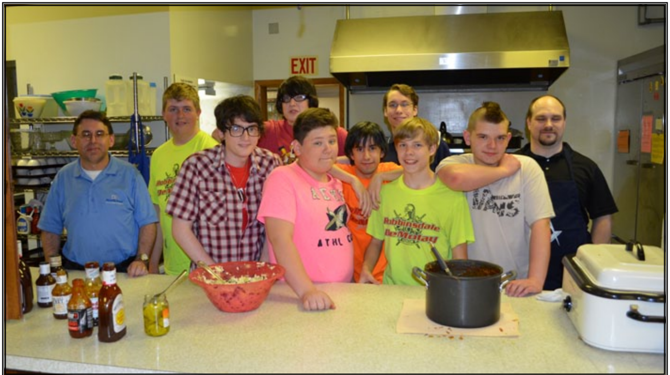
The fine young men of the DeMolay served up dinner for the Brethren

NONPROFIT ORG US POSTAGE PAID ANOKA, MN PERMIT NO. 79