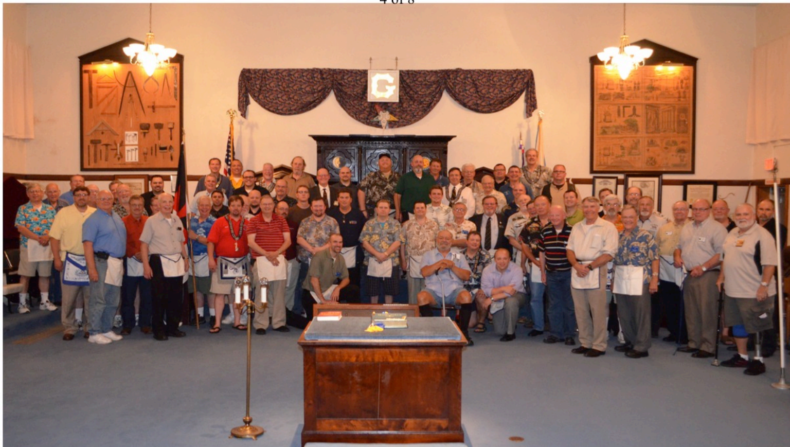
The Anoka Lodge #30 August 7th Stated Meeting had an amazing turn out! 72 Brothers all in one room on a very warm summer evening. It was something to see and also shows the the Brotherly love that Anoka #30 has. Thank you to everyone that came out for this!!