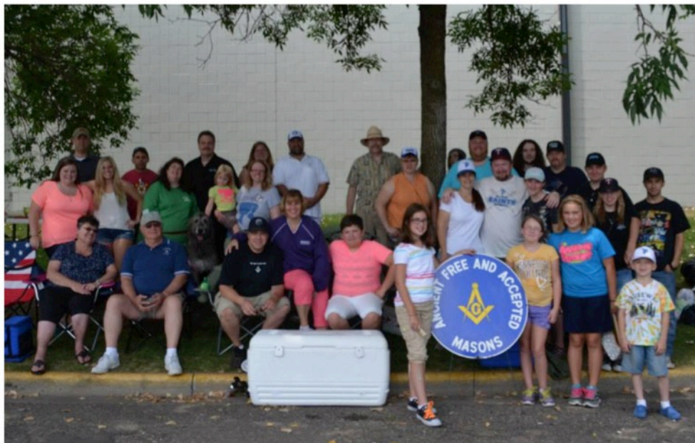
Fun had by all at the St. Paul Saints game!

NONPROFIT ORG US POSTAGE PAID ANOKA, MN PERMIT NO. 79