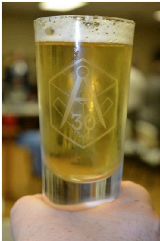
Anoka Lodge Cannon