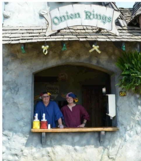
Renaissance Festival onion ring and lemonade stand

October 7th : Anoka-Shekinah will be performing the Past Master Allegory for possibly the final time this year at Northeast Winslow Lewis Lodge during the stated meeting. If you have not had a chance to see the Allegory being performed earlier this year, then you wont want to miss it!