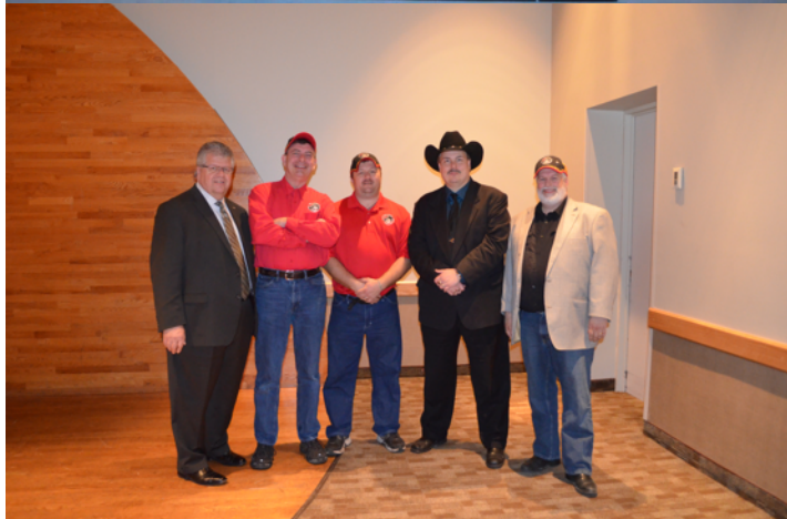
Bones Brothers at the We Can Ride Make the Impact Dinner