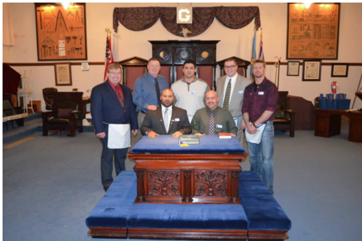
The beautiful new Altar!

NONPROFIT ORG US POSTAGE PAID ANOKA, MN PERMIT NO. 79