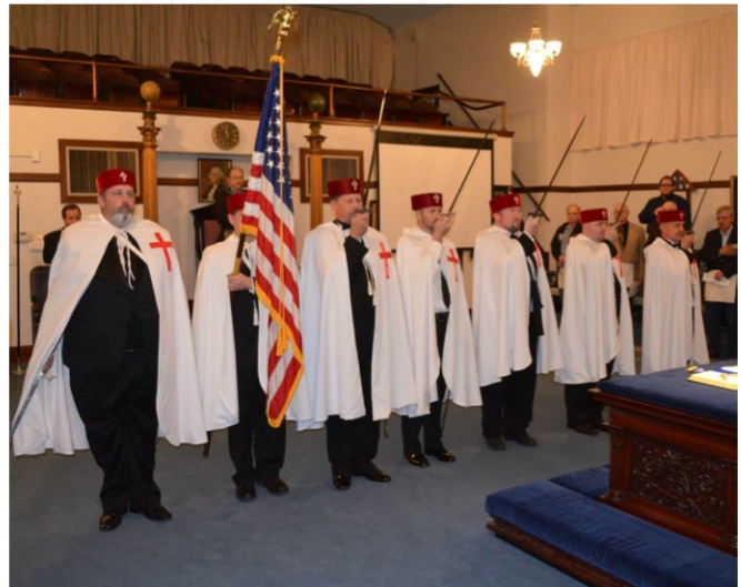
The Knights Templar did a beautiful presentation of the colors at Anoka Lodge #30 on May 7, 2014.