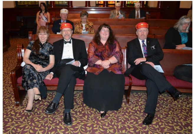
A beautiful evening was had by all!