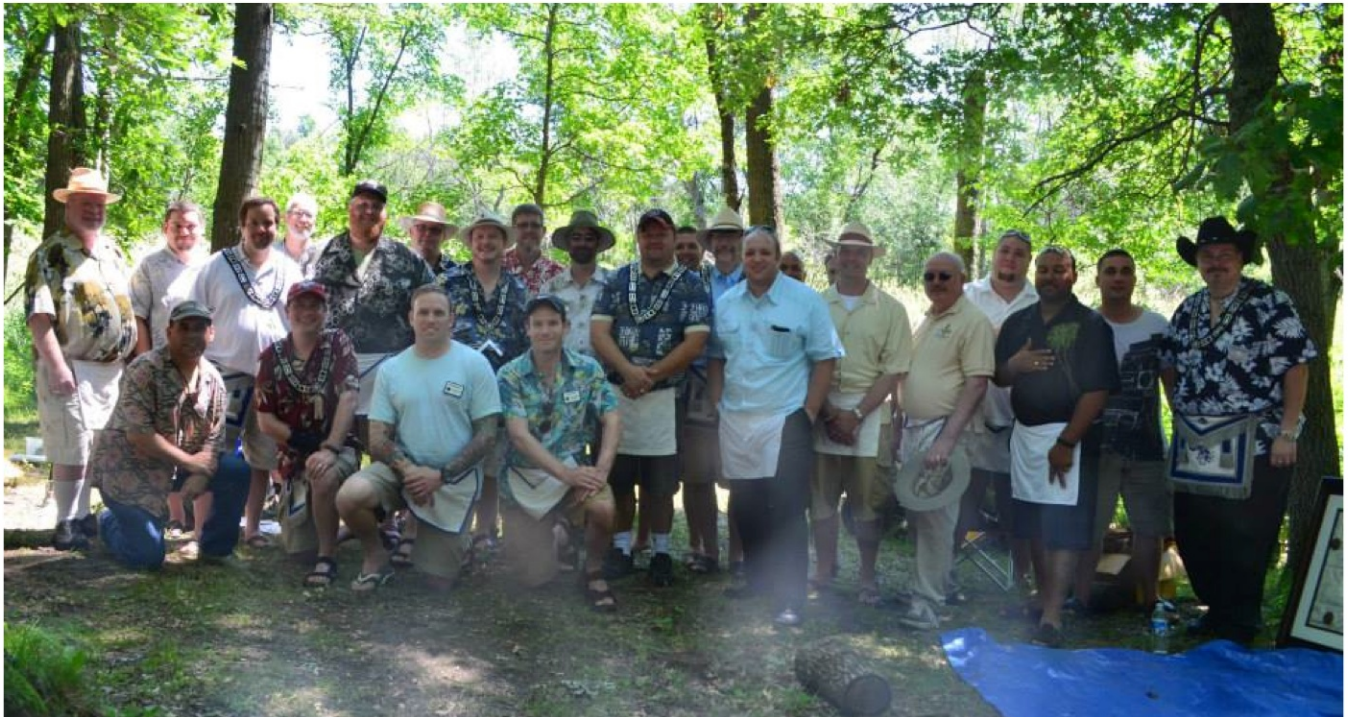
A great outdoor Degree June 21, 2014

NONPROFIT ORG US POSTAGE PAID ANOKA, MN PERMIT NO. 79