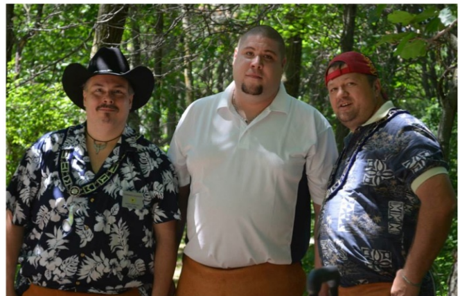
Great job by the ruffians!