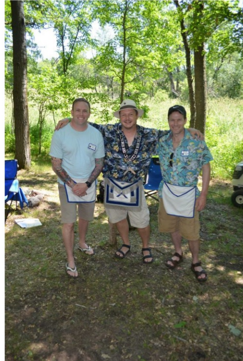
Our newest Master Masons