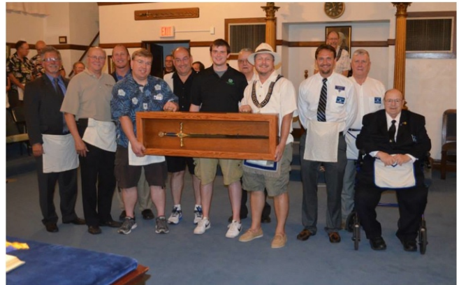
Plymouth Lodge # 160 came out and took the Proficiency Sword!