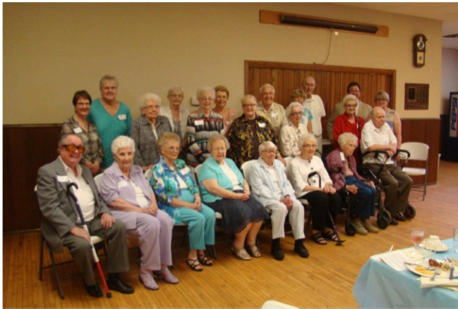
50+ members honored on June 21st