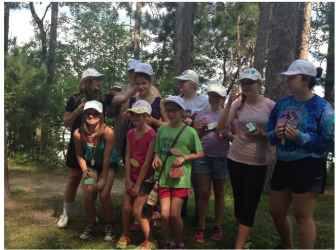
First Day at Camp for Bethel #48!