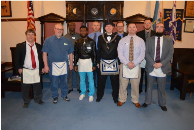
Anoka Lodge's Newest FellowCraft Brothers!