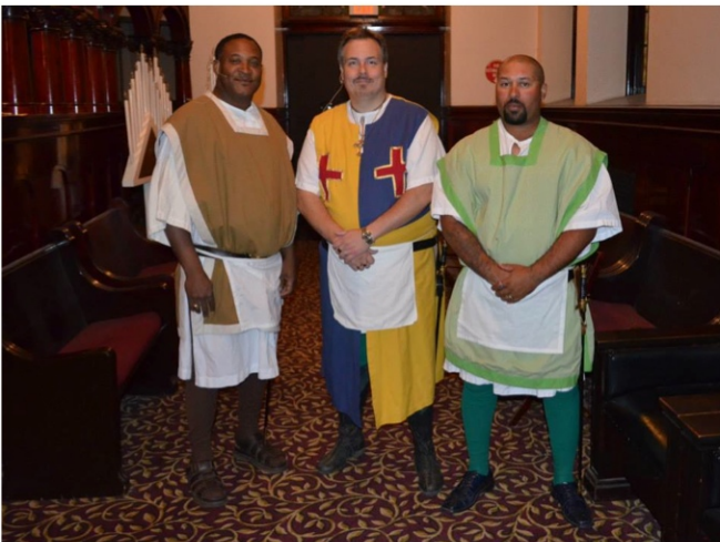
Anoka Lodge Brothers and the Scottish Rite 21st Degree.