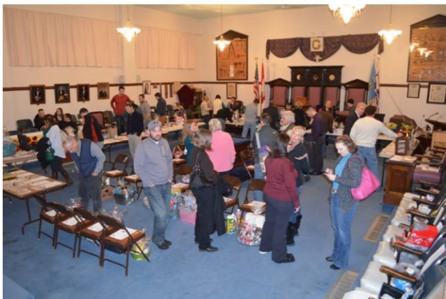
The silent auction was done well and lots of smiling people were seen coming in and out of the Lodge!