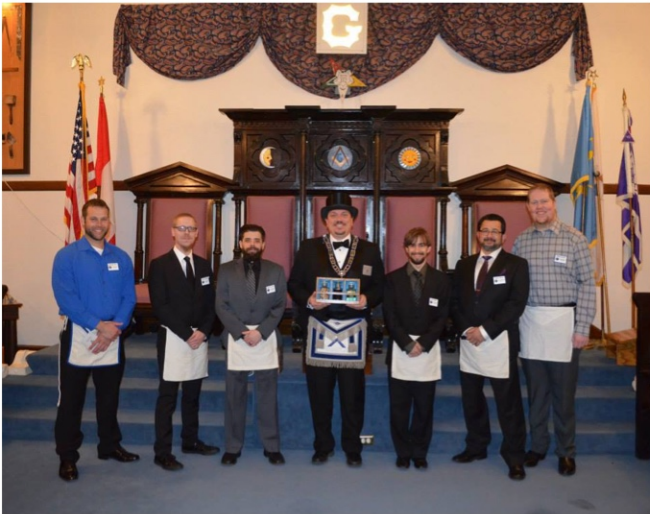
Our newest Fellocrafts! Congrats Brothers!