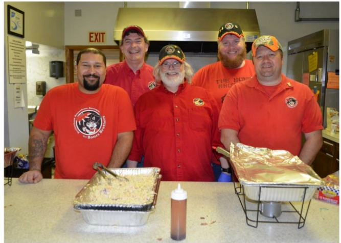
Our very own Bones Brothers did it again and made some amazing food!