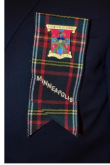
Knights of St. Andrew Badge

As always If you have any questions, concerns or want to fill out an application, Remember that the one day is being held on May 9th and there is still opportunity to get signed up and graduate with our other 3 Anoka members taking the long class, so please feel free to contact myself or any Scottish Rite member to get signed up!