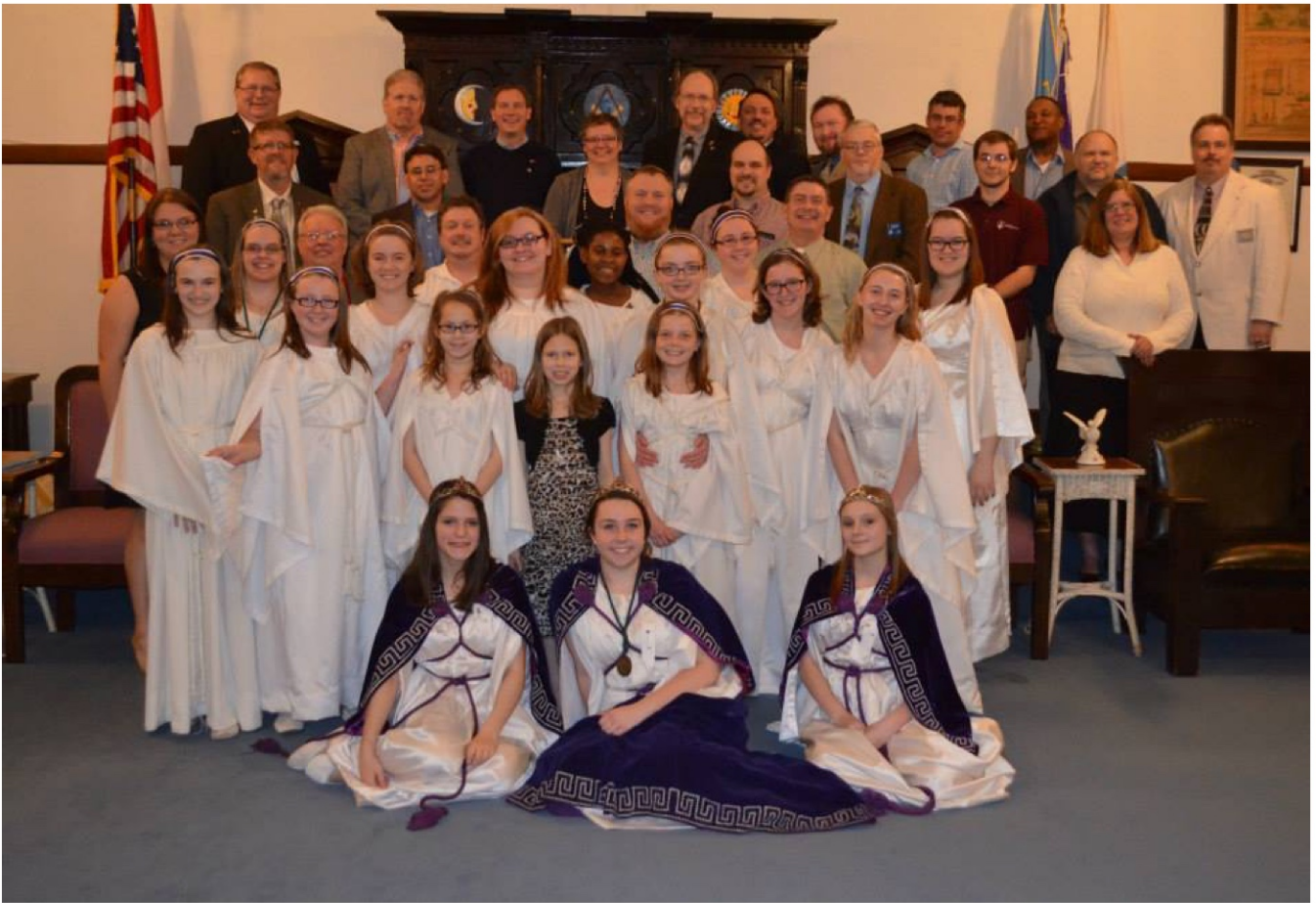
Job's Daughters Masonic Honoring April 20, 2015