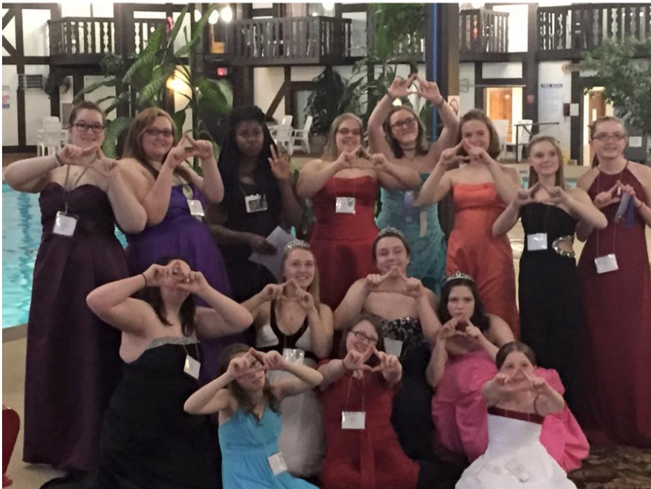
Bethel #48 at Grand Bethel