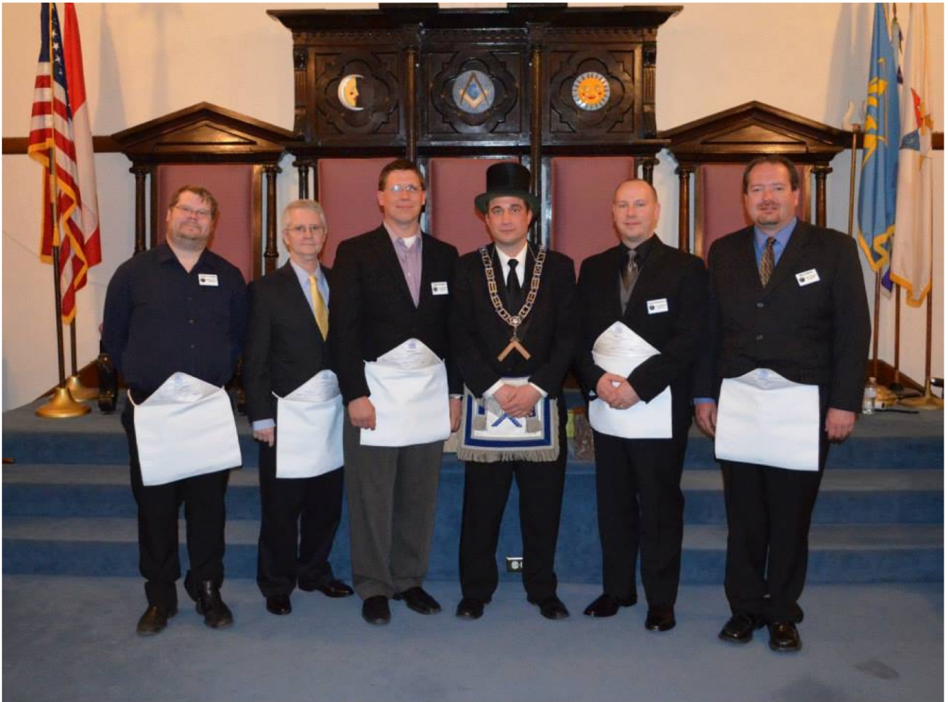
Newest Entered Apprentices April 15, 2015