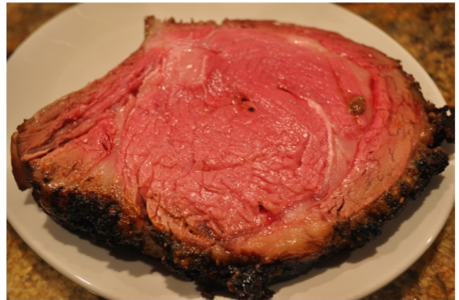
Table Lodge is coming up soon! As you know we have our Table Lodge in September. This is an excellent event with great food. We are going to be serving PRIME RIB as usual so please look and listen for more information to follow soon! Due to the limeted seating of this event, dinner will need to be paid for in advance. More information will follow soon.