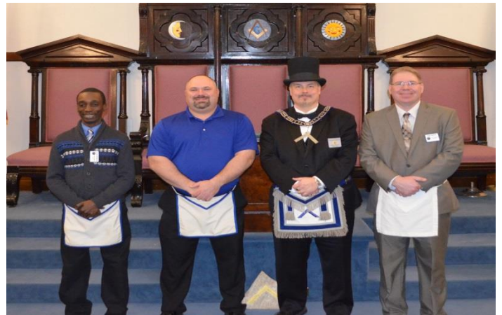
The Newest Fellow Crafts at Anoka Lodge!