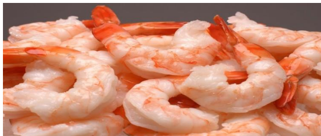
ANOKA LODGE SHRIMP DINNER:

Just a reminder that we will be having the Annual Anoka Shrimp Dinner on March 25 th , Good Friday, and runs from 4:30pm till 7pm. The Cost is still $15 per person or 4 for $50.