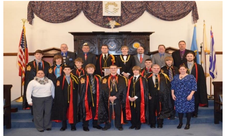
Installation of Officers!

Next month we will be serving dinner at the Feast of Remembrance & Renewal at the Minneapolis Valley of the Scottish Rite.