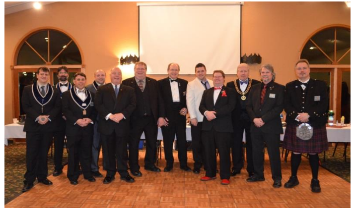
Anoka Lodge Brothers attend the Sherburne Lodge #95, Highland Table Lodge!