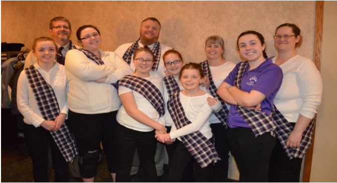
Serving Dinner at the Highland Table Lodge!