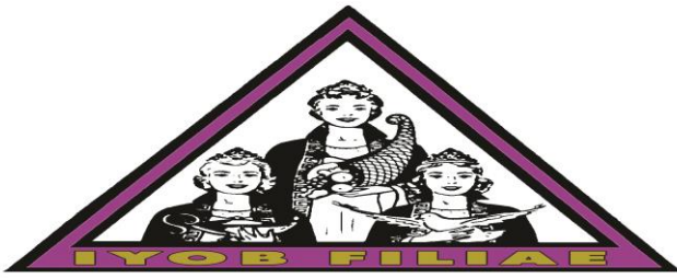
Job's Daughters of Bethel #48: