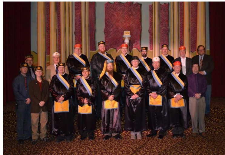
Anoka Lodges Adopted 20 th Degree at the Rite!