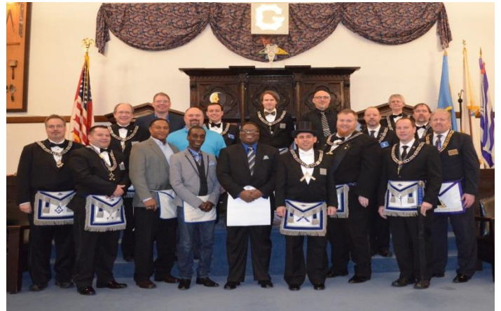
Our Special EA Degree!