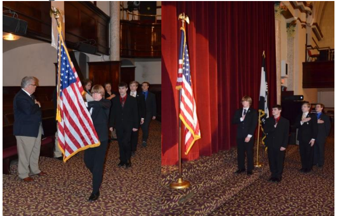
Presenting the Flag at Grand Lodge Seminar!