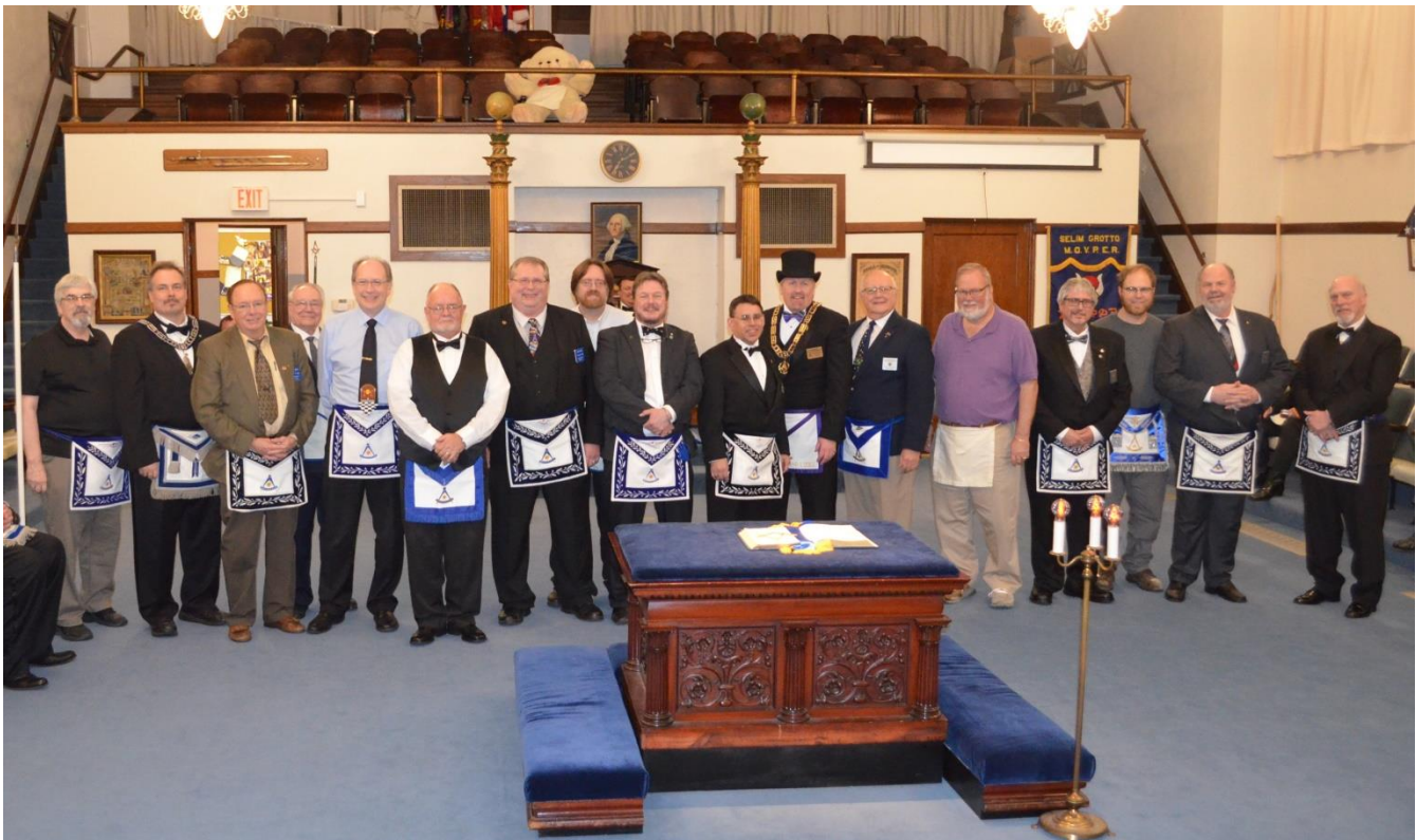
Always great to see all the Past Masters putting on the Past Master's Degree!