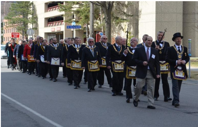
The Grand Master!