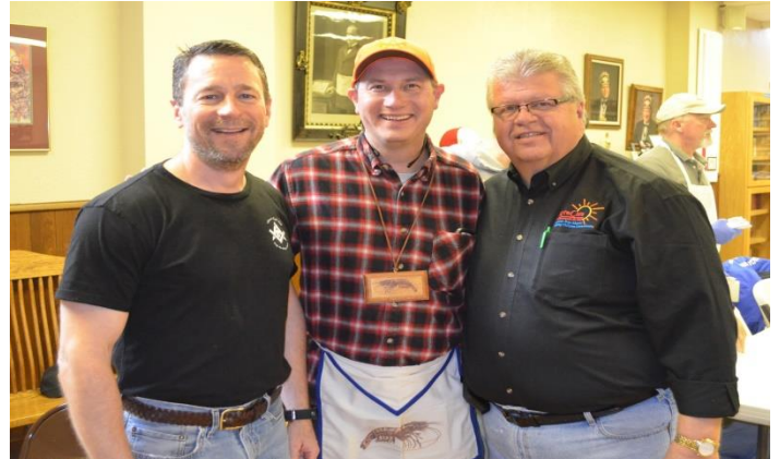
The Grand Master, WM and Committee Head!