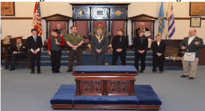
Presenting our Ritual work to Anoka Lodge!