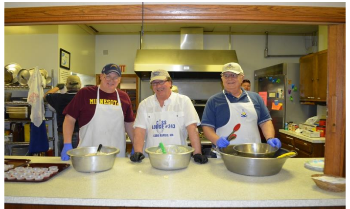
The Committee did a great job as always!