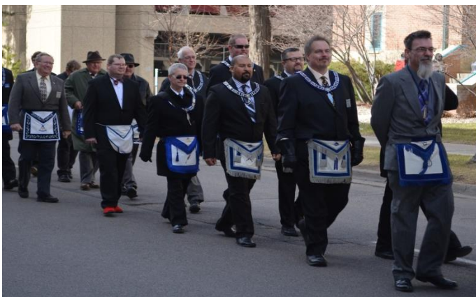
The Anoka Brothers!