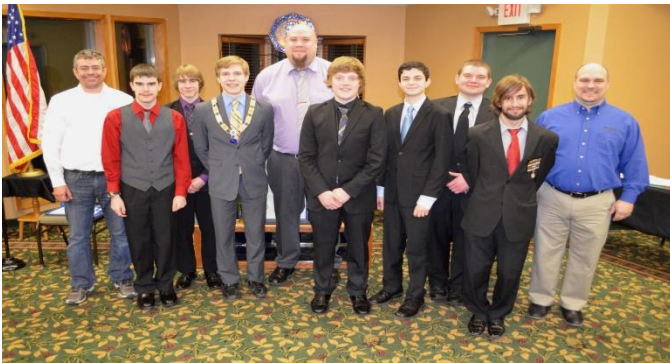
Presenting Ritual work for Sherburne Lodge #95