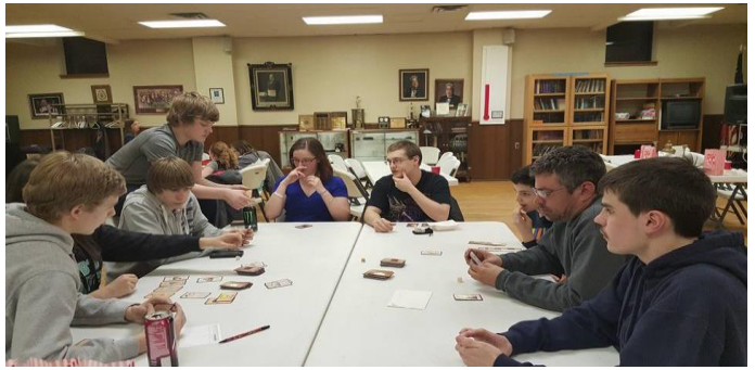
Board Game Night!

So busy this past month, below are just some of the events we did!