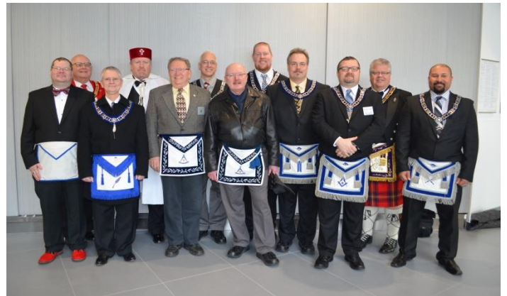
Anoka Brothers at the Corner Stone Ceremony!