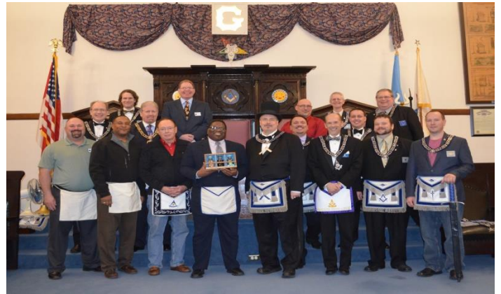
Our Special FC Degree!