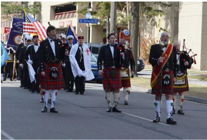
The Procession around the Building!