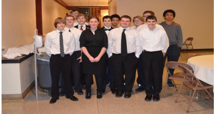
Serving Dinner for the Scottish Rite!