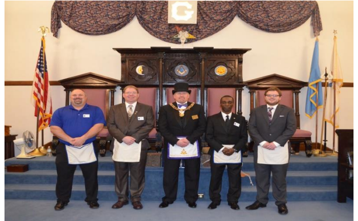
The Newest Master Masons at Anoka Lodge!