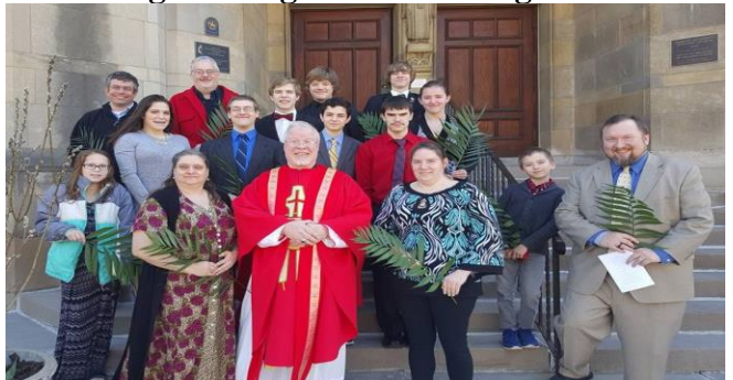
At United Methodist Church on Palm Sunday!