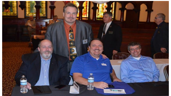
Anoka Lodge at the Leadership Seminar!