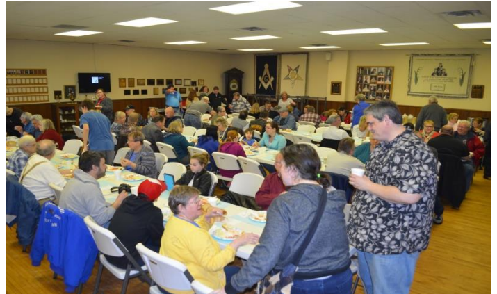
Anoka Lodges 21 st Annual Shrimp Dinner!