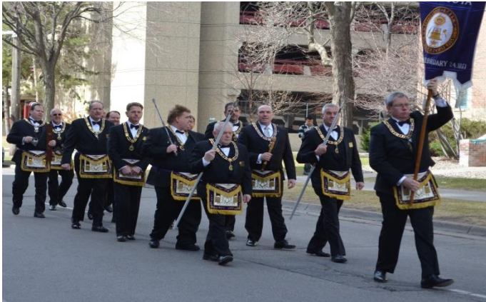
The Grand Lodge Officers!