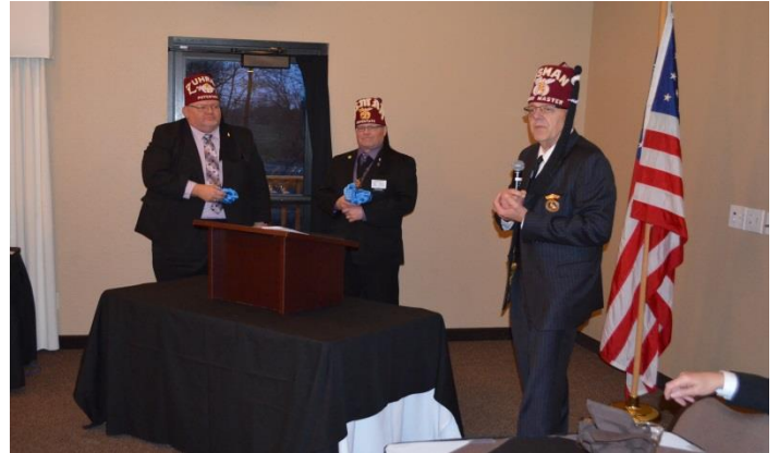
The Grand Master receives his Fez at the dinner