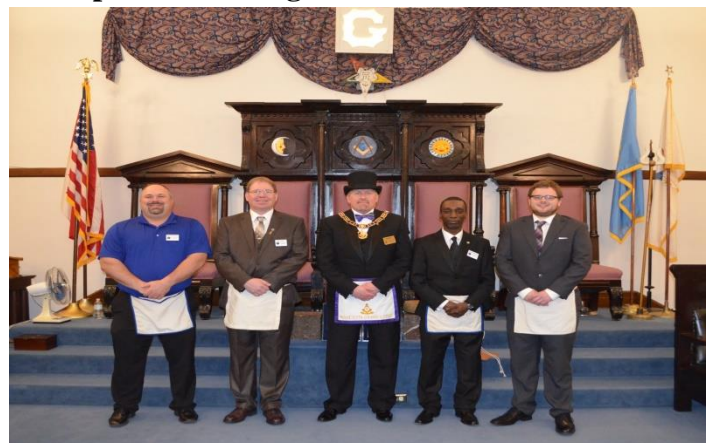
The New Entered Apprentices at Anoka Lodge!