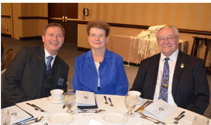
The Grand Banquet!