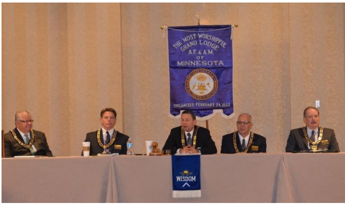
Grand Lodge Communication!