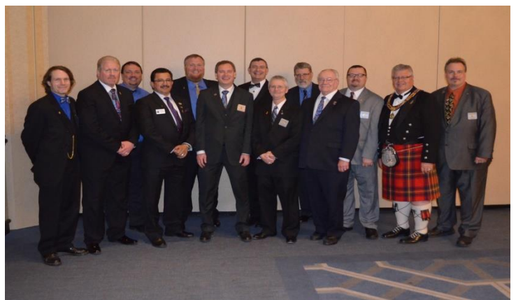
All the Anoka Brothers at the Banquet!