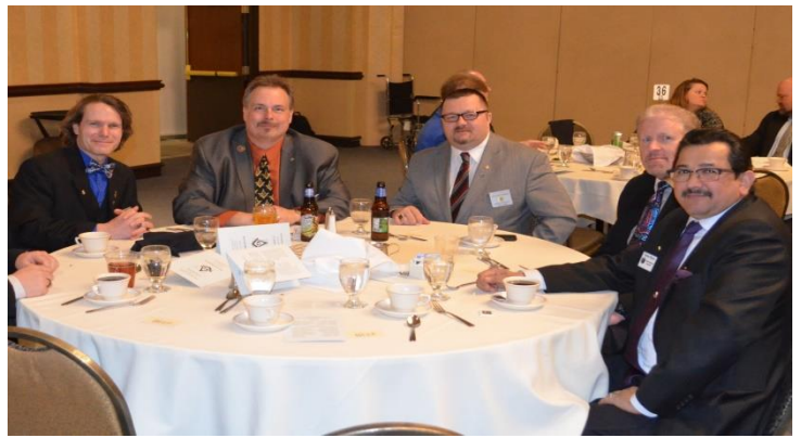
Just some of the Anoka Brothers!