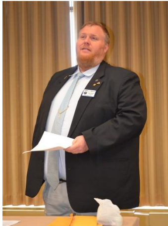
Anoka Lodge received an award for its continuing support of the Kids I.D. Program, while our Metro West President speaks at the Break out sessions!