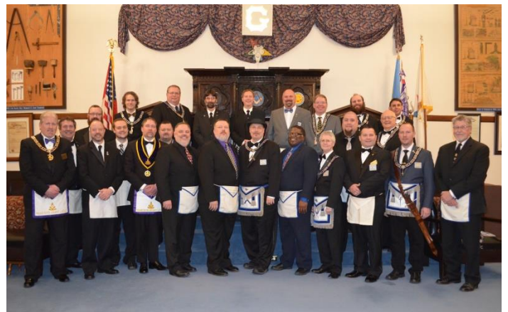
Our Special MM Degree!