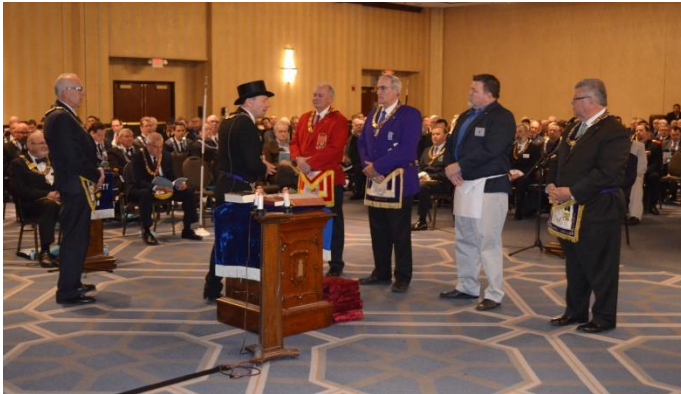
The Appending Body Leaders!