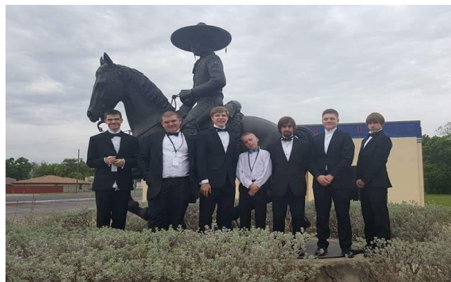
At the Frank Marshall Ritual Competition