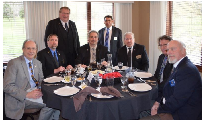
Anoka Lodge at the Lynnhurst Turkey Dinner