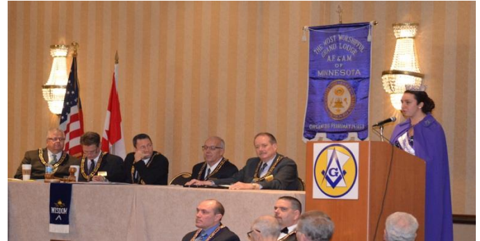
Miss Minnesota Job's Daughter Speaks at the Grand Lodge Communication!