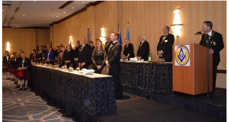
The Head Table!