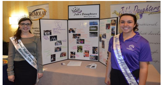
The Jobie booth at Grand Lodge!