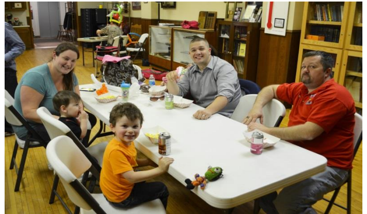
Families come for the May Day Double Feature!