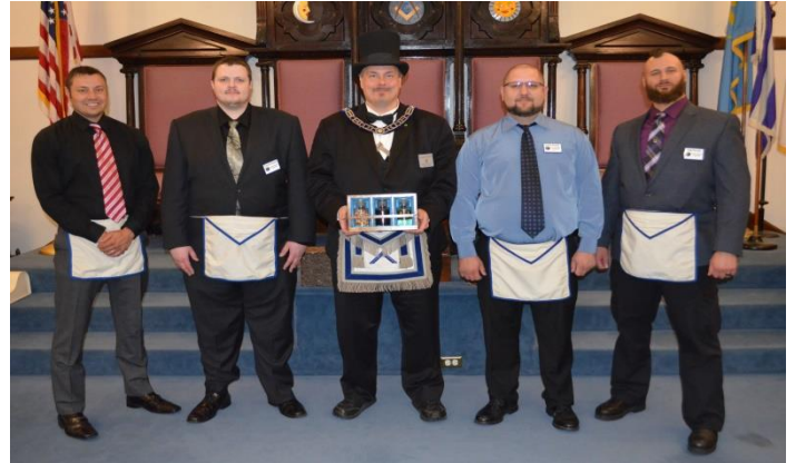
Our New Brothers Become Fellow Crafts!