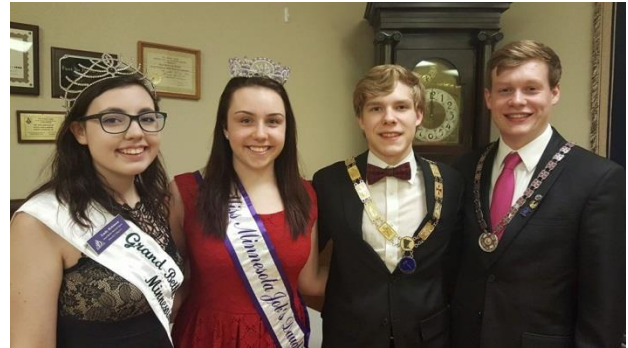
Attending the DeMolay Parents Day Dinner