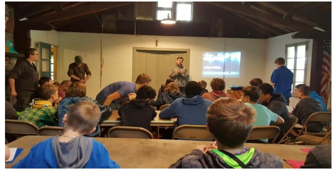
We spent a great weekend at the DeMolay Camp Hosting the Jaques DeMolay University