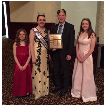
Anoka Wins "Lodge of the Year at the "Scotties"