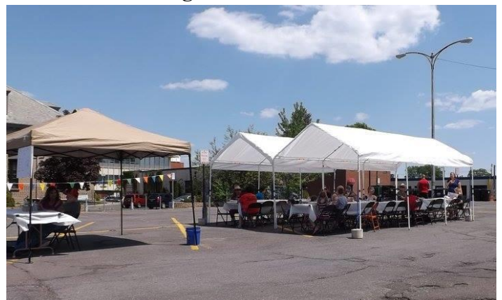
The Get Out, Grill Out!