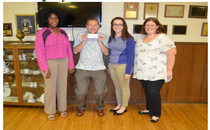
Presenting a check to the lodge for over $600 for the Kitchen Fund!