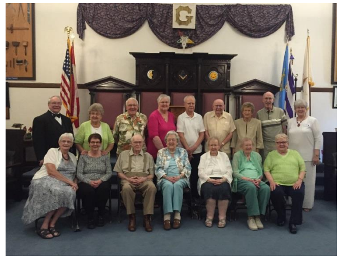
50+ Year Member Luncheon Group!