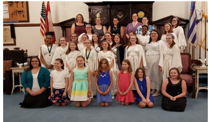
Jobie Majority Installation!