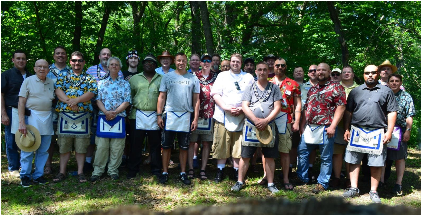
Our Newest Master Masons and Brethren at the Annual Outdoor Degree!