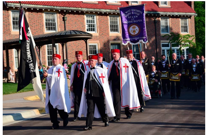
Many Anoka Members at the Grand Opening of the New Heritage Center!