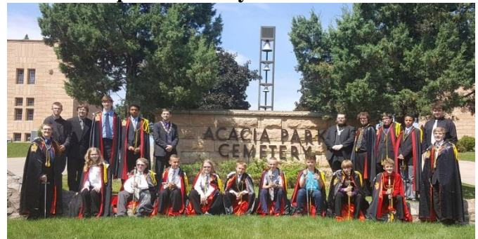
Attending Acacia Park Memorial Day Service