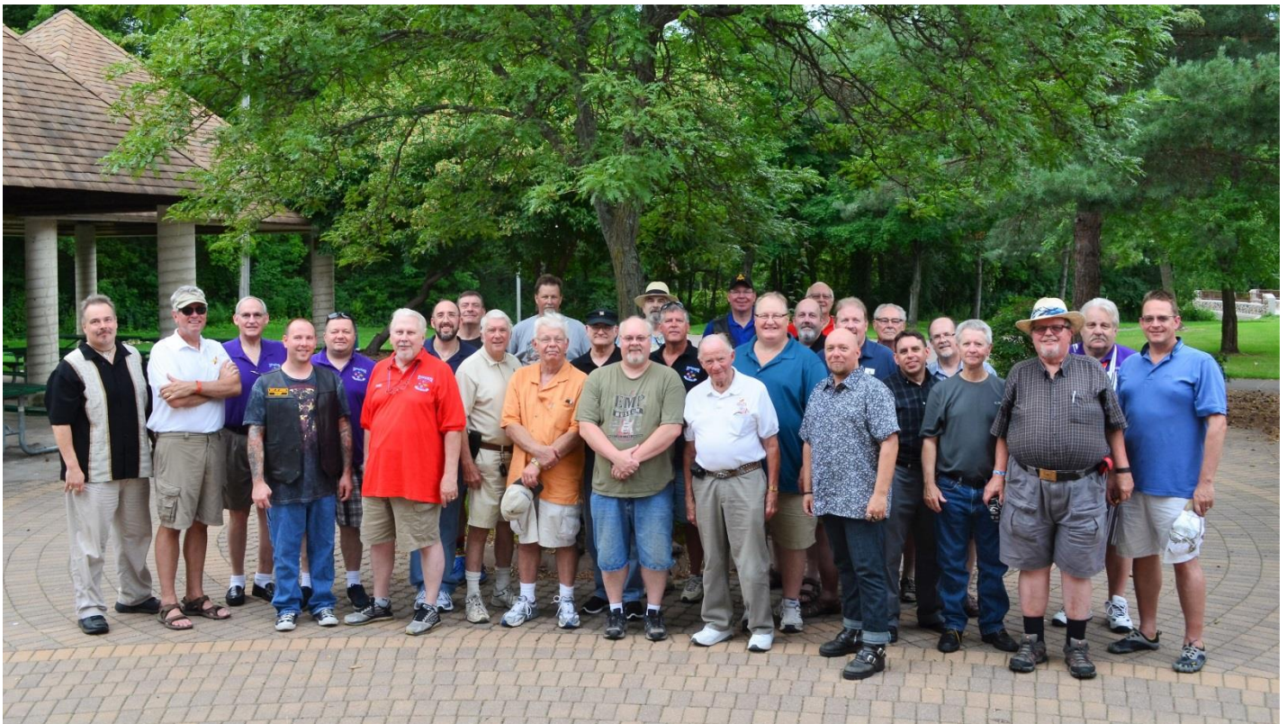
The Brethren at the Annual York Rite Picnic, a great event that all are invited too!