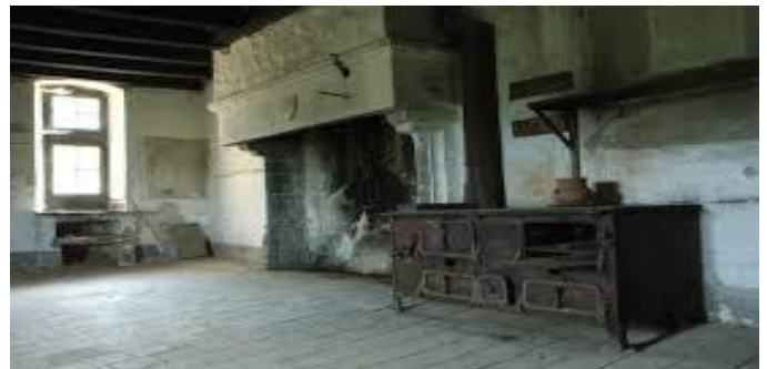
NOW WERE COOKING KITCHEN PROJECT!

Goal: $37,000.00 Total So Far: $43,955.22