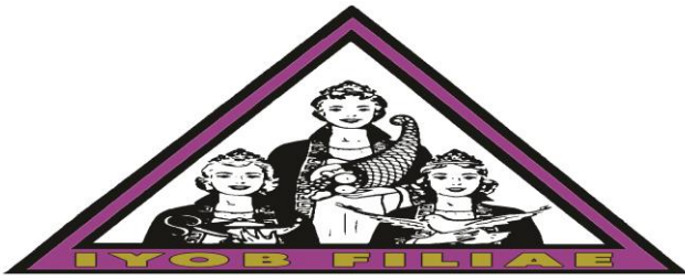
Job's Daughters of Bethel #48: