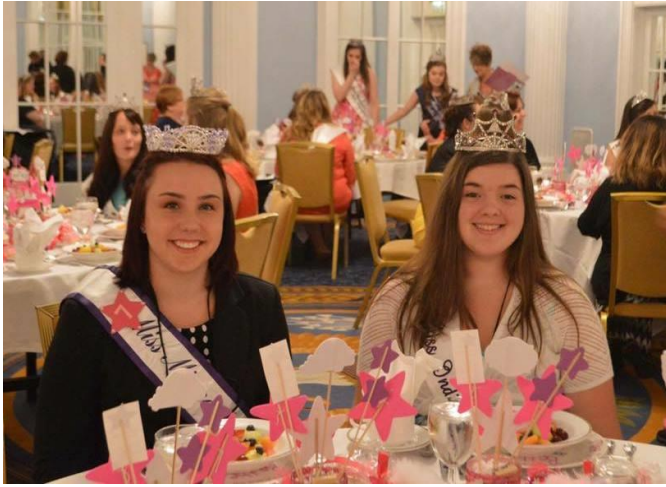
Enjoying the time at the Supreme Session in Grand Rapids Michigan.