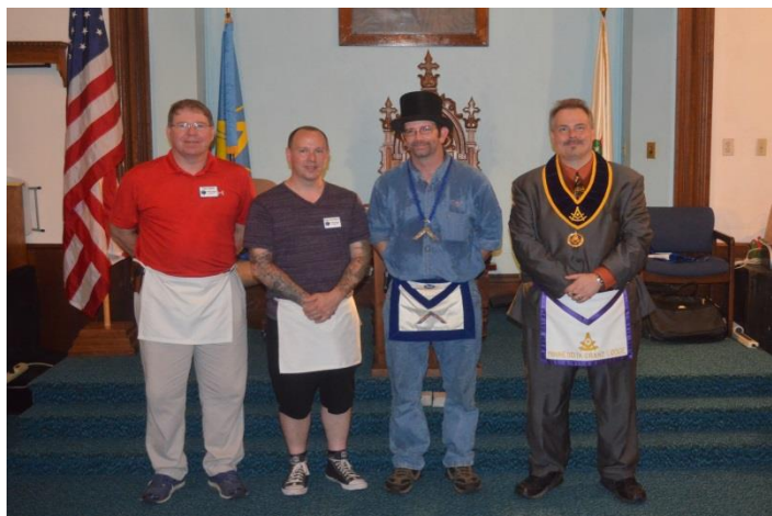
Visiting Accacia Lodge #51!