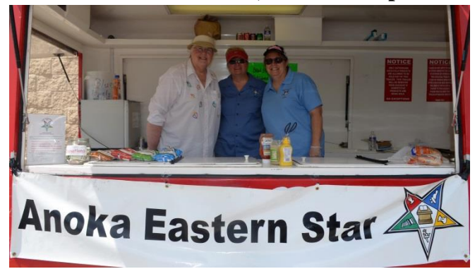
Selling Brats out at Cub Foods for Rite Care!