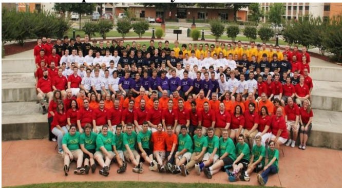
Attending The DeMolay Leadership Conference