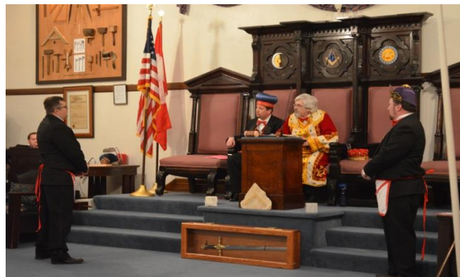
Performing the Past Masters Allagory at Anoka Lodge #30!

We are hopeful to start performing the Past Masters Allagory again for other lodges, in order to give them just a peek into what the York Rite, beginning with the Royal Arch, has to offer Brothers!