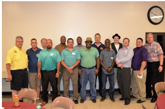
Anoka Lodge members attend the Scottish Rite Open House at the Minneapolis Valley!