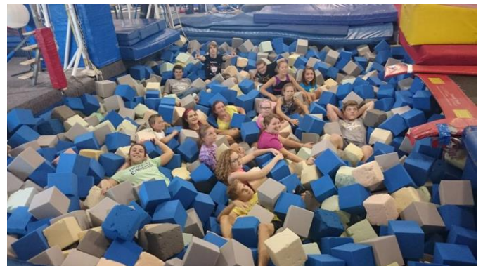
Having a blast at the joint Jobie and DeMolay event at Jams Hops!