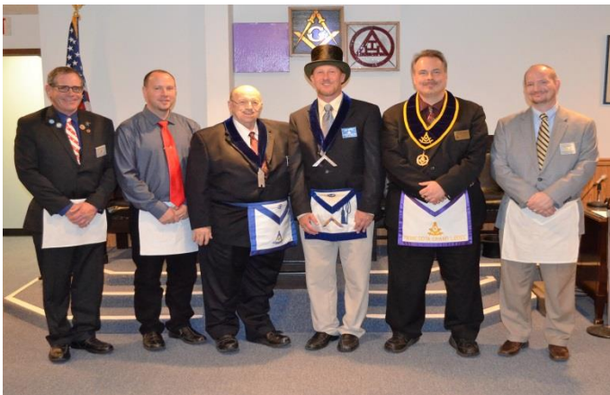
Visiting Plymouth Lodge #160!