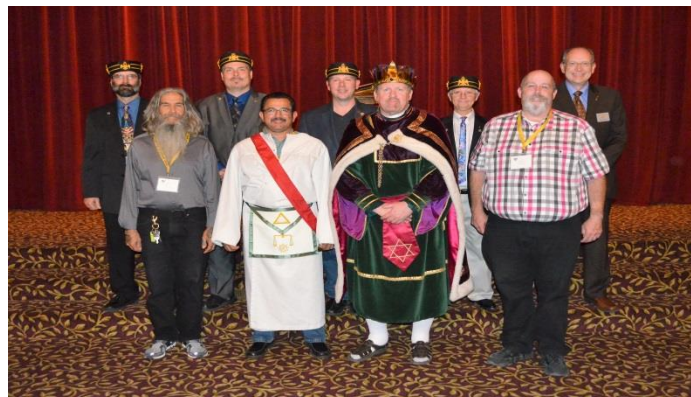
Anoka Lodge members with our Candidates down at the Scottish Rite!