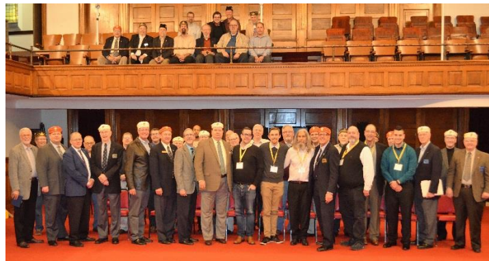
The Grand Master of Minnesota visits the Scottish Rite!