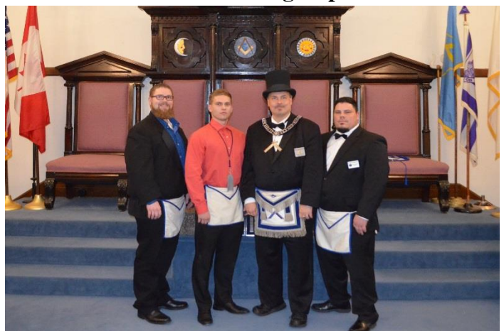
Our Newest Master Masons at Anoka Lodge!