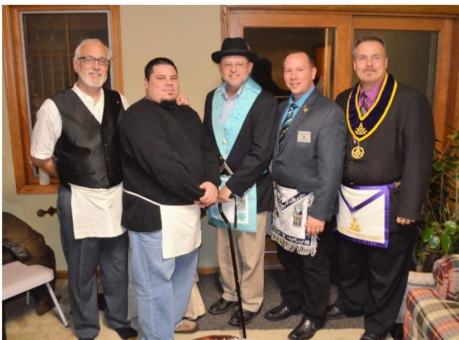
Visiting Sir Winston Churchill Lodge #351!