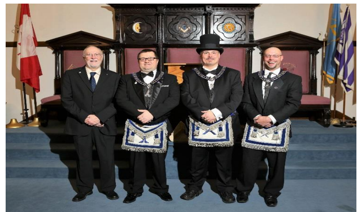
My Brothers and Classmates join me at my Installation as Master of Anoka Lodge #30