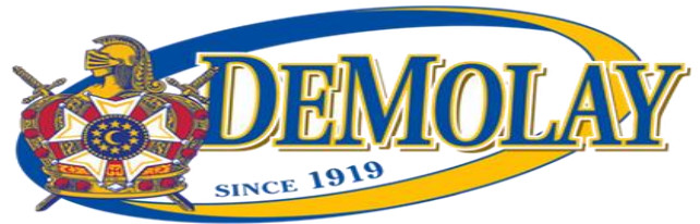
Anoka Chapter DeMolay: