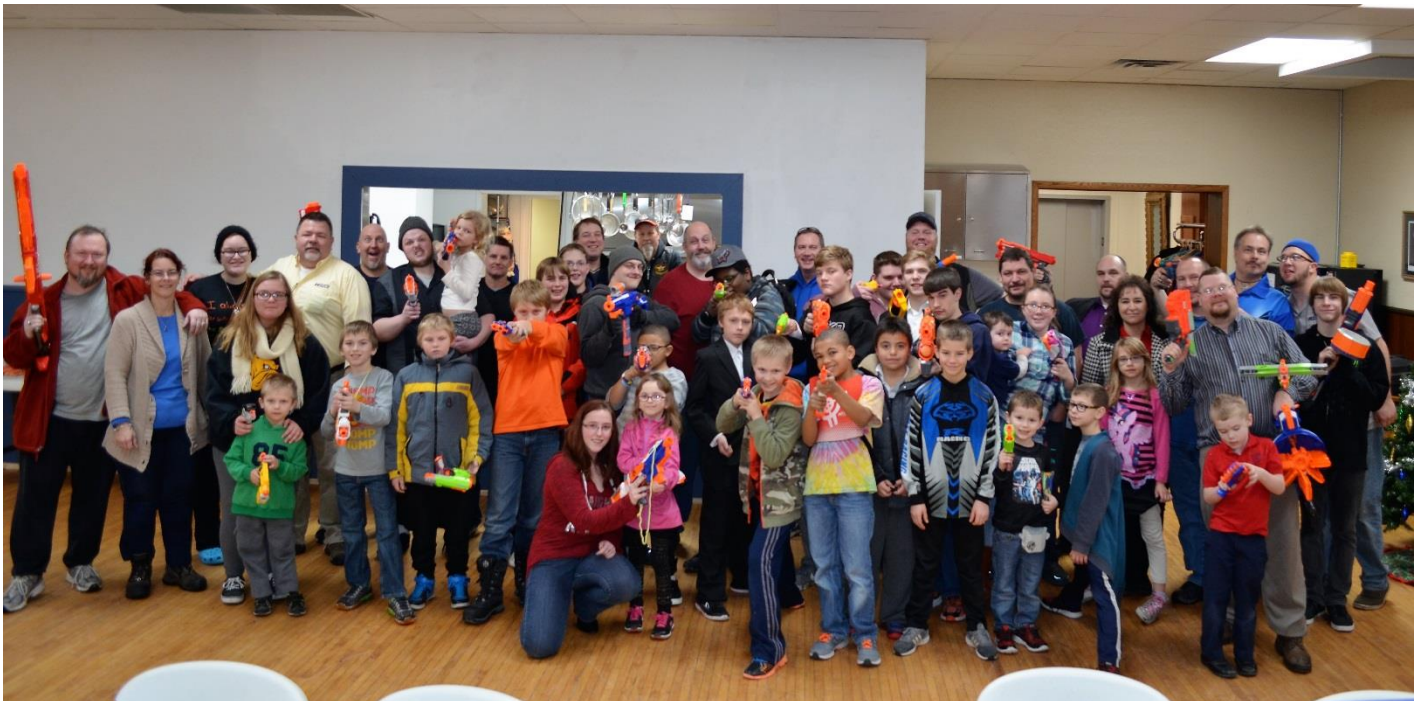
Zombie Apocalypse Survivor Party 2016!