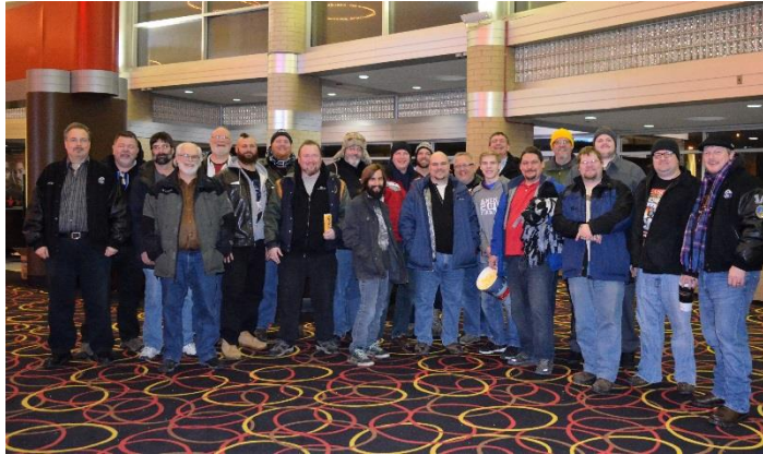
Anoka Brothers head to "Rogue One!"