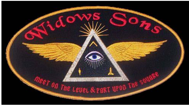
Widows Sons, Cryptic Master: