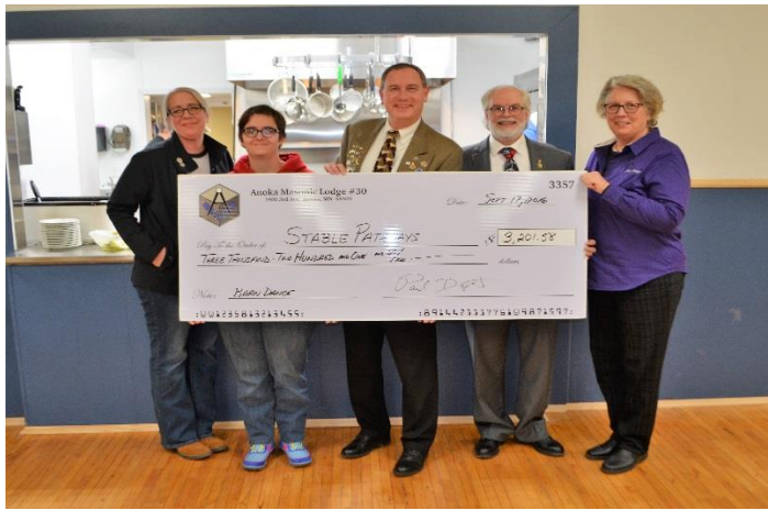
Presenting a check to Stable Pathways!