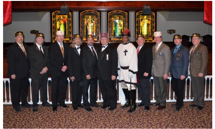
Our Newest Masters of the Royal Secret!