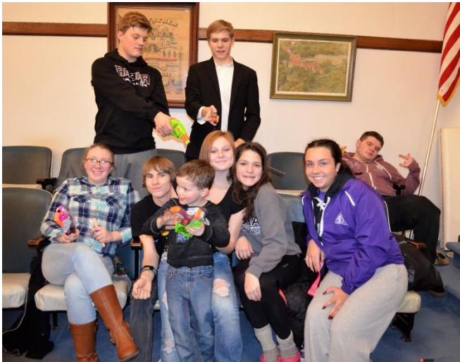
Attending the Zombie Apocalypse Party!

We also helped with the Anoka Lodge Officers Installation by performing the living cross once again.