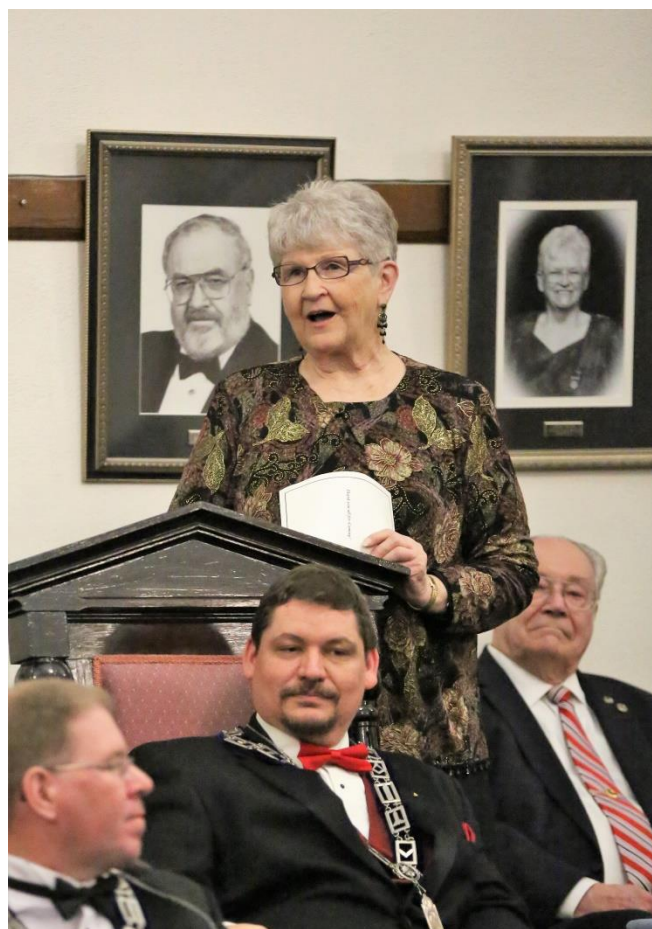
Attending the Installation of Anoka's Officers