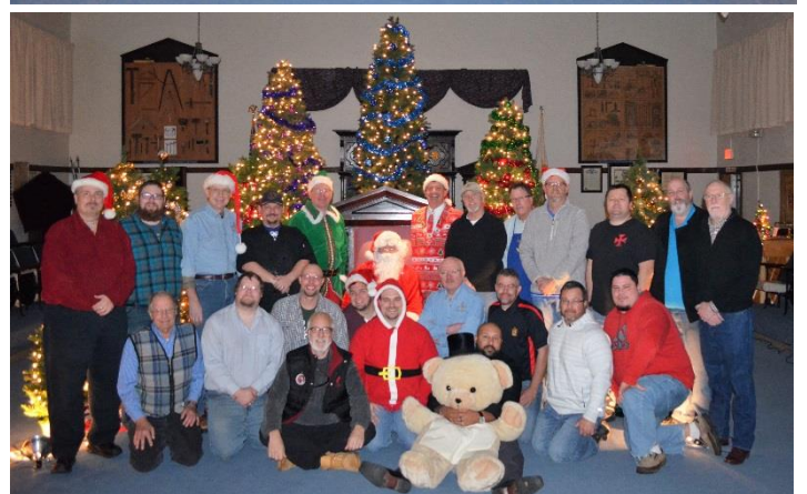
Another Great Breakfast with Santa Event!