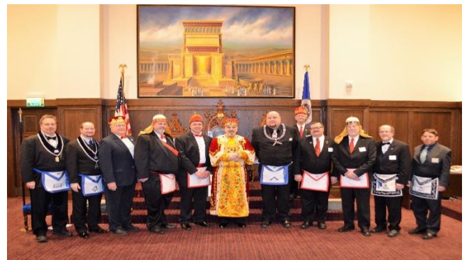
Visiting Sherburne Lodge #95, the members of Shekinah #104 put on the Past Masters Allegory.

If you have any interest or just want more information please contact any York Rite member!