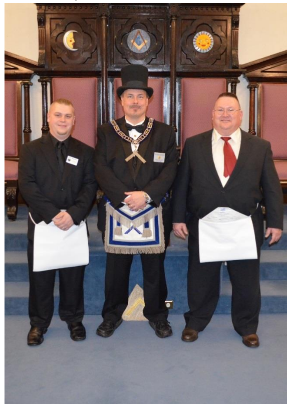
Anoka's Newest Entered Apprentice's!