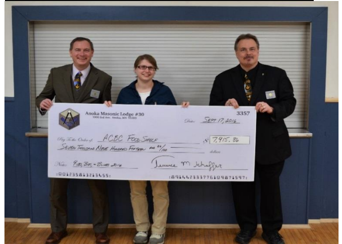
Presenting a check to ACBC Food Shelves!