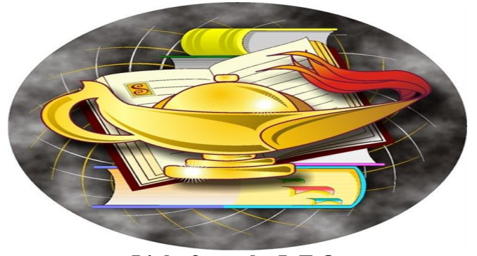
Light from the L.E.O.