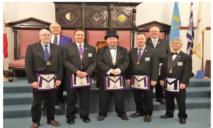
The Officer for 2017 of Zebud Council #10.