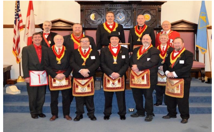
The Officers for 2017 of Skehinah #104.

Both of Anoka Lodges York Rite bodies held thirs Installation for 2017 this past month.