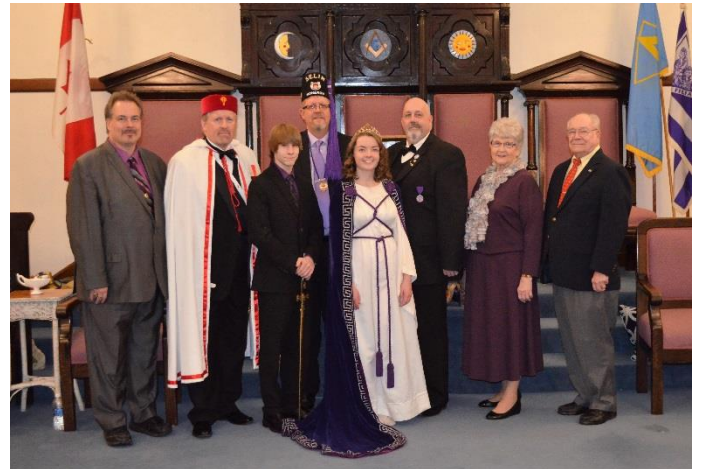
With the heads of bodies at the Bethel #48 Installation, Stronger Together!

We will be holding our own Installation on Saturday, February 18 th and hope to see some of you there.