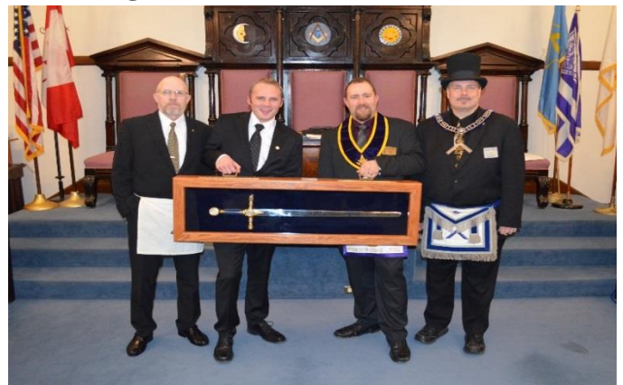
Brothers from Faribault Lodge #9 take back the Proficiency Sword!