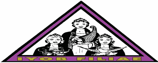
Job's Daughters of Bethel #48:

Thanks to everyone who came to our Installation, it was great to have so much support from our Masonic Family!