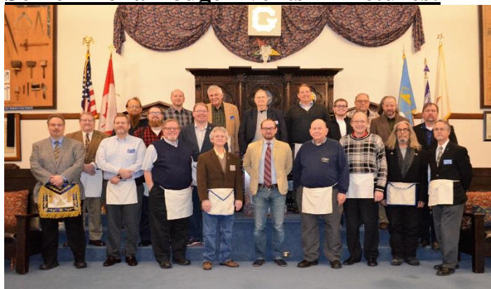
Hosting Education Lodge #1002