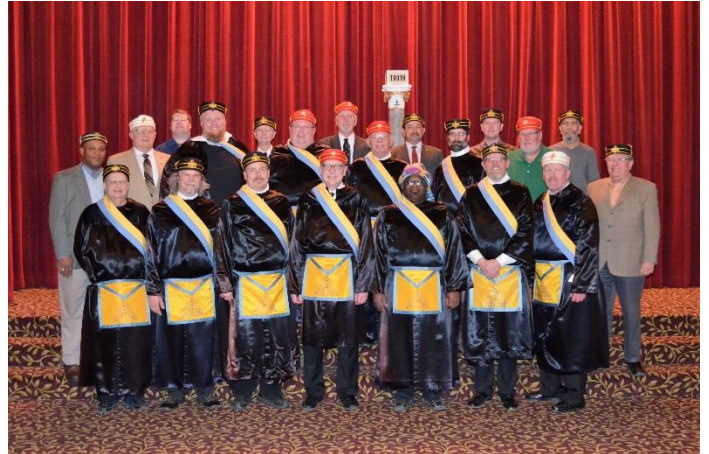
The 20 th Degree, Anoka Lodge's Adopted Degree! A Great Turn Out!