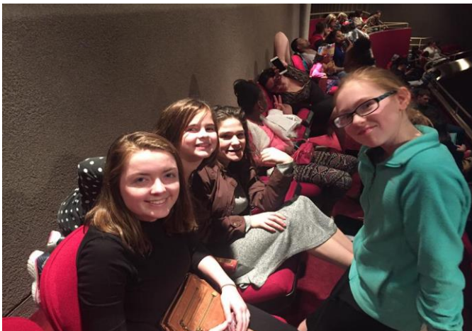
Attending the performance of "The Sneetches" Musical at the Children's Theater!