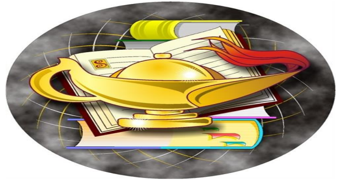
Light from the L.E.O.

Widows Sons Cryptic Master President Chop 763-746-6720