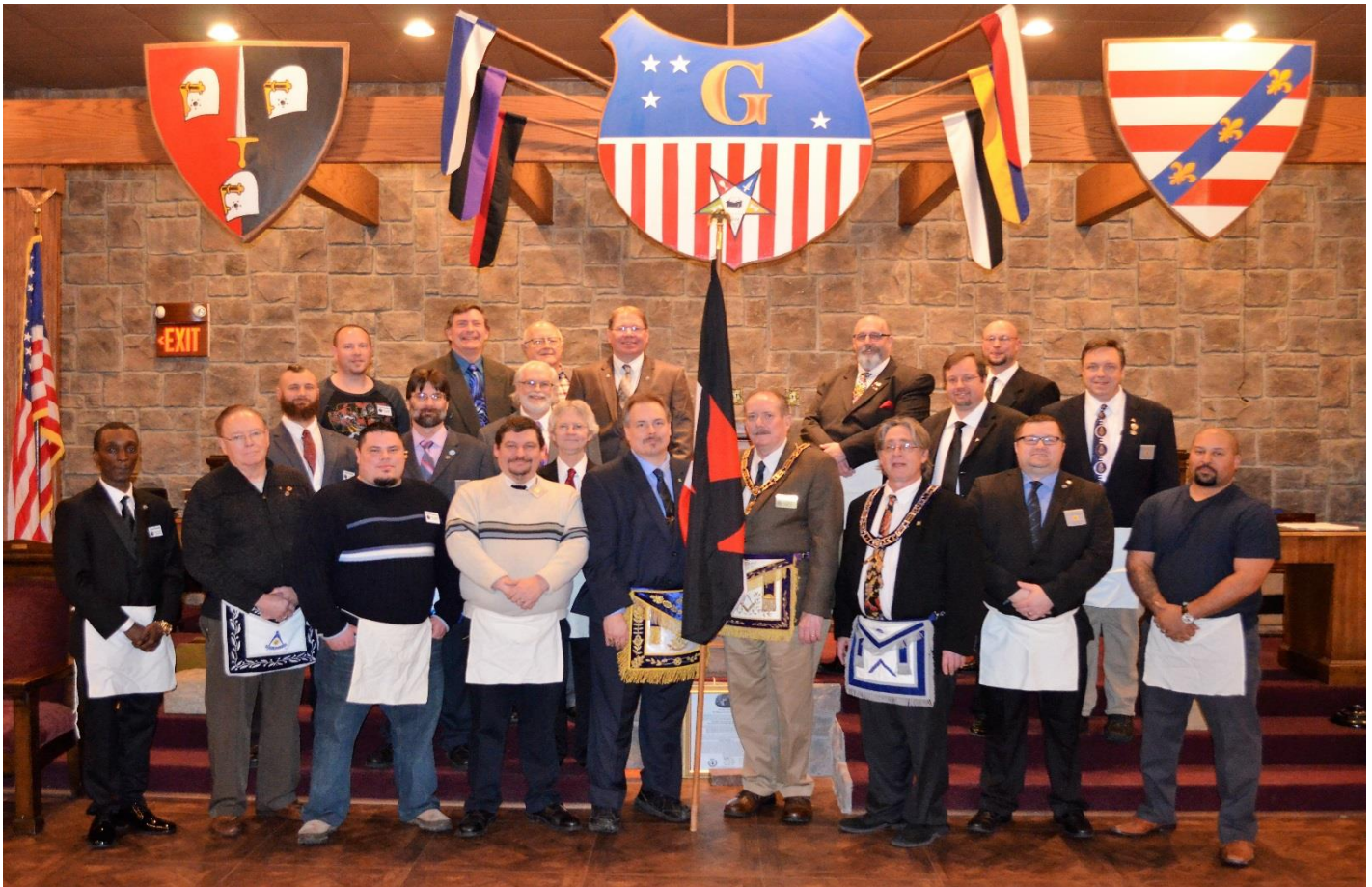
The Brethren of Anoka Lodge take over Templar Lodge #176 and steal their flag!