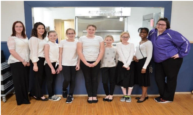
Making dinner for the Anoka Lodge Members!