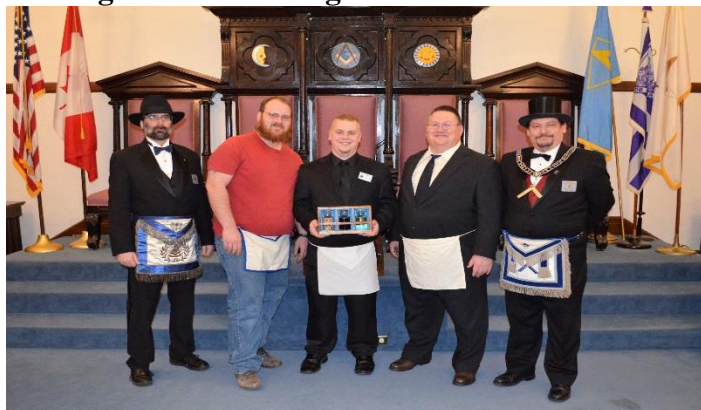
Anoka's Newest Fellow Craft's!