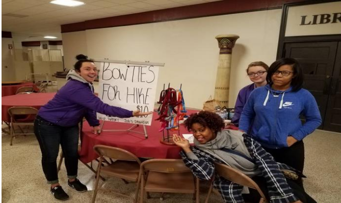
Selling Baked Goods and Bow Ties at the Various York Rite Degree days!

Being as active as even, the Daughters of Bethel #48 are all about town, here are just some of our activities!