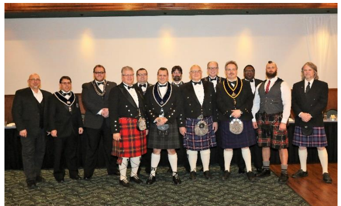
Anoka Brothers at the Highland Table Lodge!