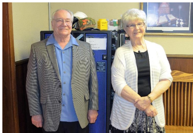
Our Worthy Patron and Matron of 2016-2017!