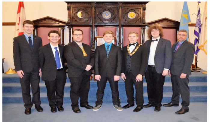
The Installing Officers!