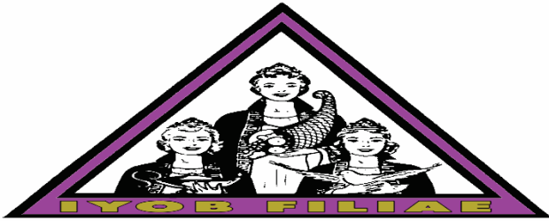
Job's Daughters of Bethel #48: The Daughters of Bethel #48 are all about town, here are just some of our activities!