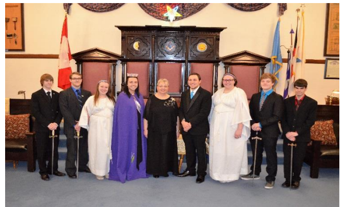
Performing the Arch of Steel along with the Jobie's of Bethel #48 doing the "Triangle" for the Martha Chapter #132 Installation of Officers.