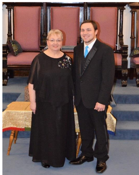
Our Worthy Patron and Matron of 2017-2018!