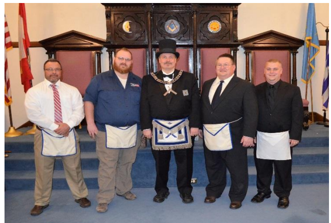
Anoka Lodges Newest Master Masons!