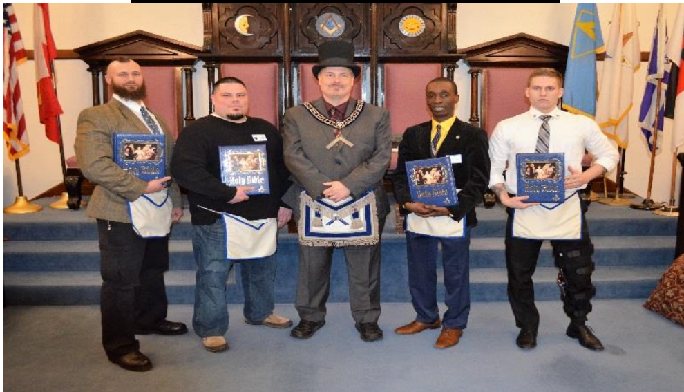
Anoka Brothers Prove Up in the 3 rd Degree!