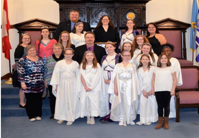
Hosting the WM of Anoka Lodge and the Worthy Matron Elect of Martha Chapter!