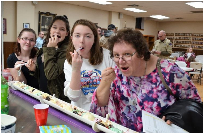
Enjoying Sewer Pipe Sundeas after the meeting