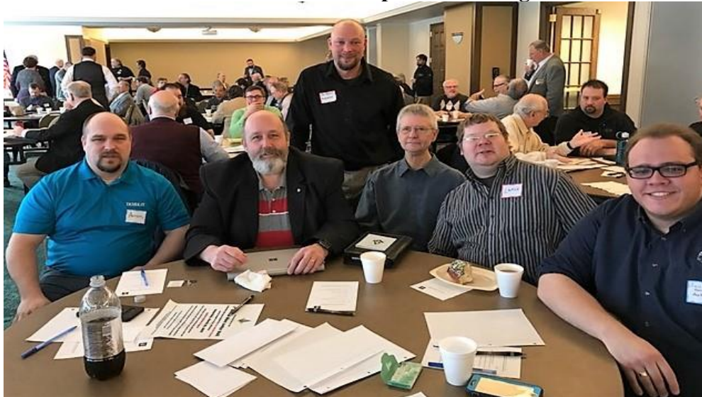
Anoka Brothers attend the Membership Seminar