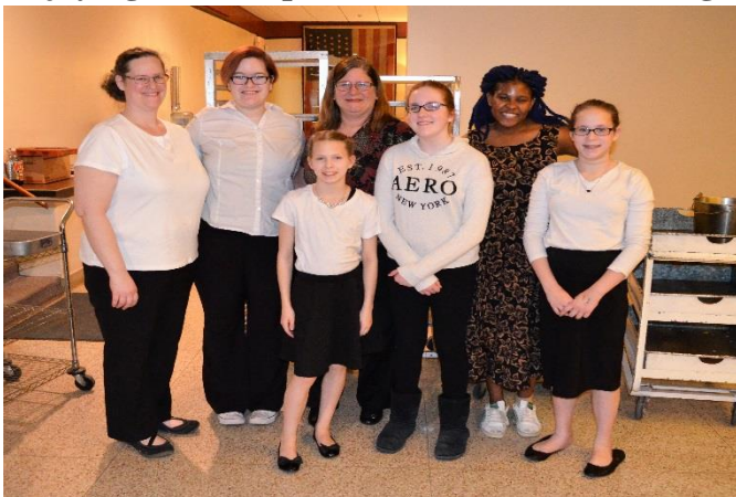
Helping serve dinner at the Scottish Rite!