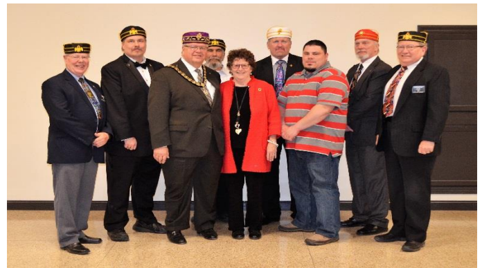
Anoka Lodge members at the Ceremony of Remembrance and Renewal!