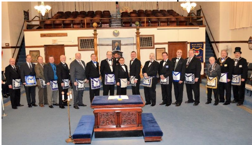
The Cast of the Past Masters Degree