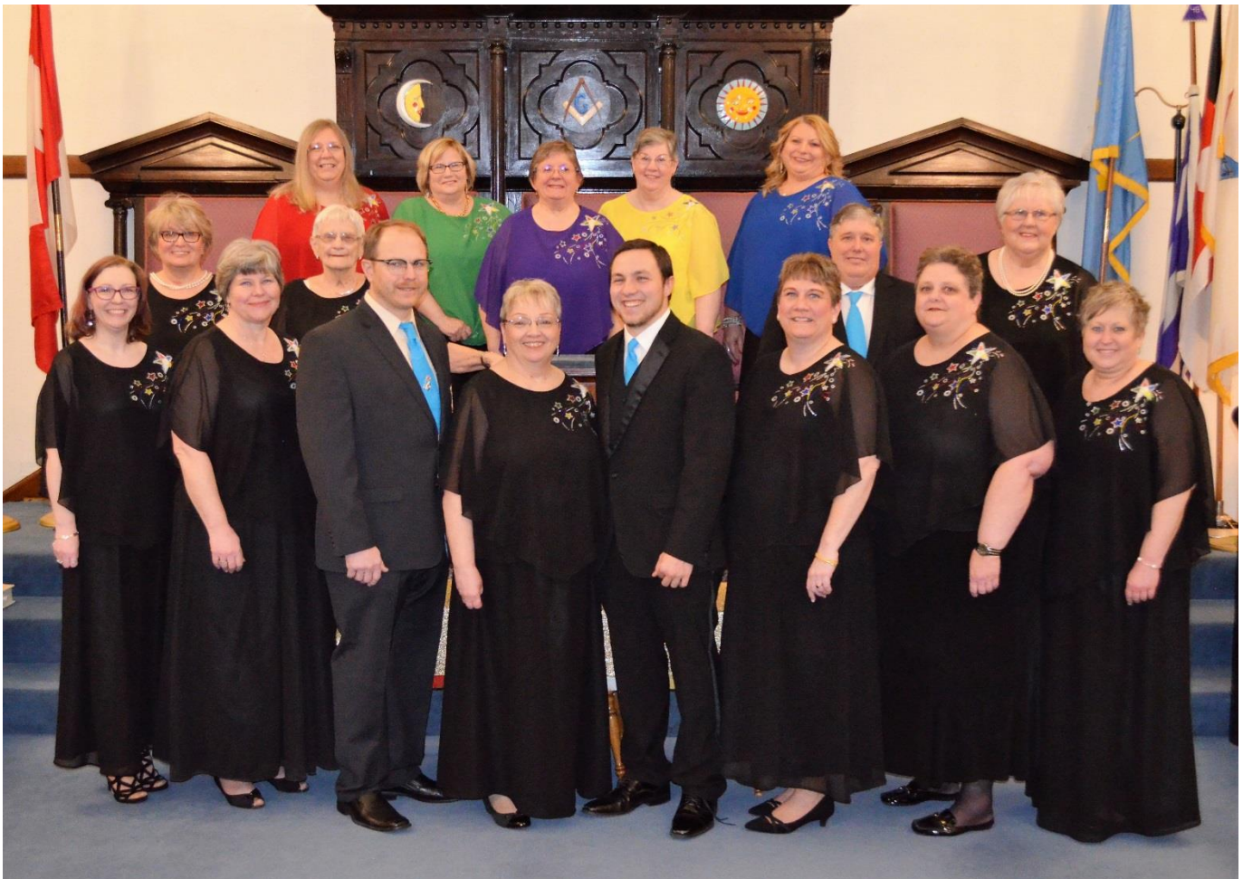
The New officers for Martha Chapter #132 for 2017-2018!