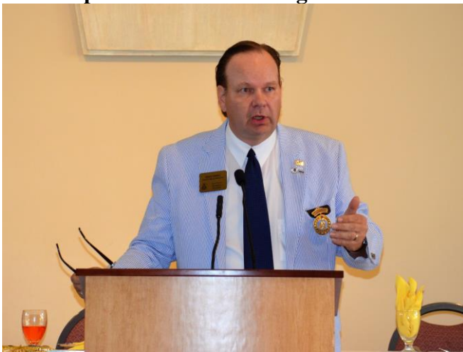
The Grand Master of Minnesota Masons speaks about his experiences!