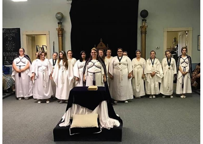
It was a sad and yet great day to assist at Bethel #19's last official meeting in Monticello.