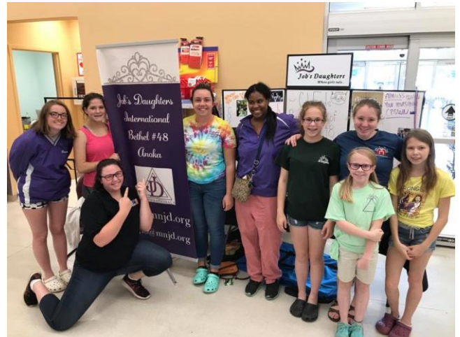
Bagging Groceries at Cub Foods for tips!