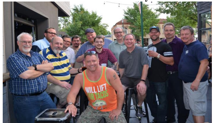
Gaming Fun Day at the Up/Down Arcade!