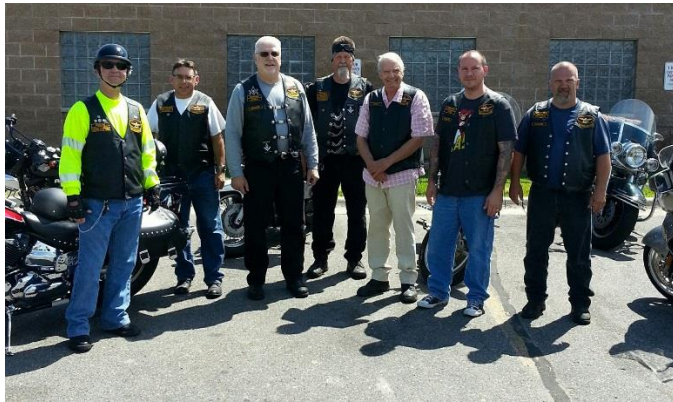
Taking a break on the "Long Run", 270 miles!