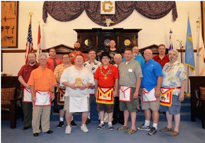
The Newest Members of Anoka Shekinah #104!