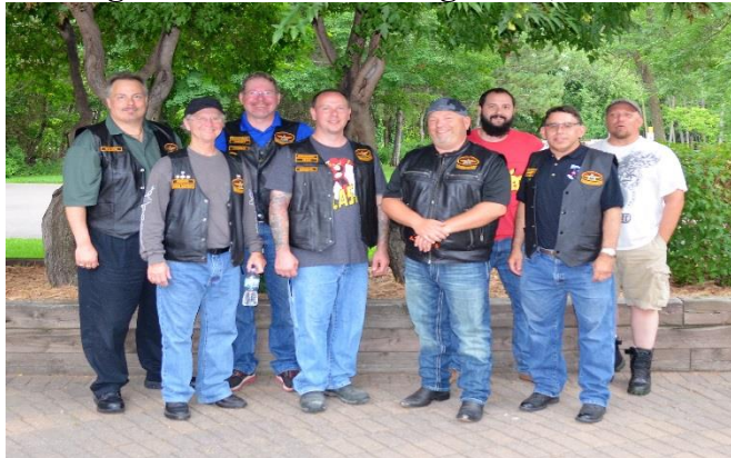
Riding out to the York Rite Picnic