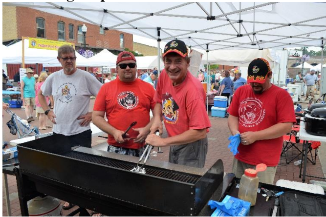
The Brothers working the Anoka Riverfest!