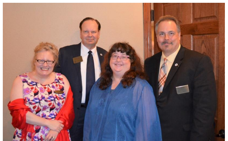
The Grand Lodge/Grand Chapter Luncheon!