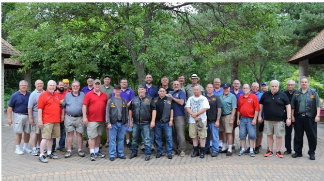
The Combined York Rite bodies at the Richard F. Hunt, York Rite Picnic!