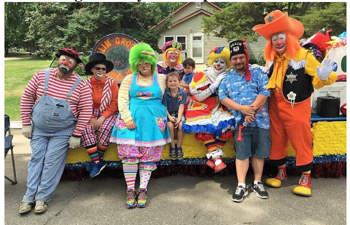
Glenwood Waterama Parade!