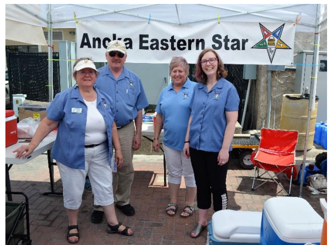
Working the Anoka Riverfest!