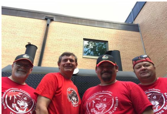
Assisting Wayzeta Lodge #205 as they cook for the local Fire Department!

For more info see lodge calendar or Facebook