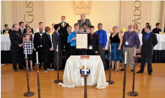
Anoka DeMolay receives their Charter!