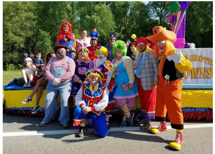
Grotto Clowns at the Delano July 4 th Parade!