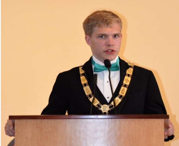
AJ's Last Act as State Master Councilor