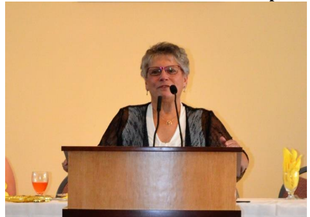
Grand Worthy Matron Inspires by reminding us what we can do with a "Smile"