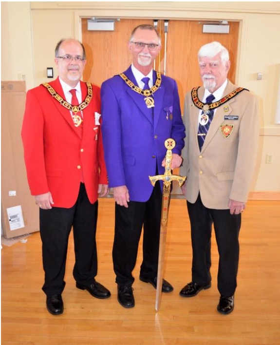
The Heads of all three York Rite bodies present a new Travling Sword!