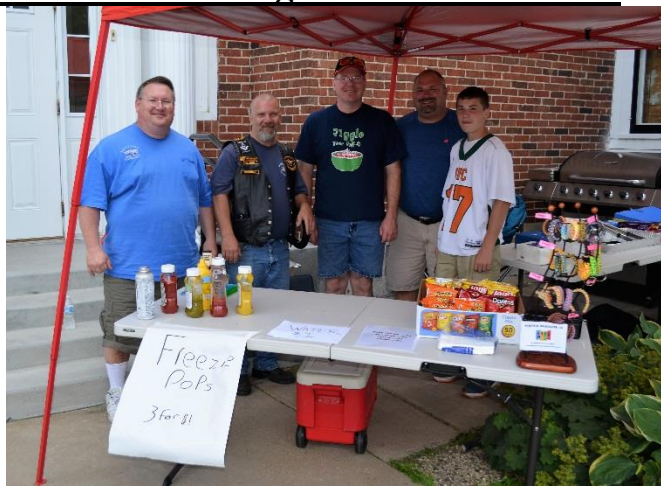
Cooking it up at the Flea Market Next Door!