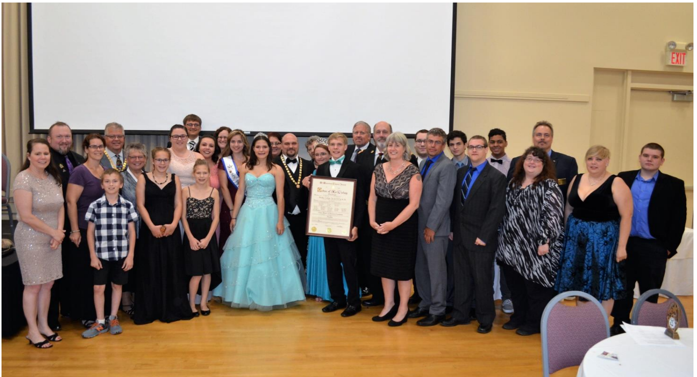
The Anoka Masonic Family at the DeMolay Conclave 2017!