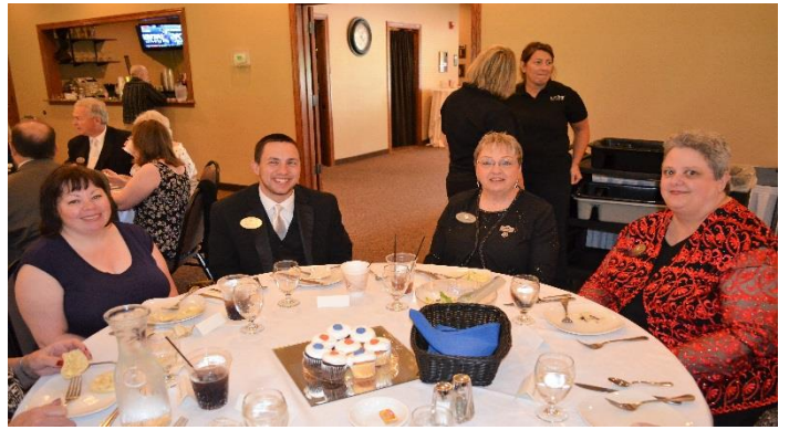
Anoka Masonic Family attending the Grand Lodge/Grand Chapter Luncheon