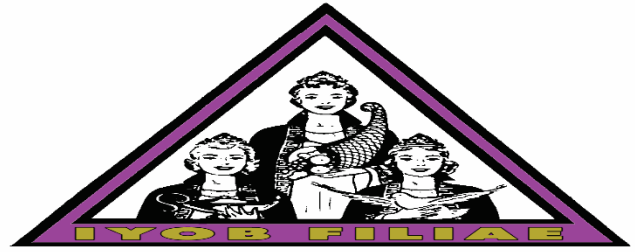
Job's Daughters of Bethel #48: