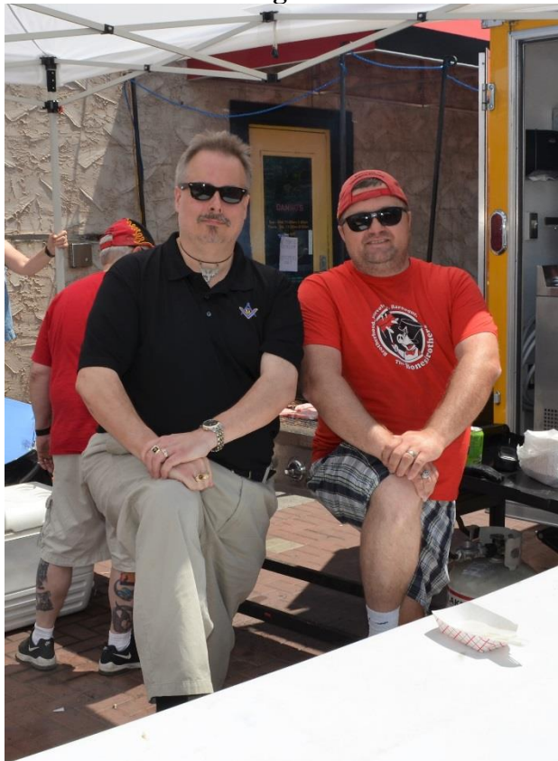
We had a little Pork Chop in us!