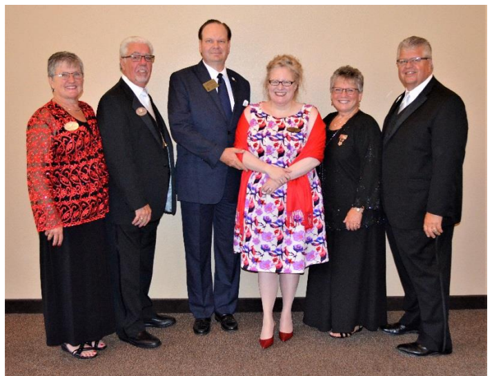
The Grand Officers and their Spouses!