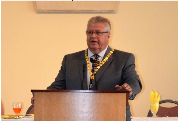
The S.G.I.G Speaks to our Youth!