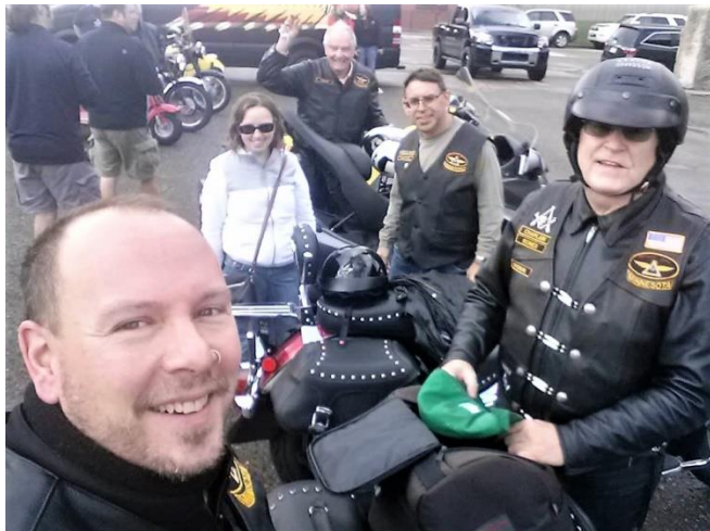
Taking in the Farewell to Summer Motorcycle Show at Norseman Distillery!