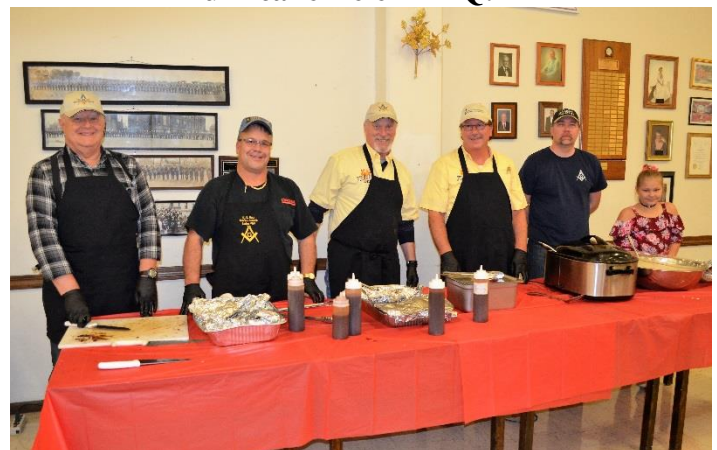
It was a wonderful event & the food was great!