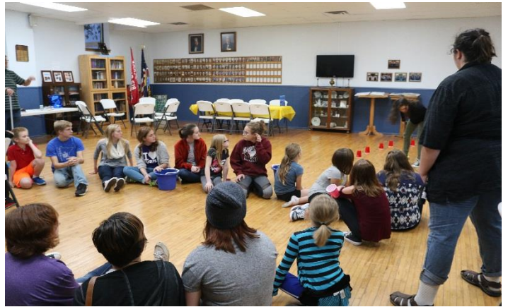
Circle of Sisterhood!