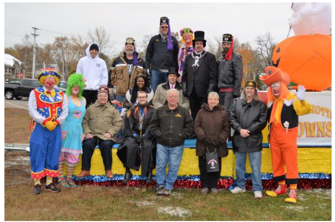
Almost all our Masonic Family sent a Representative for the Float!