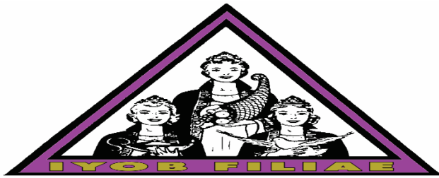
Job's Daughters of Bethel #48: