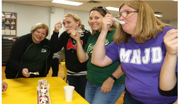
Enjoying the Sewer Pipe Sundaes

Bethel 48 would like to thank all the members of the Lodge, and Martha Chapter for making this event possible, and thank you to the members of Martha Chapter who helped us with the clean up afterwards.