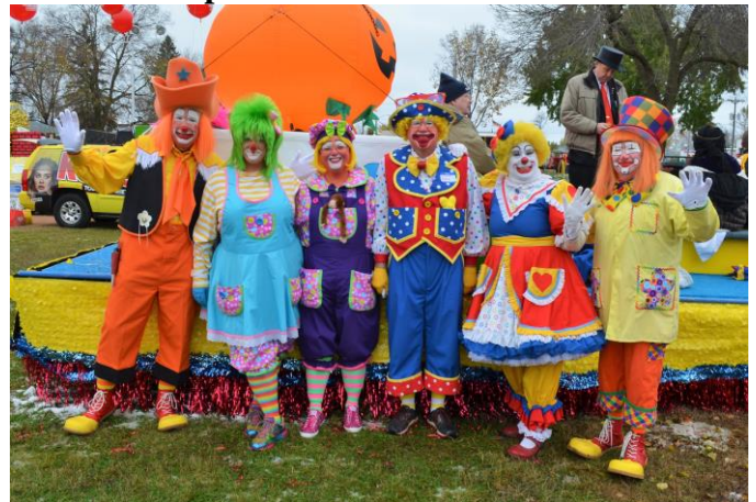
The Grotto Clowns were kind enough to let the Rest of the "Family" piggy-back on their Float!