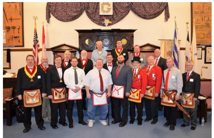
Putting on the Past Master and Most Excellent Master Degrees at Anoka Lodge!

In accordance with making sure they can continue to support these charities they will be making dinner for the lodge during the Master Masons Degree on Wednesday, November 15 th . So if you don't want to come to the degree, at least come down to dinner at 6pm and help support those elderly folks who will benefit from your generosity!