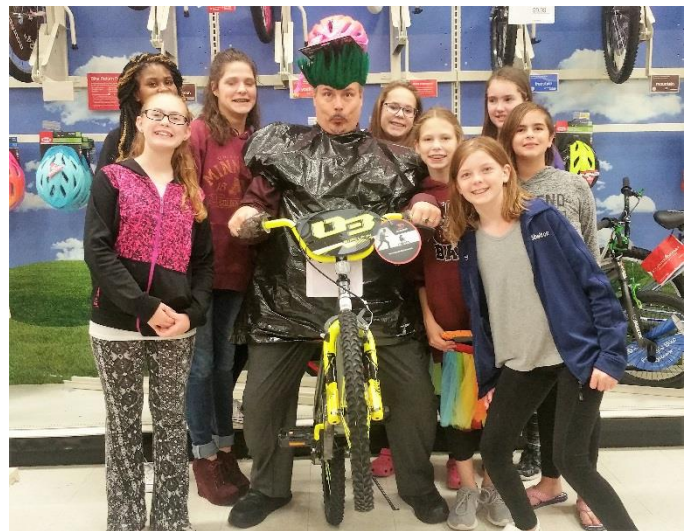
Enjoying a great tradition by being Kidnapped by the Fairest in the land of Bethel #48!