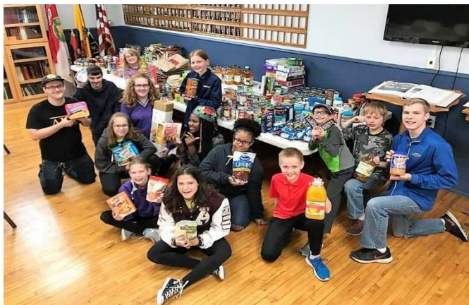
Collecting Food for Hope for Youth!

Along with the young ladies of Bethel #48, our partners in crime, we went out and collected a whole bunch to help those people who really need it, and at the same time had fun!