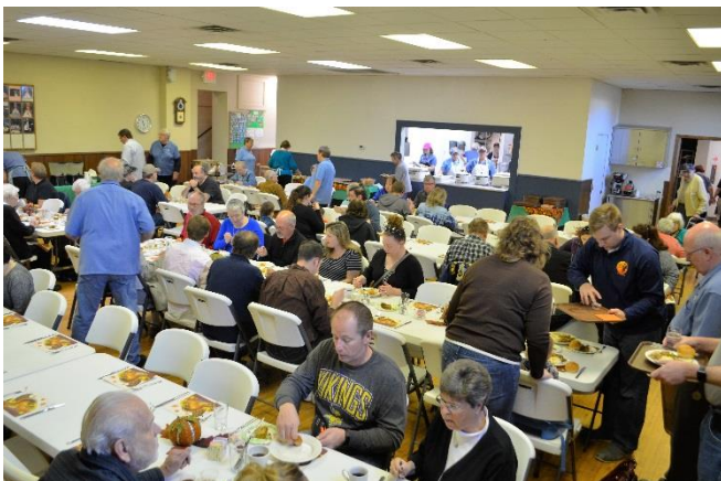
Harvest Dinner 2016, this could be you!