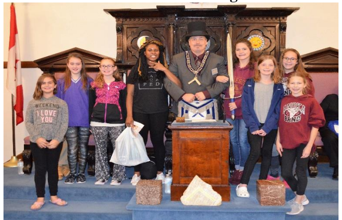
The Jobies of Bethel #48 kidnap the WM!