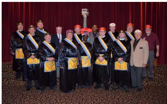
The Cast of Brothers for the 20 th Degree!

First off thanks to all those who came down for our Adopted 20 th Degree last month. The Cast was great as always and I am honored to have been a part of it these past couple of times!