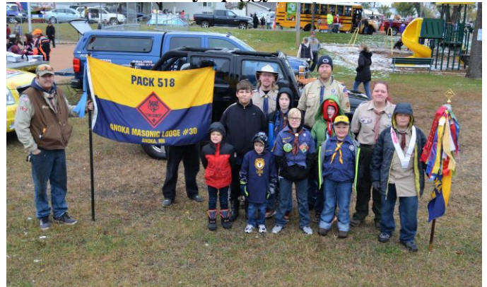
The Scouts came and passed out candy again!