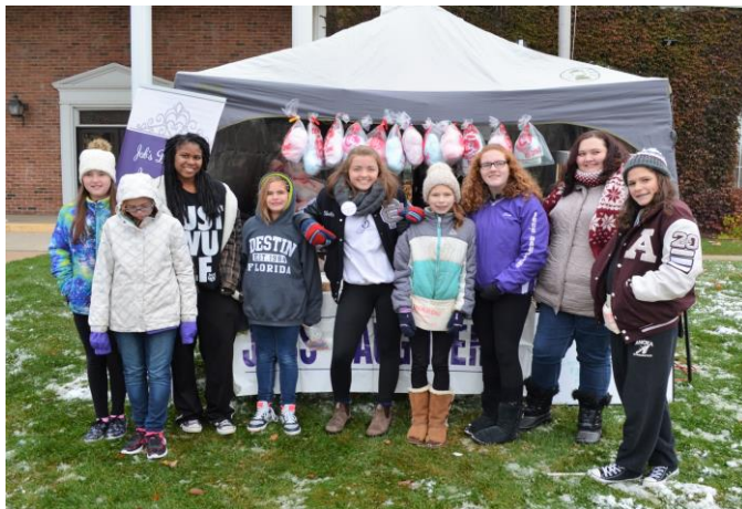
The Fairest in the Land had their Cotton Candy and other items!