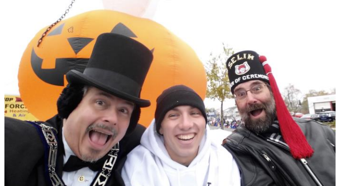
Though Cold, we all had a great time!