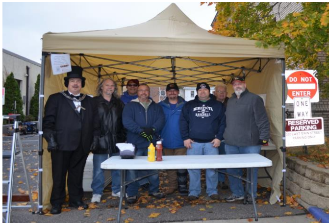
The Crew was all set to sell food at the Anoka Halloween Parade!