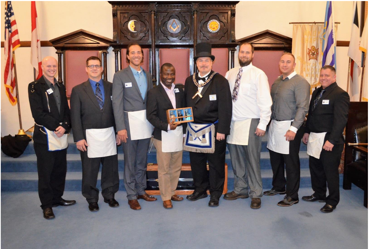
Our Newest Fellow Crafts at Anoka Lodge #30!