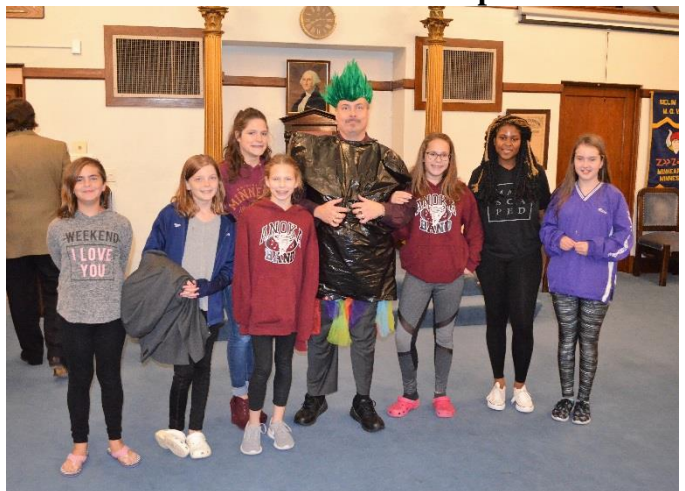
Bringing him back a shattered man!