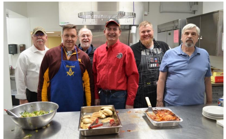
Making dinner for Anoka Lodge #30 as we raise funds for our Charity Work!

The members of Anoka Shekinah #104 presented a check to Granny's Closet, an organization that provides gifts to the elderly during the holiday season and birthdays!