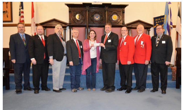
Presenting a check to Granny's Closet!