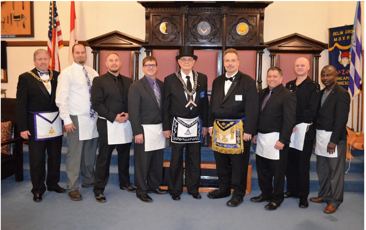
Our Newest Master Masons at Anoka Lodge #30!