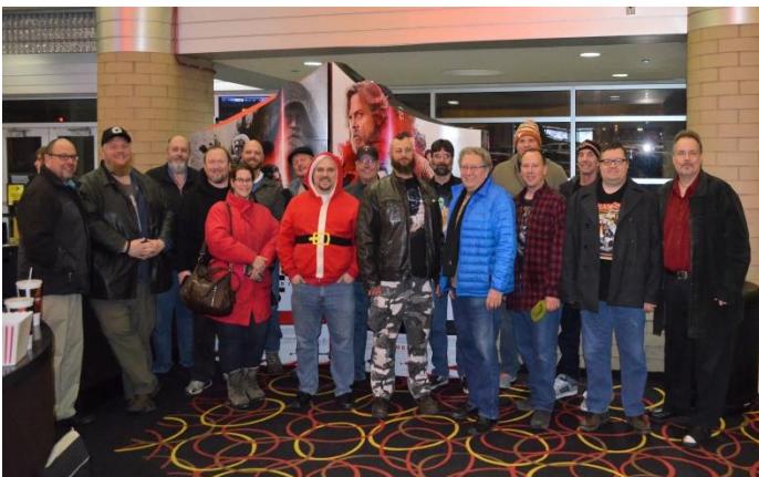
One of two groups of Brothers, Friends and Family attending our Annual Star Wars Nights!