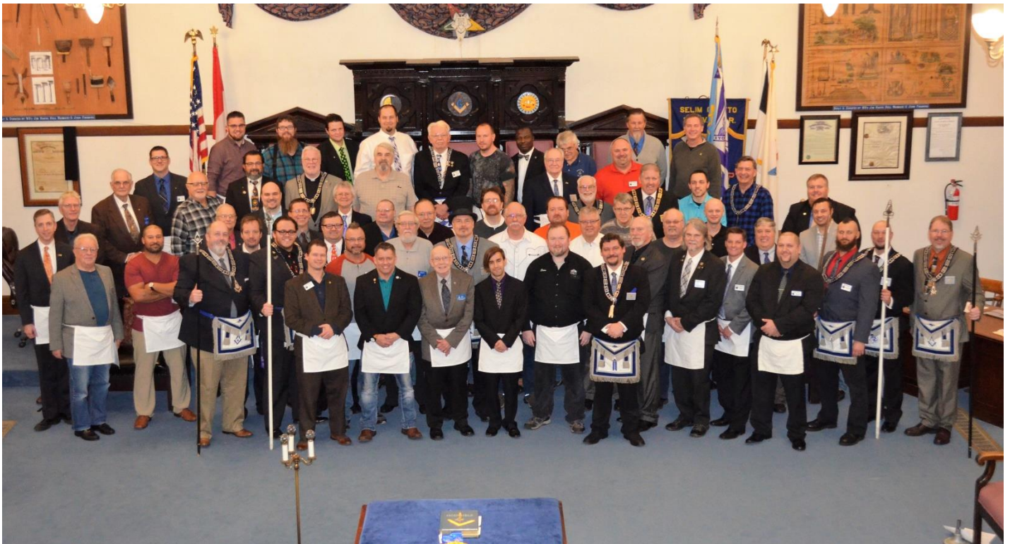
The Brethren of Anoka Lodge #30!

The S&C will be looking for a New Editor at the end of 2018, please reach out if you have any interest in taking it over.