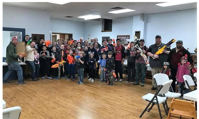
6 th Annual Zombie Apocalypse Survival Party!