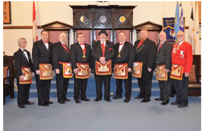
Anoka Shekinah #104's 2018 Officers!