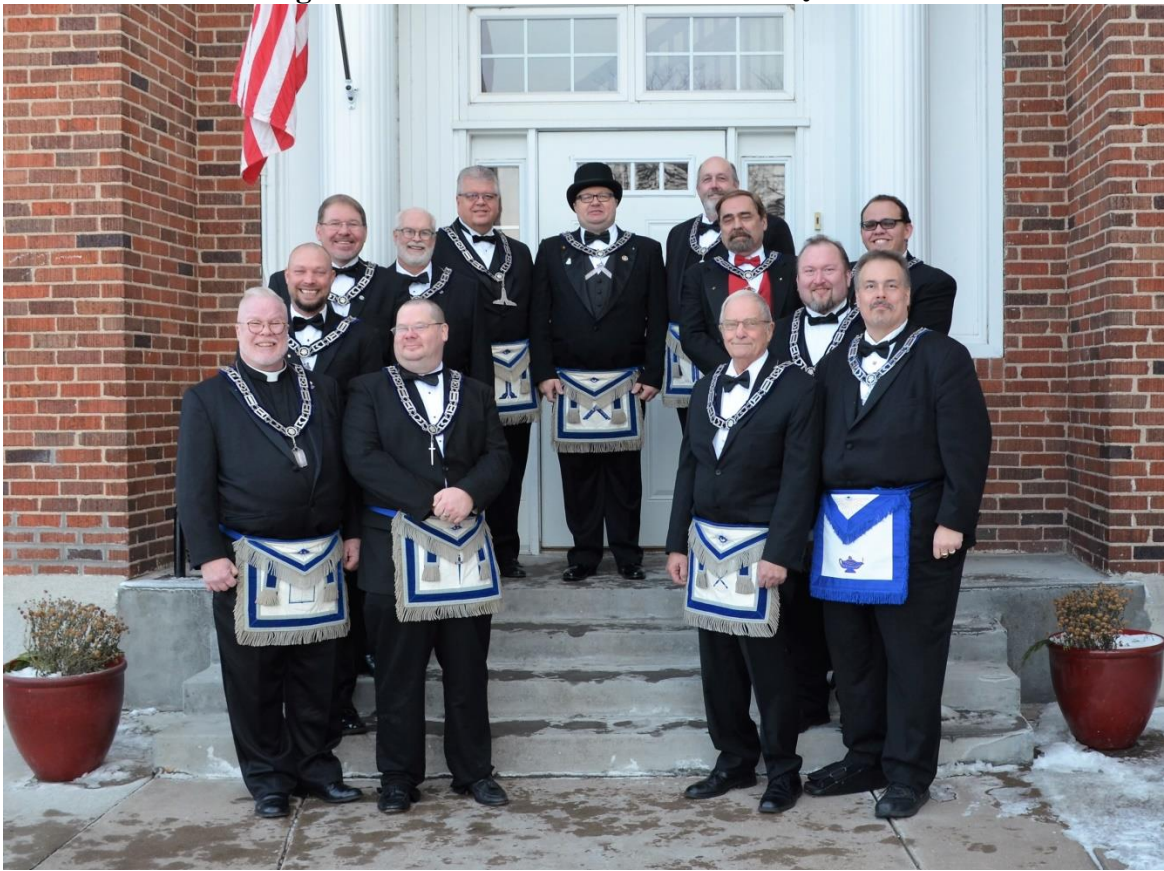
Your 2018 Officers!