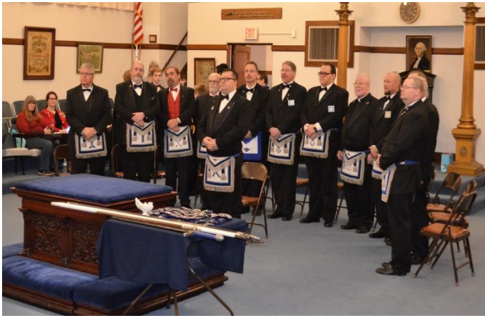
The Officers of Anoka Lodge are Installed!