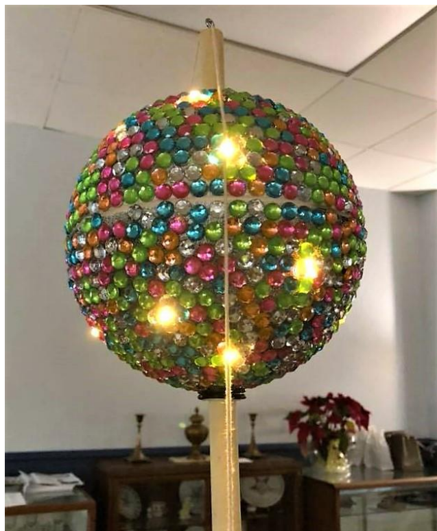
The Ball Dropped at 8pm!

Martha Chapter again held a New Year's Eve party at the lodge. A good time was had by all who attended, despite the cold night.