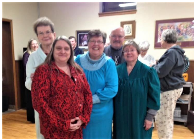
Last Year's Fun!

Our first meeting on January 4th is a relaxing pajama/robe/blanket night. No pillows....we don't want anyone falling asleep! It's always a fun night.