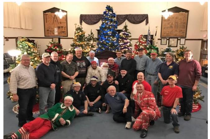
Our Annual Breakfast with Santa!