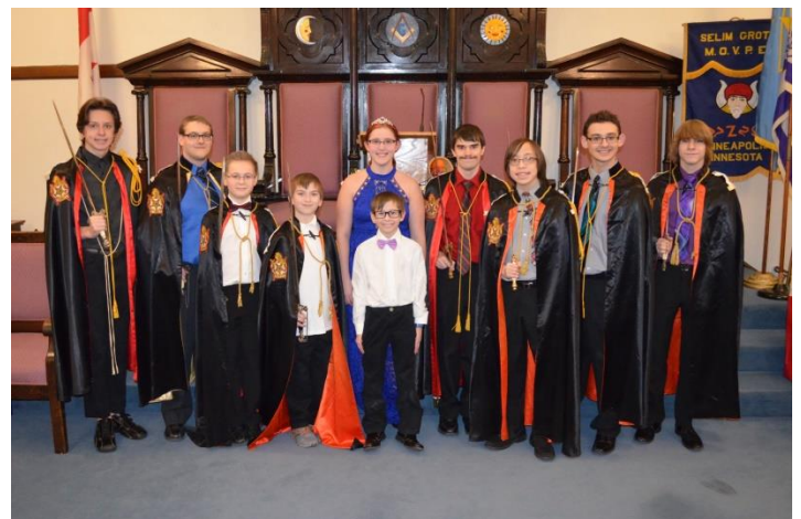
The Anoka & Robinsdale DeMolay assist with the Installation for Bethel #48