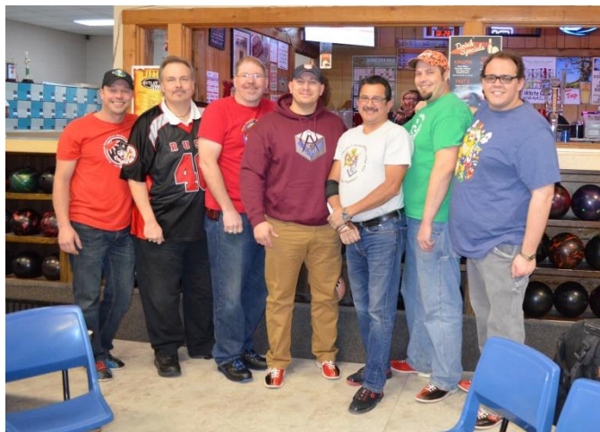
Anoka Lodge #30 Participates in the Fraternal Lodge #92 Bowling Tournament!