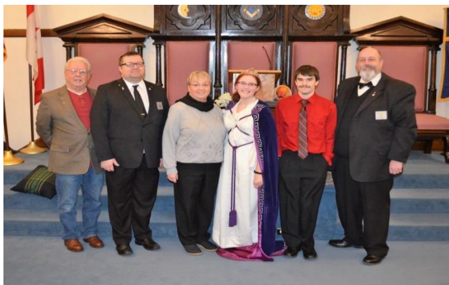
The Anoka Family Heads of Bodies at the Bethel #48 Installation!