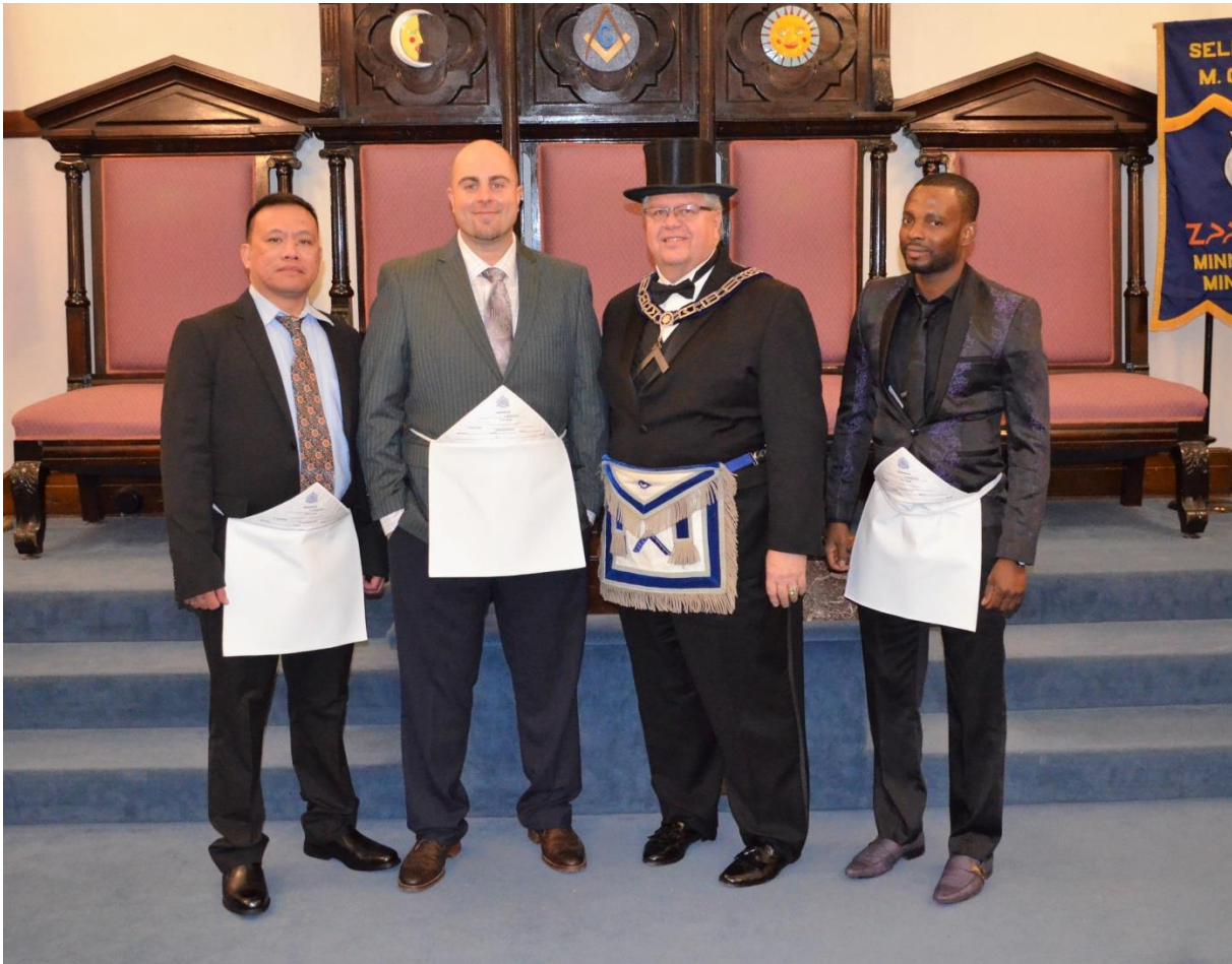
The Newest Entered Apprentices for Anoka Lodge #30!