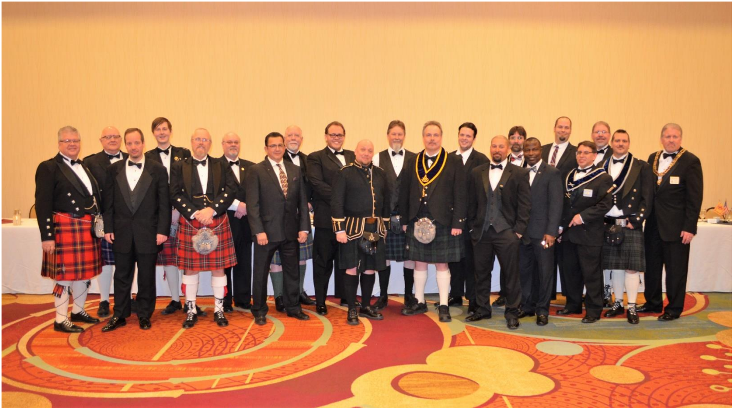
22 Anoka Lodge Members attend the Highland Table Lodge!