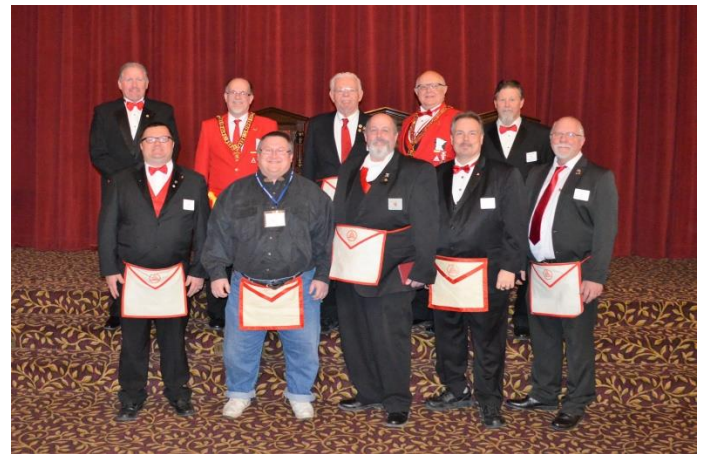
Our Newest Royal Arch Mason!

March 3 rd , 9am – Commandery (Knights Templar)