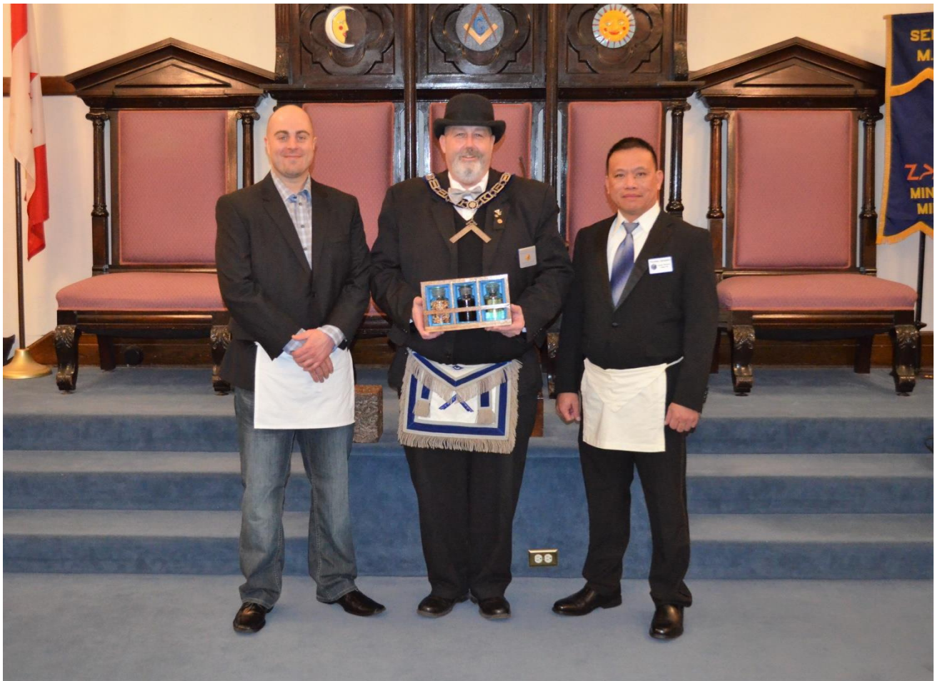
Our Newest Fellow Crafts at Anoka Lodge #30!