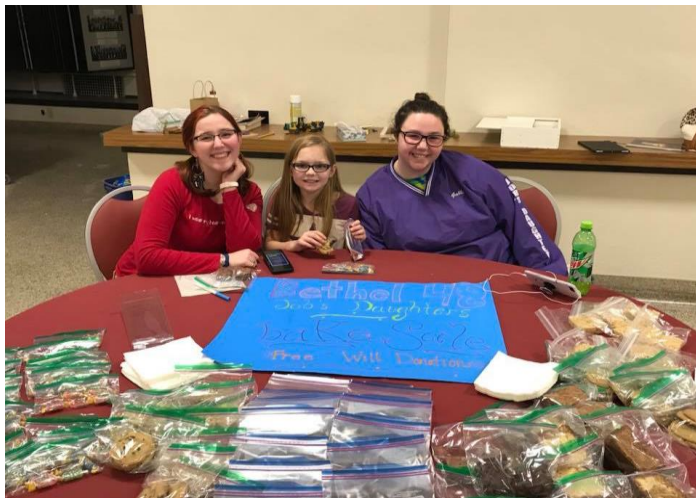
Selling Treats at the York Rite Degrees!