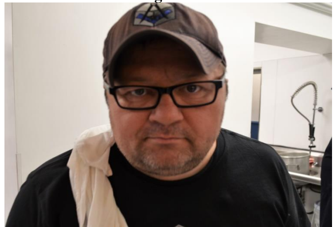
The Worshipful Master Was Pleased!?!