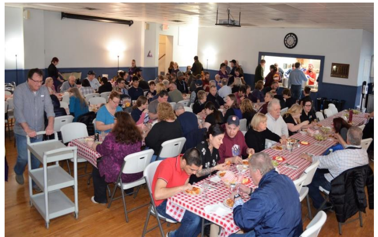
We had a great turn out!