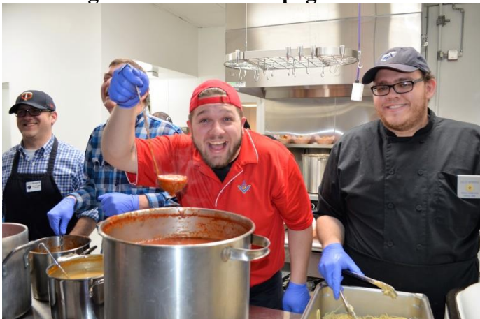
These Brothers were serving it up!