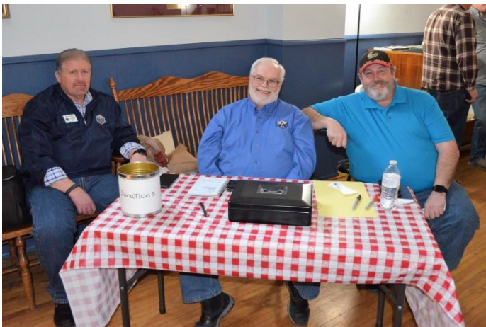
Selling tickets for the 1 st Spaghetti Dinner!