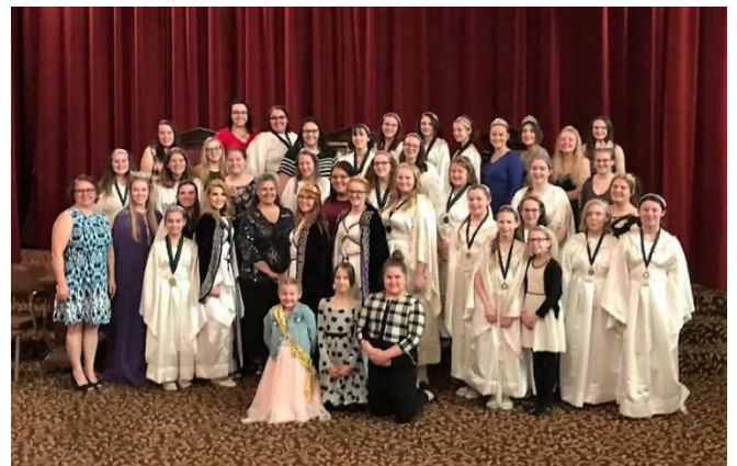
Grand Bethel Exemplification