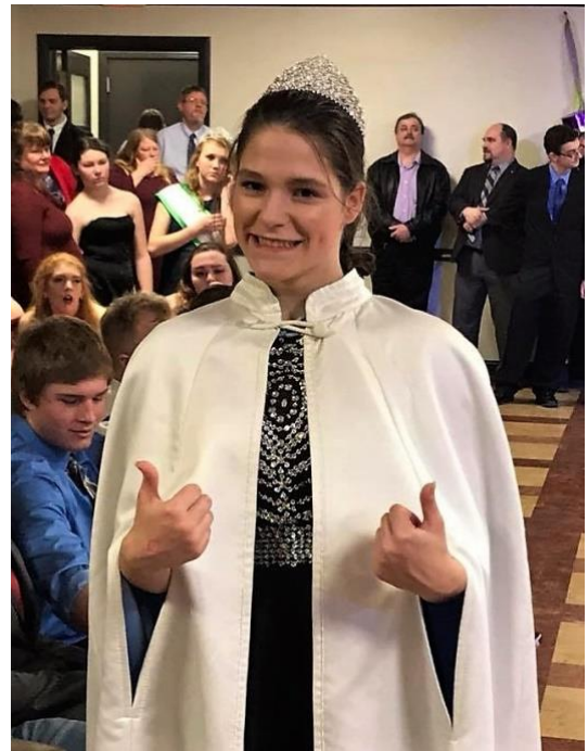
The New Snowball Dance Queen!