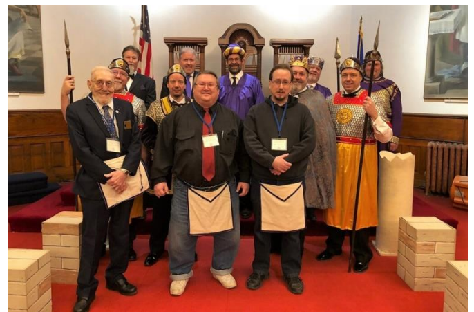
Our Newest Cryptic Council Mason!

Check out the Website: MNYORKRITE.ORG or call 952-948-6750