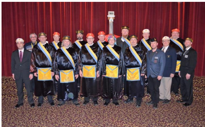
So many Brothers come down for Anoka Lodges Adopted degree at the Rite!

For tickets contact the Scottish Rite offices!