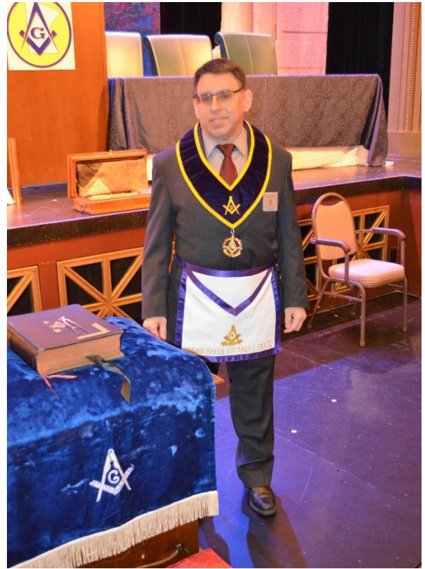
WB Al Becomes Metro East Custodian!