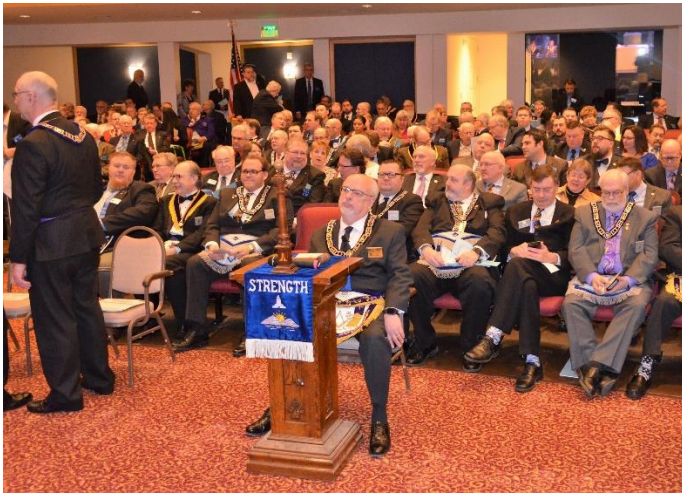
Anoka Lodge attends Grand Lodge!