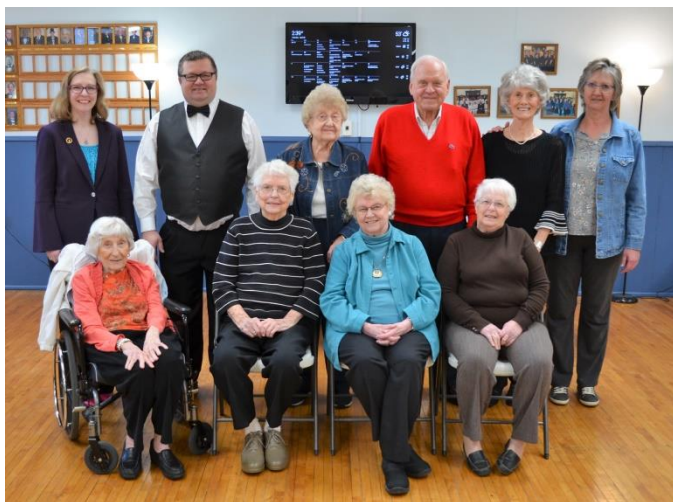
Honored Ladies Luncheon