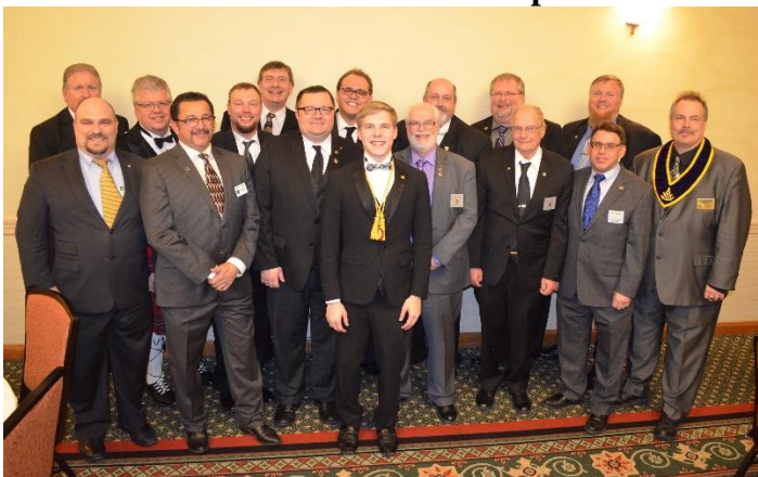
Anoka Lodge at the Grand Banquet!