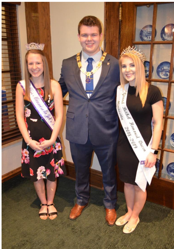
Our Masonic Youth at Grand Lodge!