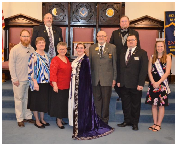
Anoka's Masonic Family Leaders as well as the Grand Worthy Matron and Grand Master of Minnesota Masons at the Masonic Honoring!