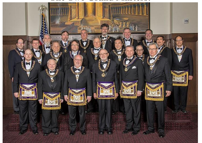
Our New Grand Lodge Officers