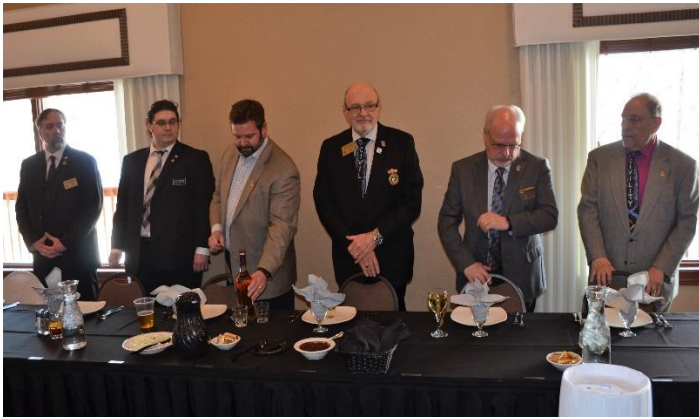
The Grand Master at the Lynnhurst Dinner!