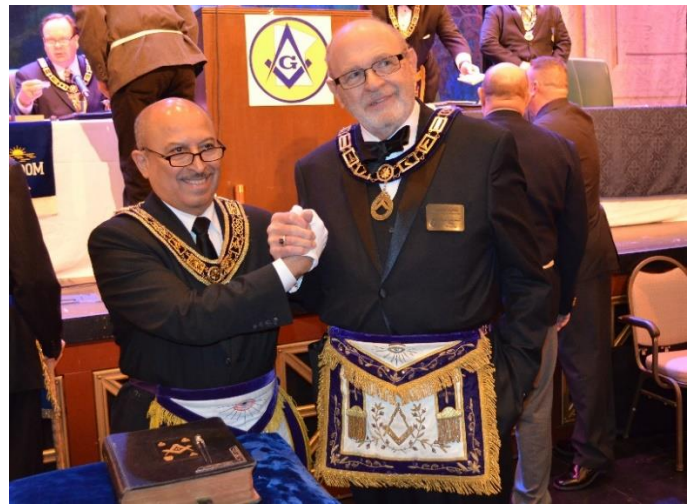
The Two Grand Masters!