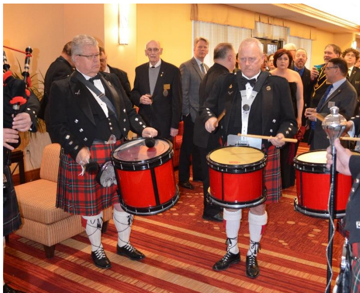
Playing at the Grand Lodge Banquet!