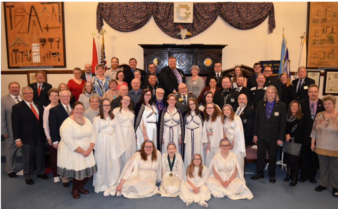
The Bethel #48 Masonic Honoring with the Entire Anoka Masonic Family!