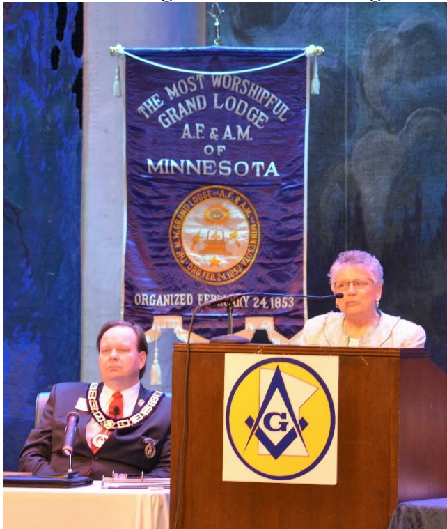
The Worth Grand Matron Speaks!