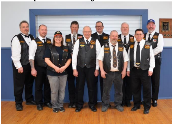
Assisting at the Widows Luncheon

May 19 th – We will have our first official ride of the year. Beginning at 10am you can come out and take a turn with us, even if not a member yet, get the dust off your bike and join us!