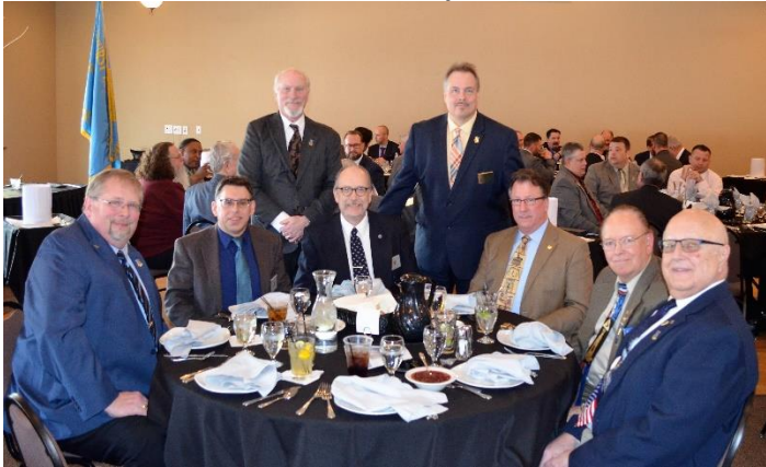
Anoka Lodge Past Masters Table!