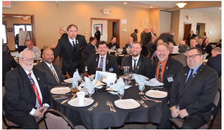
Anoka Lodge at the Lynnhurst Dinner