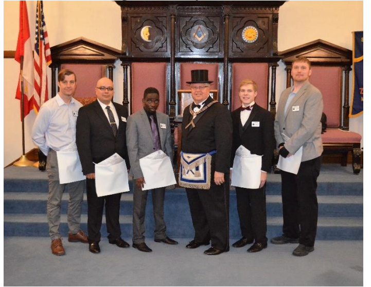
Our Newest Entered Apprentices