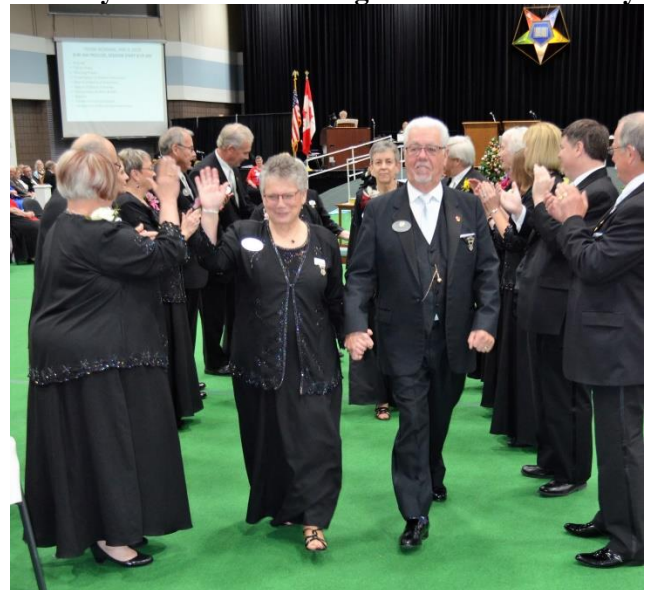
The Outgoing Worthy Grand Matron & Patron!