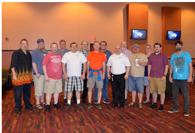
The Anoka Brothers gather for a Movie Night!