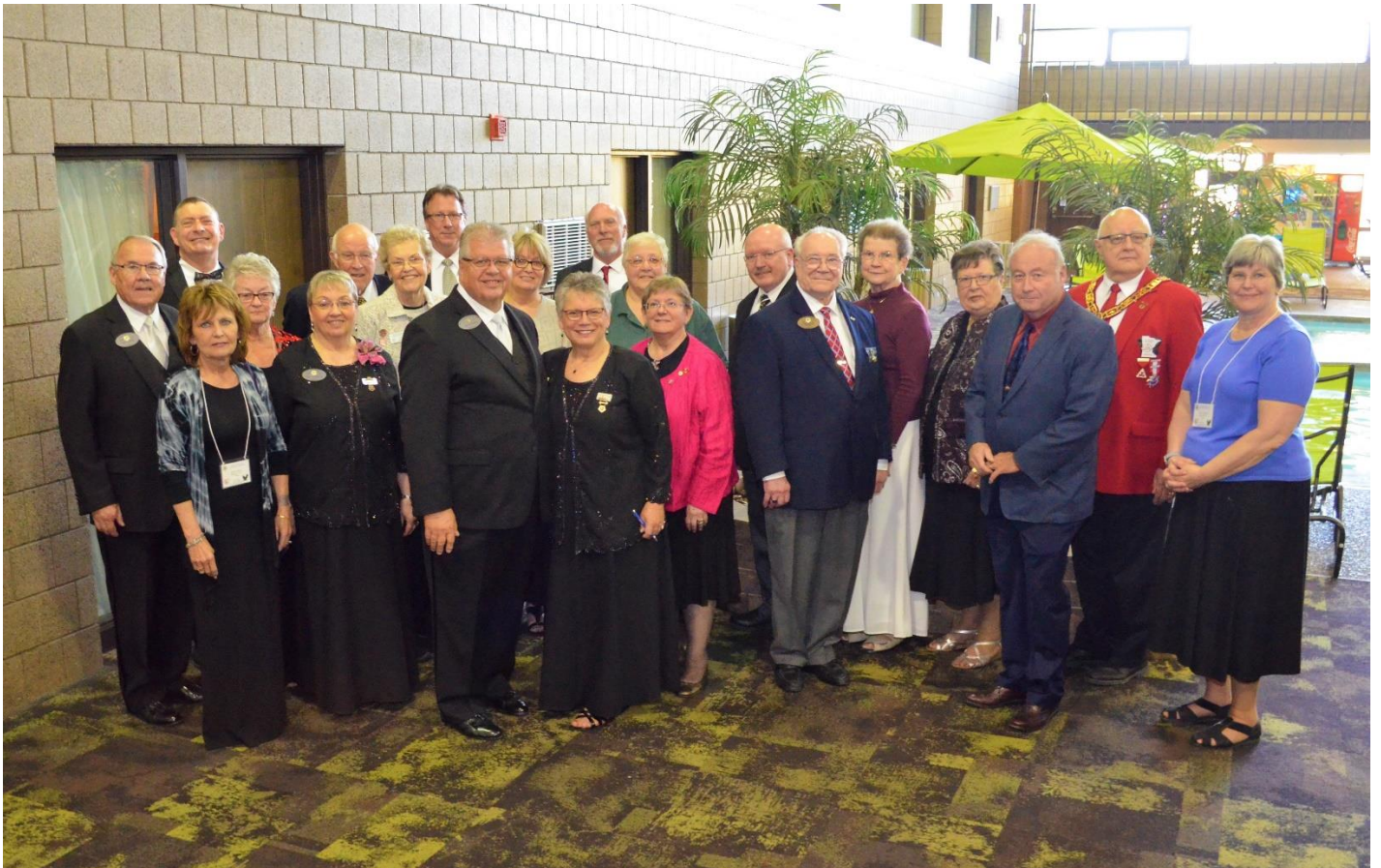
The Members of Martha Chapter OES at the Grand Chapter Session!