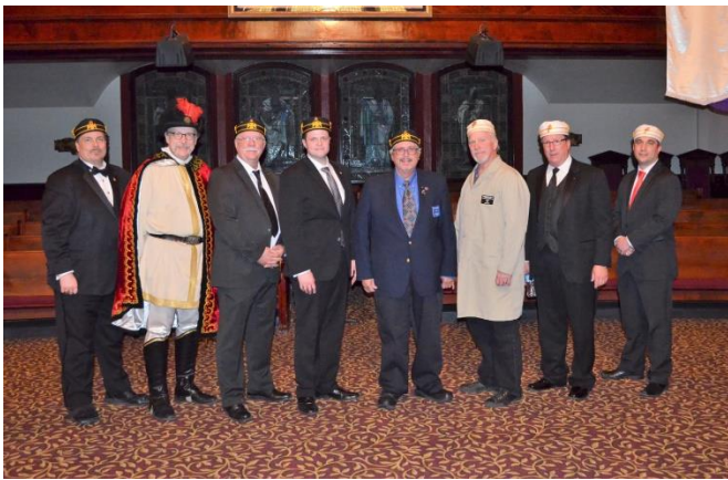
Anoka Lodge Members join the Rite!

The Spring Reunion went very well and we had 3 Anoka Brothers become Masters of the Royal Secret for the Scottish Rite!