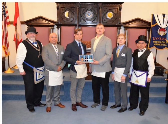
Our Newest Fellow Crafts at Anoka Lodge #30