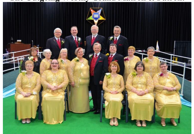
The New Grand Family!