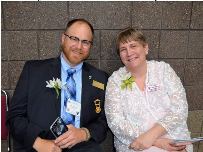
Attending the Grand Chapter Session!