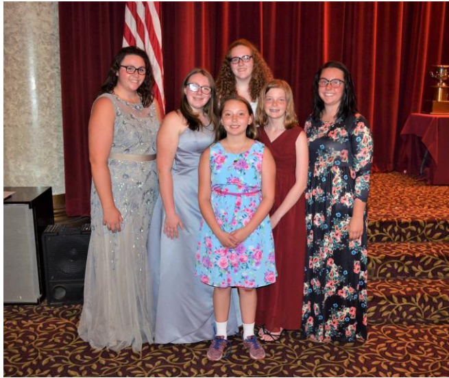
Looking our Best for the Winners!

At the Beginning of June, members of Bethel #48 helped escort the Winners down at the "Scotie" Awards for the Minneapolis Valley of the Scottish Rite!