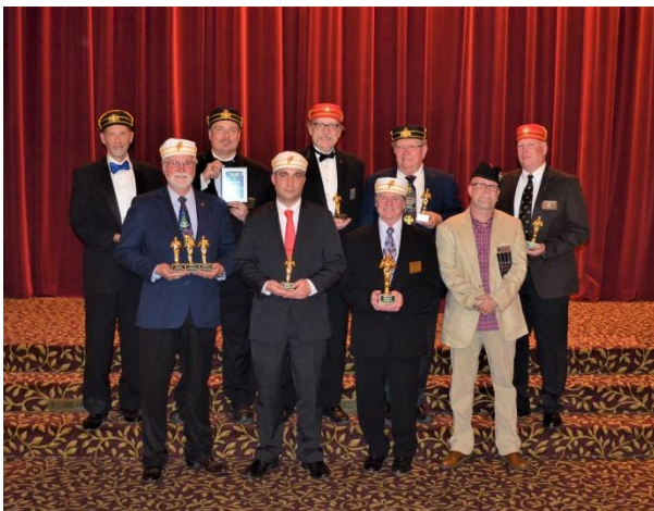
All the Winners at the Scotties!