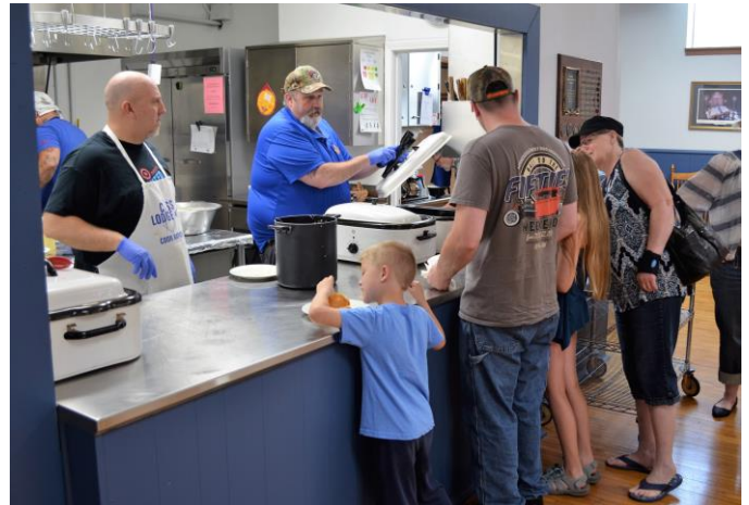
Cooking up the Father's Day Breakfast!