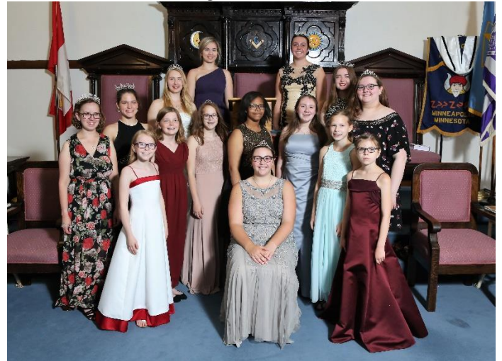
The Officers of Bethel #48 and their Installing Officers all dressed up!