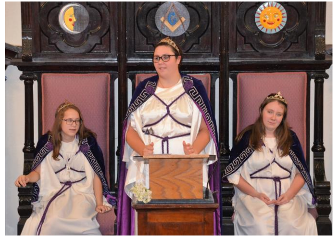
The Honored Queen and Princesses!