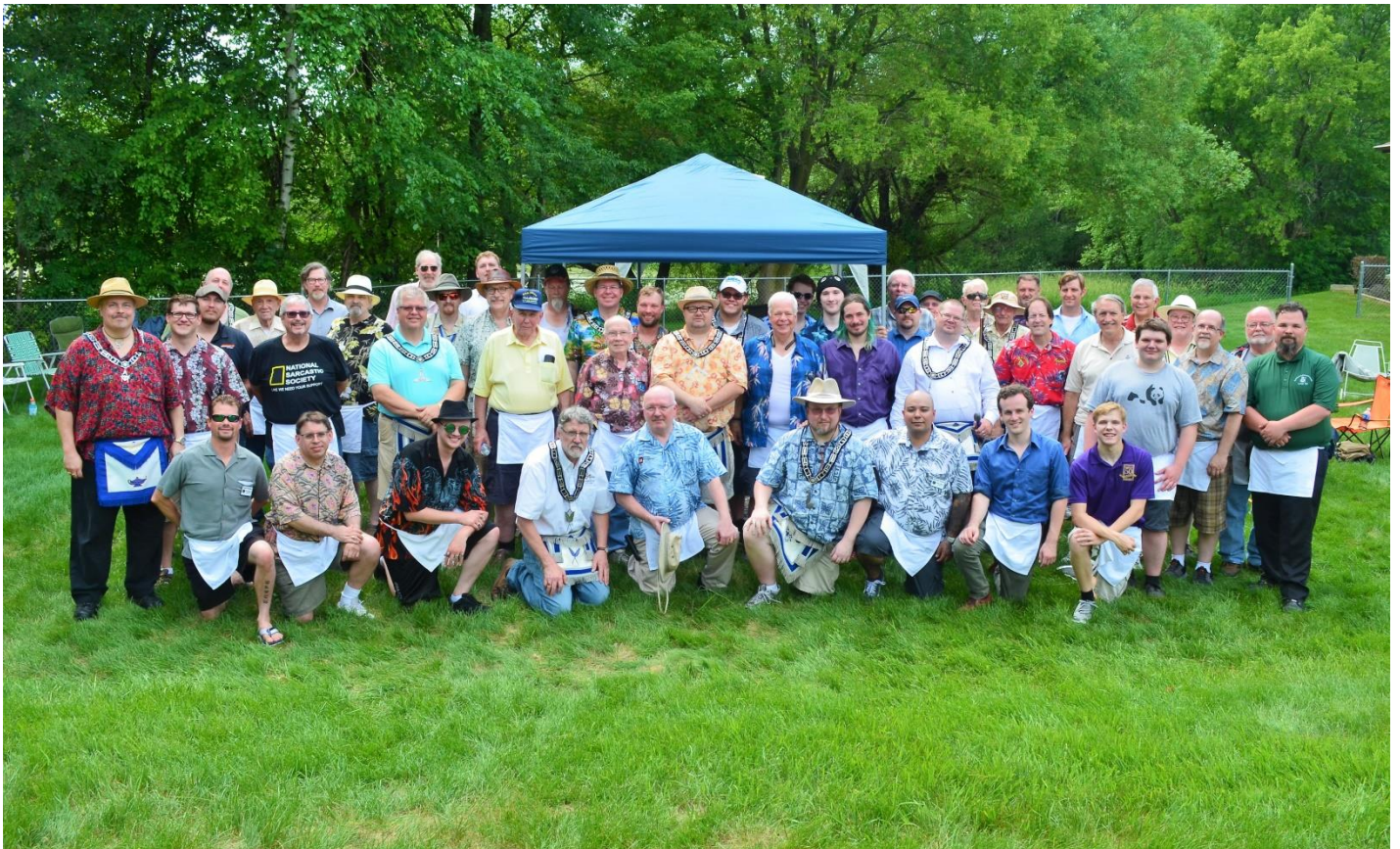
Anoka Lodge's Outdoor Degree!