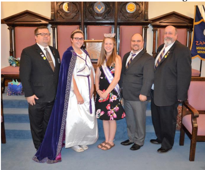
The Anoka Masonic Family Attends the Bethel #48 Installation!