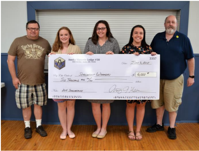
Giving out our Annual Scholarships!