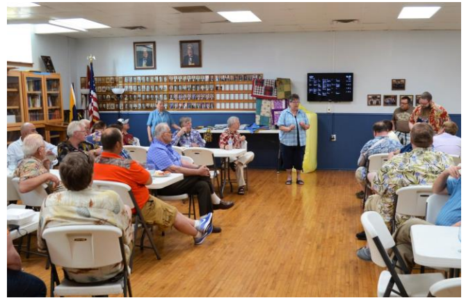
The Ladies of the OES giving a Demonstration of their Blanket Making Efforts to the Lodge!