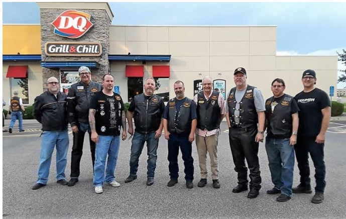
The Place we Ride to most!

We are an appended body, an organization of men that love motorcycles. We meet at Anoka Lodge. Our mission is to help and assist our Masonic Widows, Orphans or just Brothers in need.