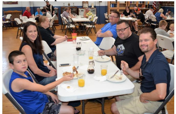
The Master and Many Families came out!