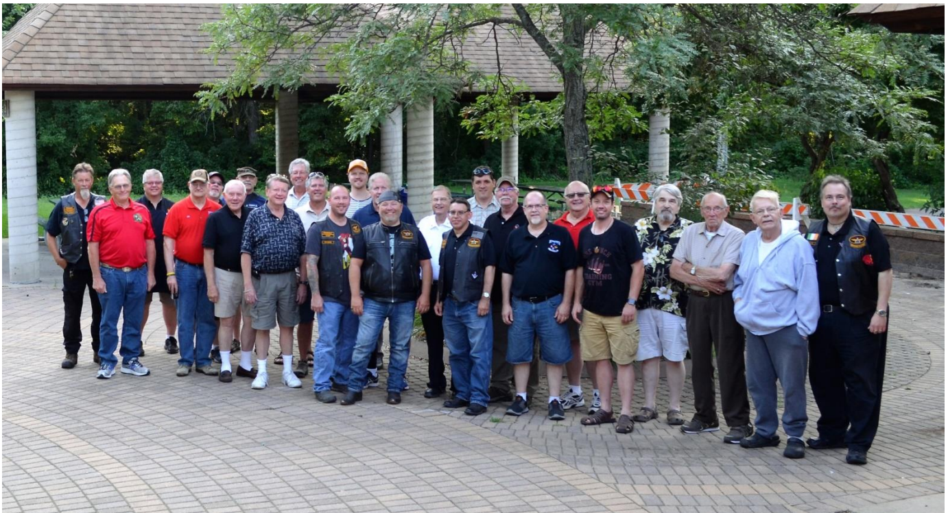
Richard F. Hunt York Rite Memorial Picnic!