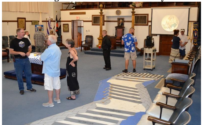
Both Upstairs and Downstairs