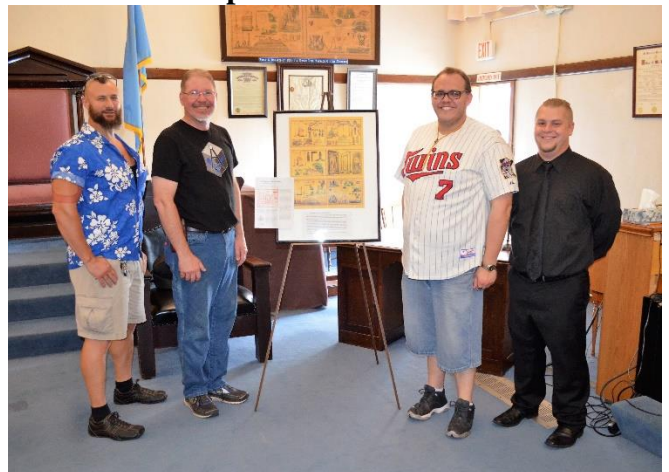
Getting Lots of help from the Brethren!