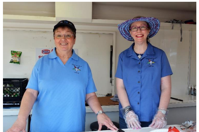
Selling Brats at Cub Foods for the Eagles Healing Nest!

Here's to camping, picnics and pontoon rides,