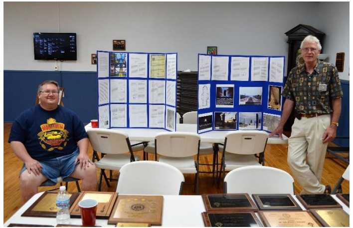
The Brothers working the displays Downstairs!