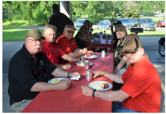
York Rite Picnic!

Though Dark for most of the Summer, the York Rite Bodies held their Annual Picnic and it was another great turn out of Fellowship and Good Food!