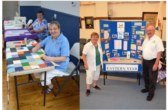
Doing Demonstrations and information for the Anoka Garden Party!