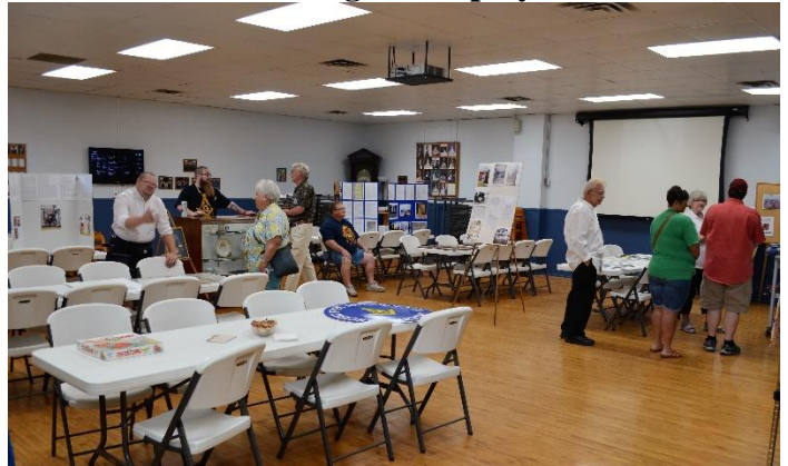
Talking to those folks who came by!