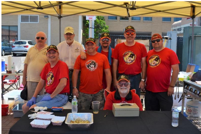
Anoka Lodge working Riverfest!