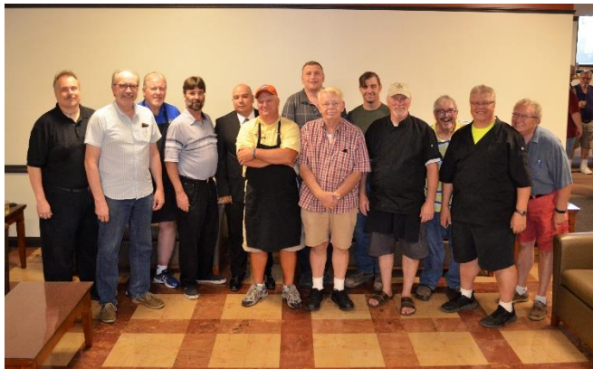
Anoka Lodge Brothers at the Open House!

As always the food was great and Anoka Lodge had a large presence as always and continues to be a large part of the successes at the Minneapolis Valley. Thanks to all those we made it down to join us!