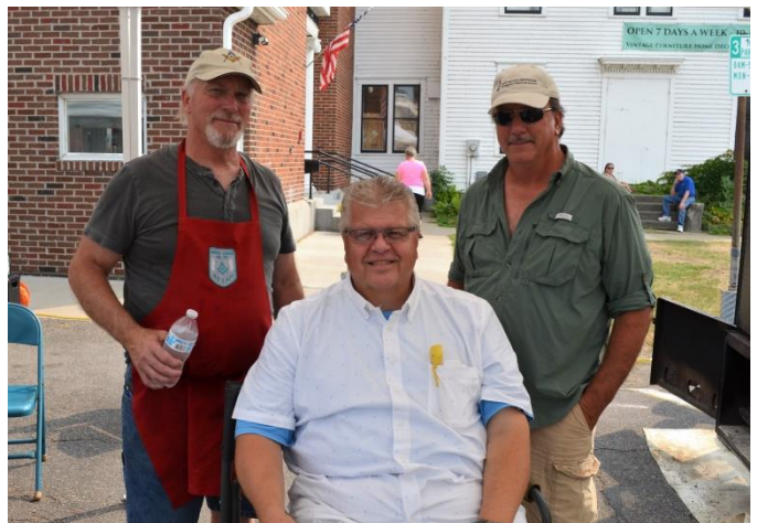
Working the Just a “Little Jamaican Event!” Brotherhood at its Best!