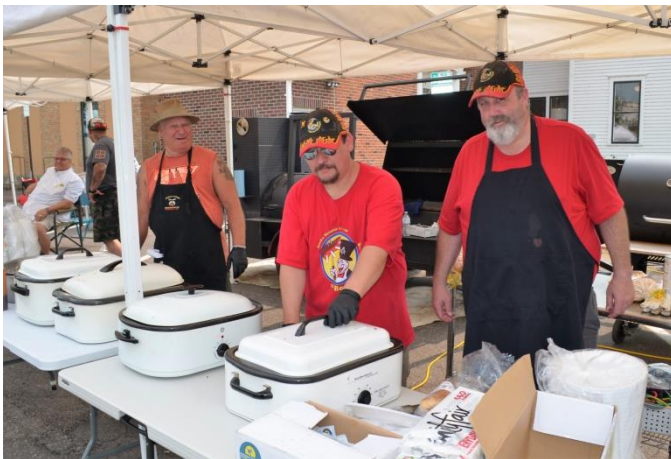
They cooked up some great food!