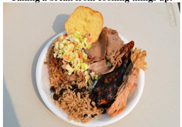
You don't want to miss this food next year!