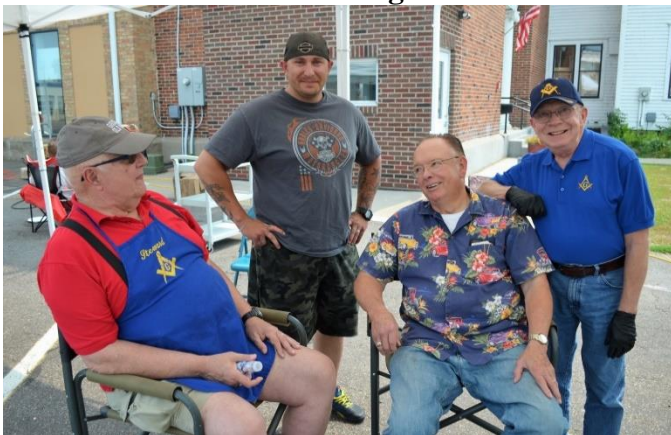
So much good fellowship was had too!