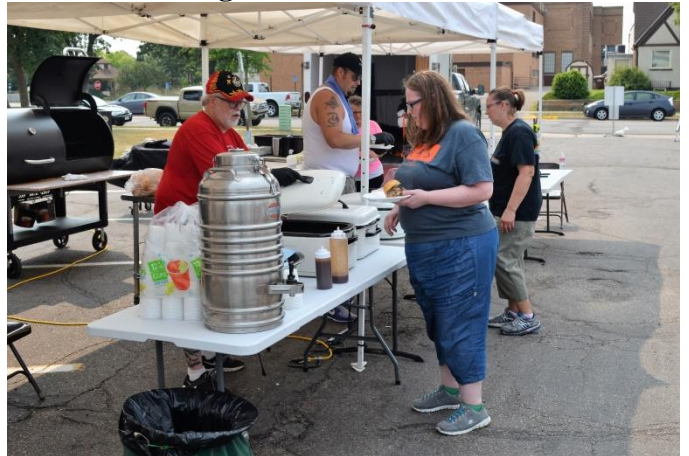
And were serving it up!