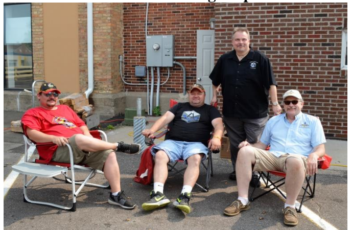
Taking a break from cooking things up!