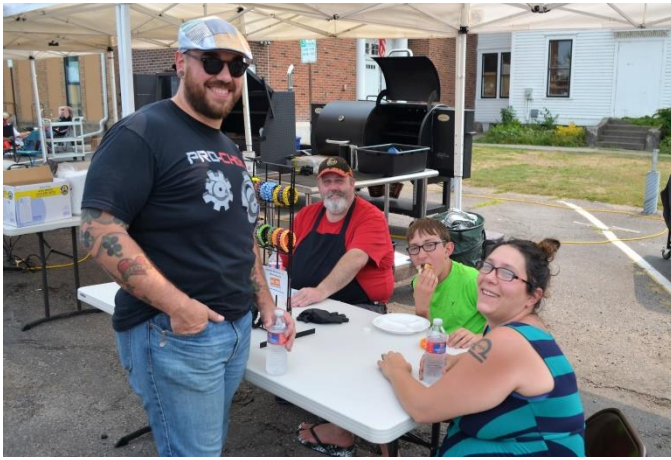
Just a Little Jamaican Event!