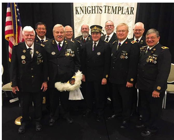
Attending the Grand Encampment Held in Indianapolis!