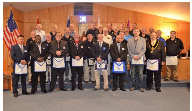
Anoka Brothers (Down Front) Visit #344

We had a good showing of Brothers in attendance and got to see their Scholarship Presentations and a good meal.