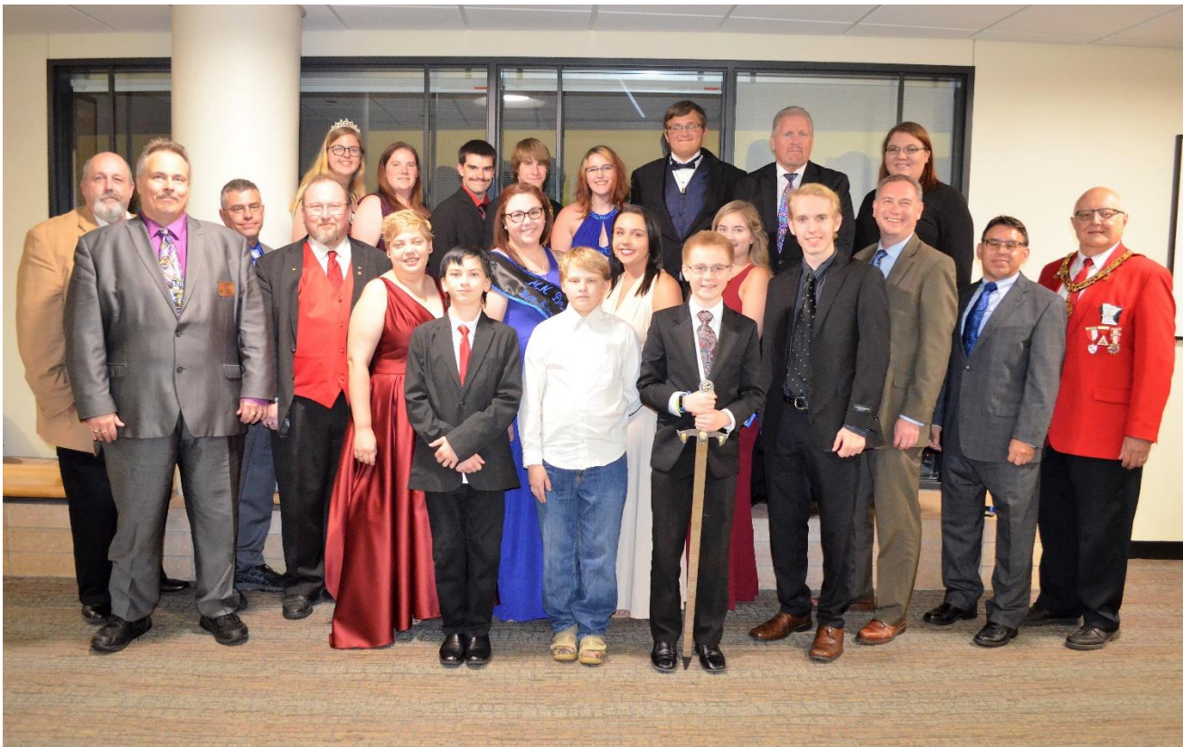
The Anoka Masonic Family at the DeMolay Conclave!