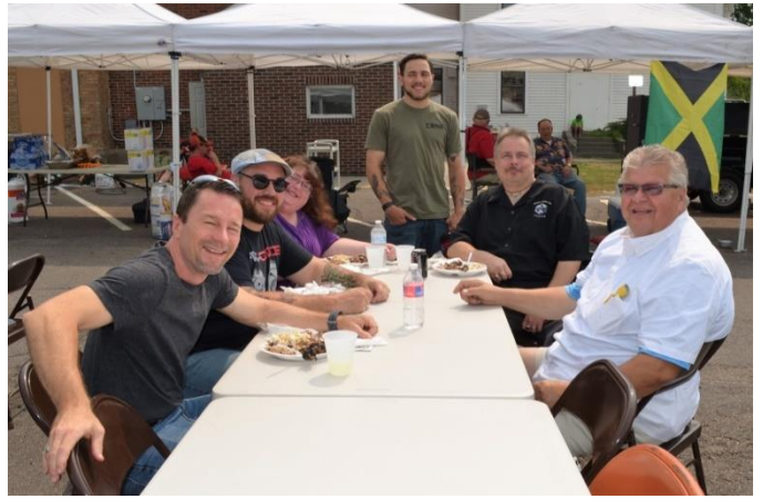
Brought out all sorts of folks