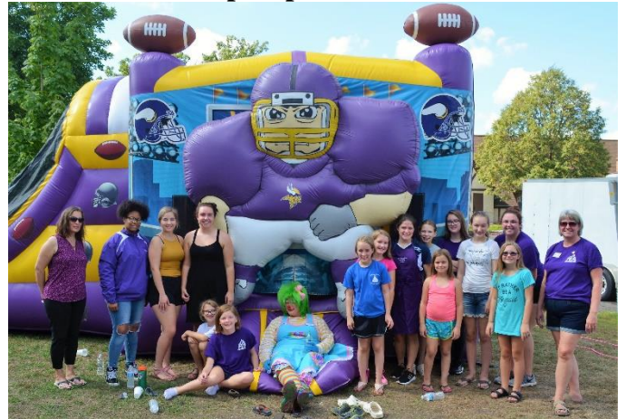
The Jobies of Bethel #48 run the Bouncy House!