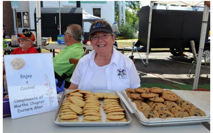
Martha Chapter provides the Cookies!