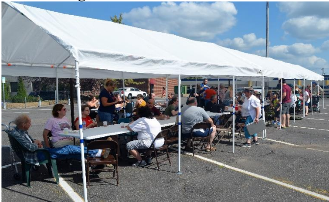
Another successful Ribs, Bibs & Blues Event!