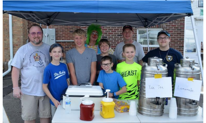
The Anoka DeMolay do the Hot Dogs!