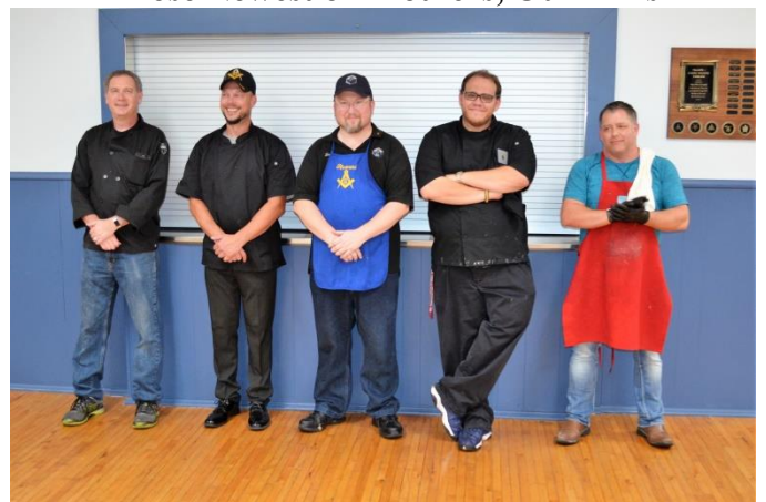
And the Fine Team of Cooks and Stewards!