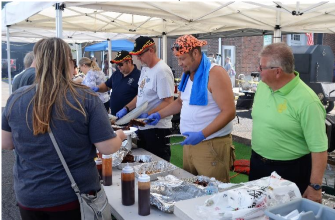
Working the Line!