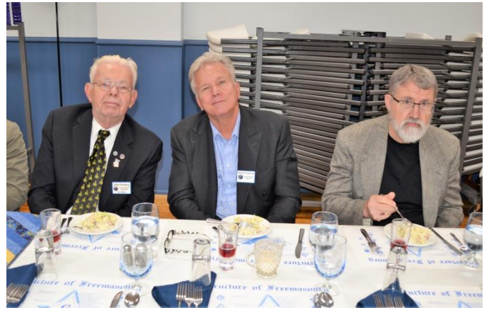
With Old Brothers and those newly Returned