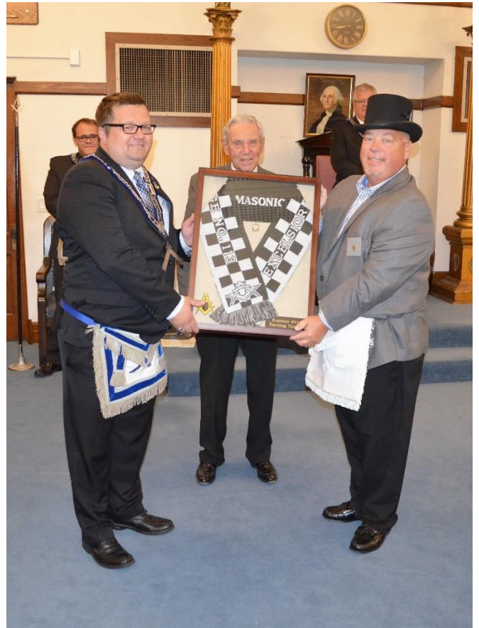
The WM of Lake Harriet Lodge #277 brought us the Excelsior Lodge Travel Trophy!