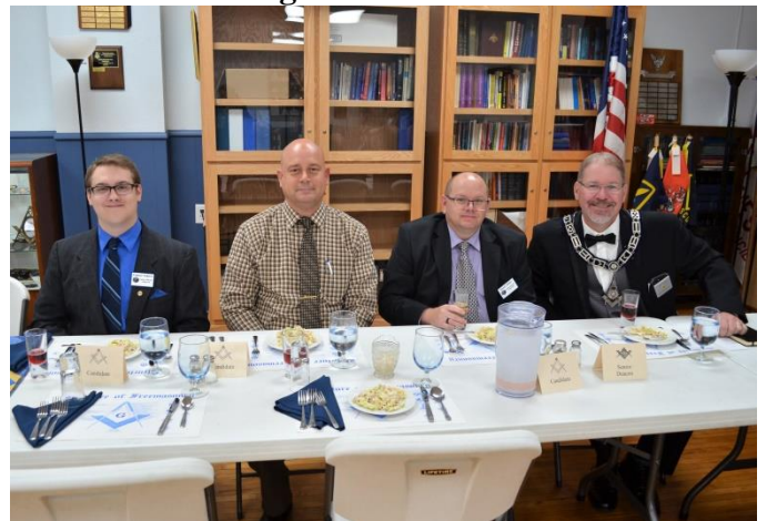
Those Newest of Brothers, Our EA's