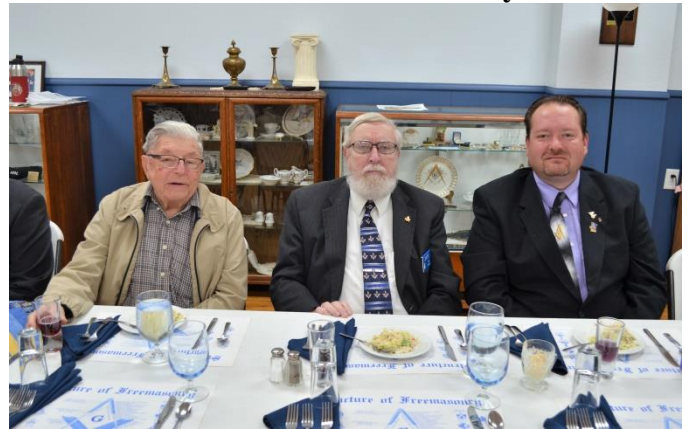
As well as generations of Brothers!