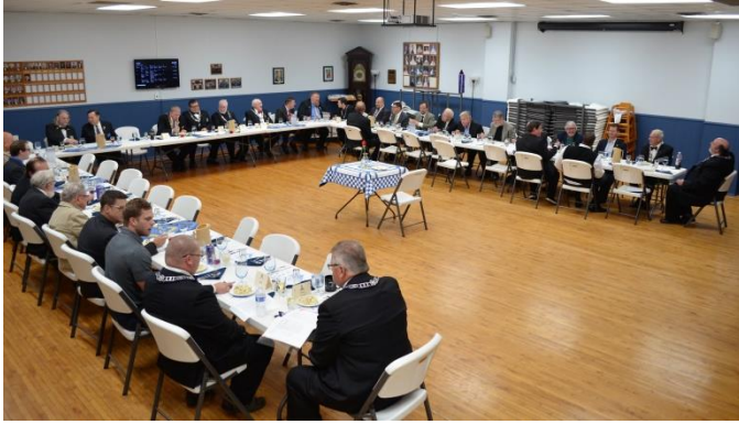
A Small but nice Gathering