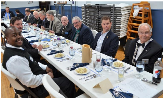
Everyone having a good time!