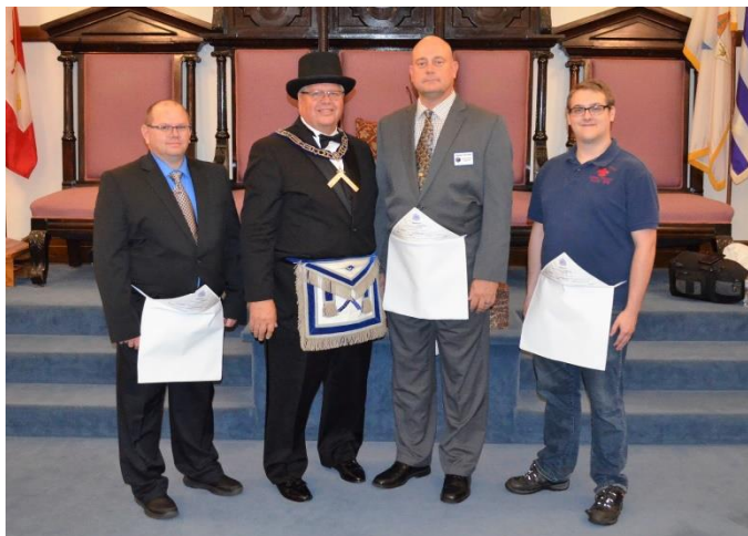
Anoka's Newest Entered Apprentices!