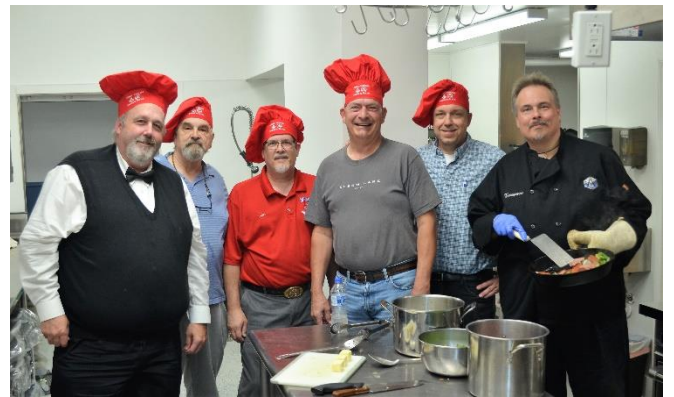
Cooking up Dinner for Anoka Lodge #30

Thanks again to the memebtrs fo Anoka Lodge #30 for leeting the members of Anoka Shekinah #104 come and make dinner. All with the purpose of rasing money for the Granny's Closet Organization!