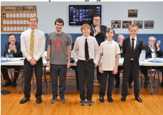
The Anoka DeMolay who helped Serve!