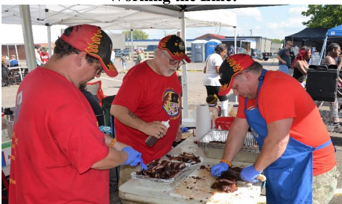
Cutting up the Ribs!