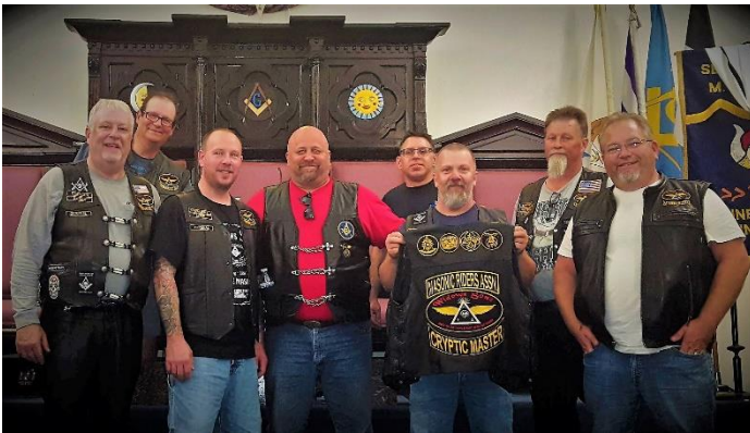
Receiving our Widows Son's Brother from Florida!

We are an appended body, an organization of men that love motorcycles. We meet at Anoka Lodge. Our mission is to help and assist our Masonic Widows, Orphans or just Brothers in need.