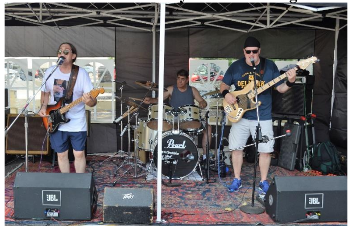
The Band was just great!