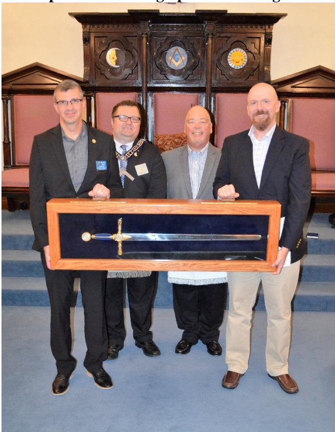
Members of Lake Harriet Lodge #277 come out and take the Proficiency Sword!