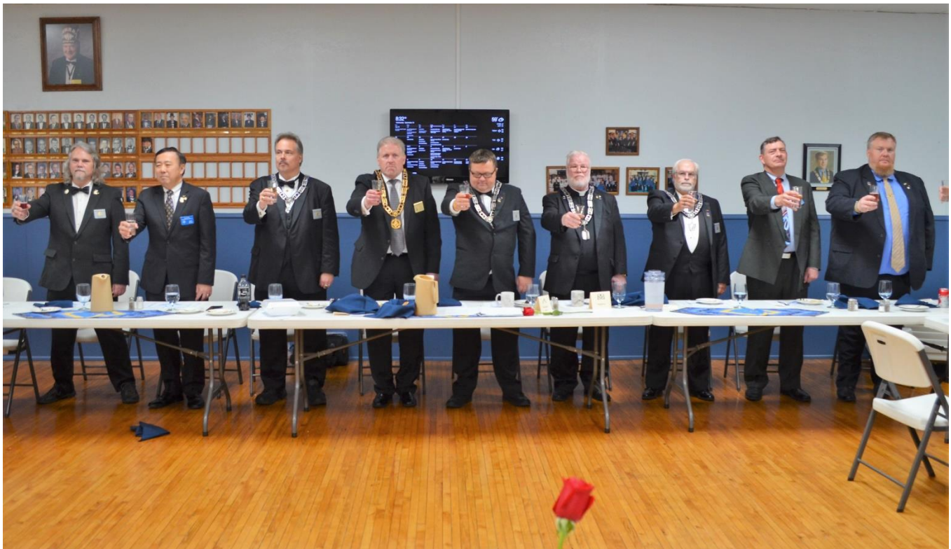
Anoka Lodge #30's EA Table Lodge!