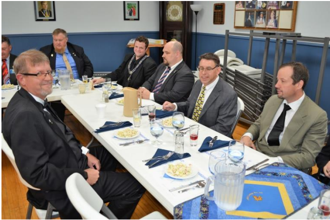
Those Regulars Each Year