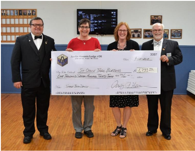
Presenting a check to St. Croix Trail Blazers!